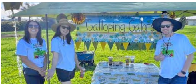
Thank you parents for stepping up and making this event a success!

What's next? The PTO will use these funds to support field trips and transportation, bring engaging assemblies, fund enriching classroom activities, and more to benefit our students.