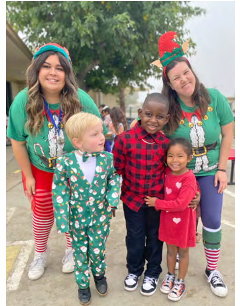
Kinder and TK student and staff pose in their holiday gear.