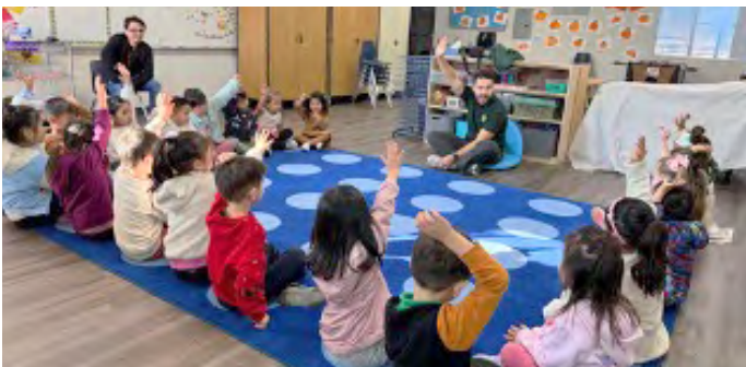
Plavan TK students explore animals up close, using their senses of touch and sight through Inside the Outdoors.