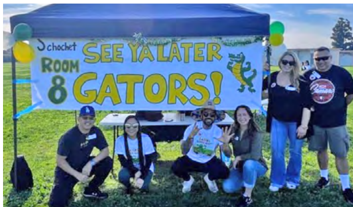
We are so lucky to have an amazing community that pulls together for our kids!