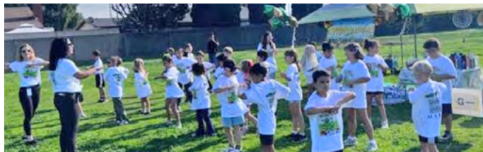
Stretching is an important part of any running activity!