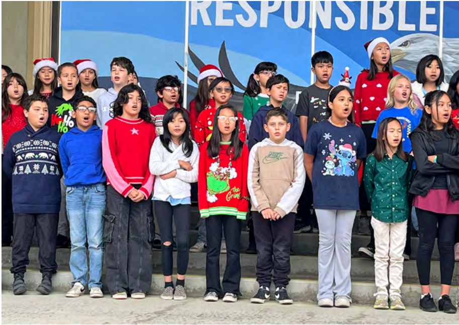
Fourth grades students focused on singing their best.

The concert was a joyful reminder of the power of music to bring people together and celebrate cultural diversity. Cox Elementary is proud to showcase the talents of its “fantastic eagles” and foster a strong sense of community during this festive season.