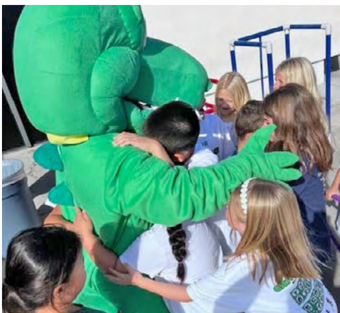
Snappy, the mascot getting some end of the run hugs