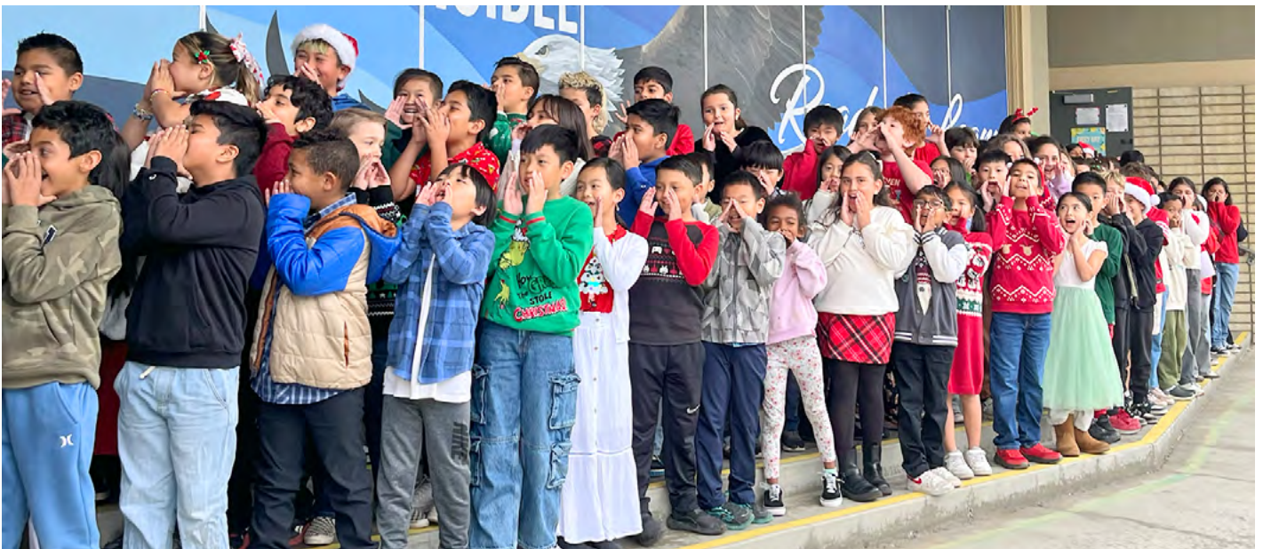
Third grade students showing off their singing skills .