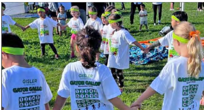
Gator energy was strong and connected!