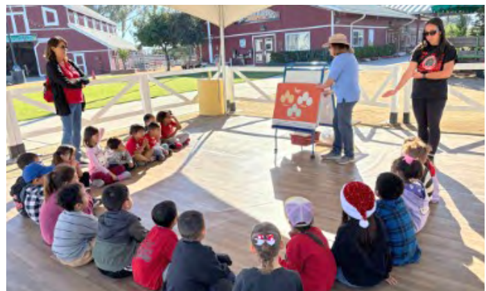
Plavan kindergarten students enjoy hands-on learning as they learn about baby chicks at Centennial Farm.

TK students welcomed animals to campus and learned about a tortoise, chinchilla, snake, toad, and millipede. Using their eyes, ears, and hands, students listened to animal sounds, explored textures, and identified different animal features. Kindergarten students traveled by bus to a local farm, where they learned about pigs, cows, ox, peacocks, and even held baby chicks. During the visit, students practiced being scientists by asking questions, making observations, and comparing animals.