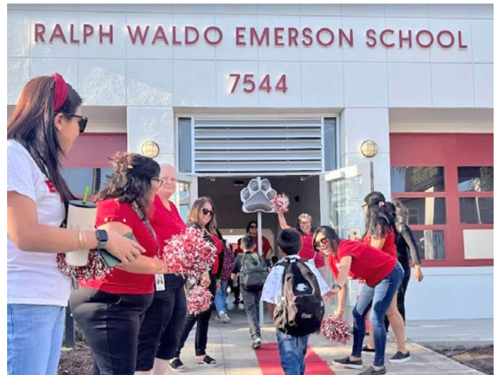
CBEDS DAY 2025