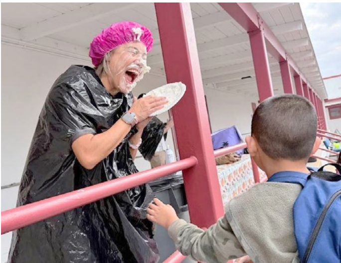
First Day of School 2025