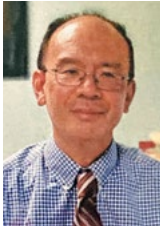
Hing Chow Principal

901 E. Graves Ave., Monterey Park, CA 91755 • 626/307-3300 • mvista.garvey.k12.ca.us