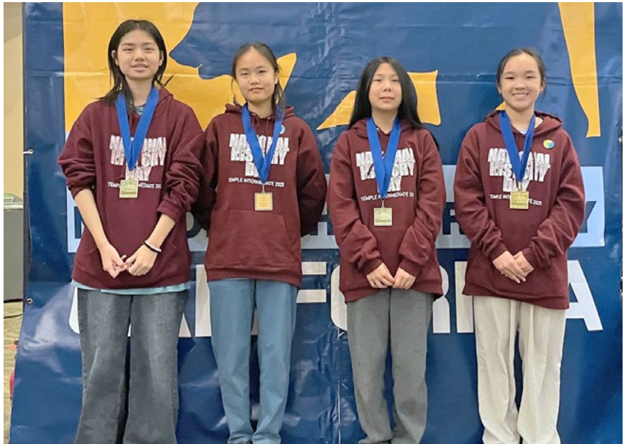
The California State Champion Temple Intermediate History Day Team

We are excited about the new opportunities ahead of us in the 2025-2026 school year. We will make the most of them by living out our motto, "Temple Knights R.I.D.E."