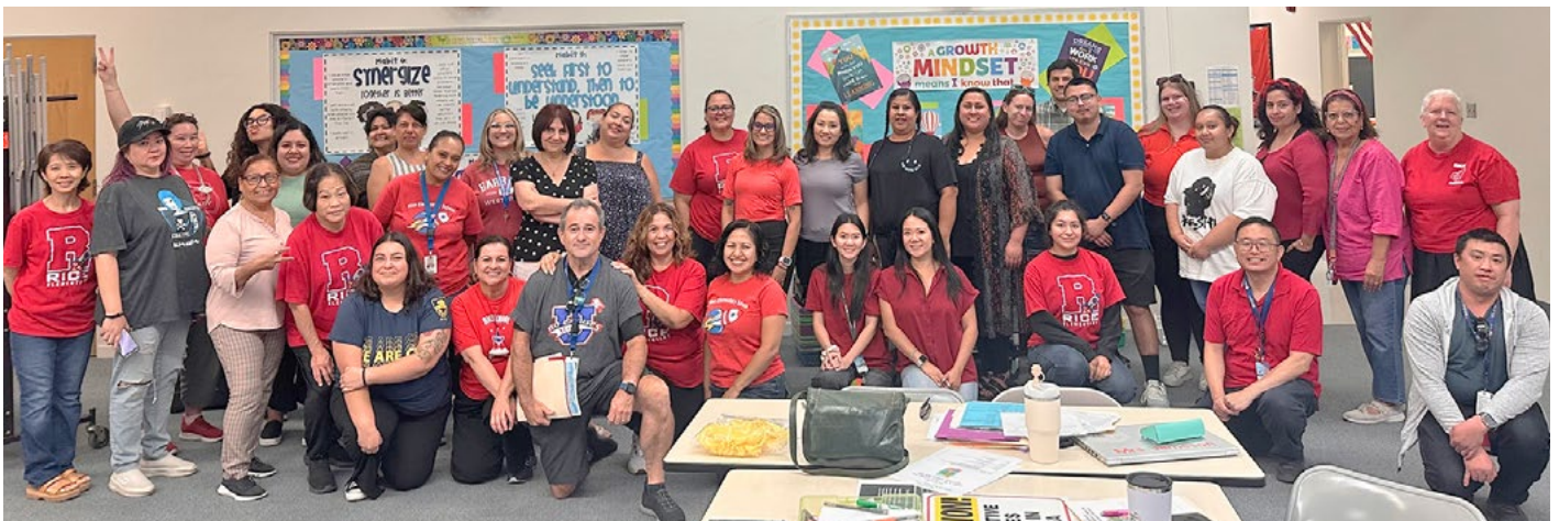
Rice Teachers and Staff, excited to make a difference in 25-26!