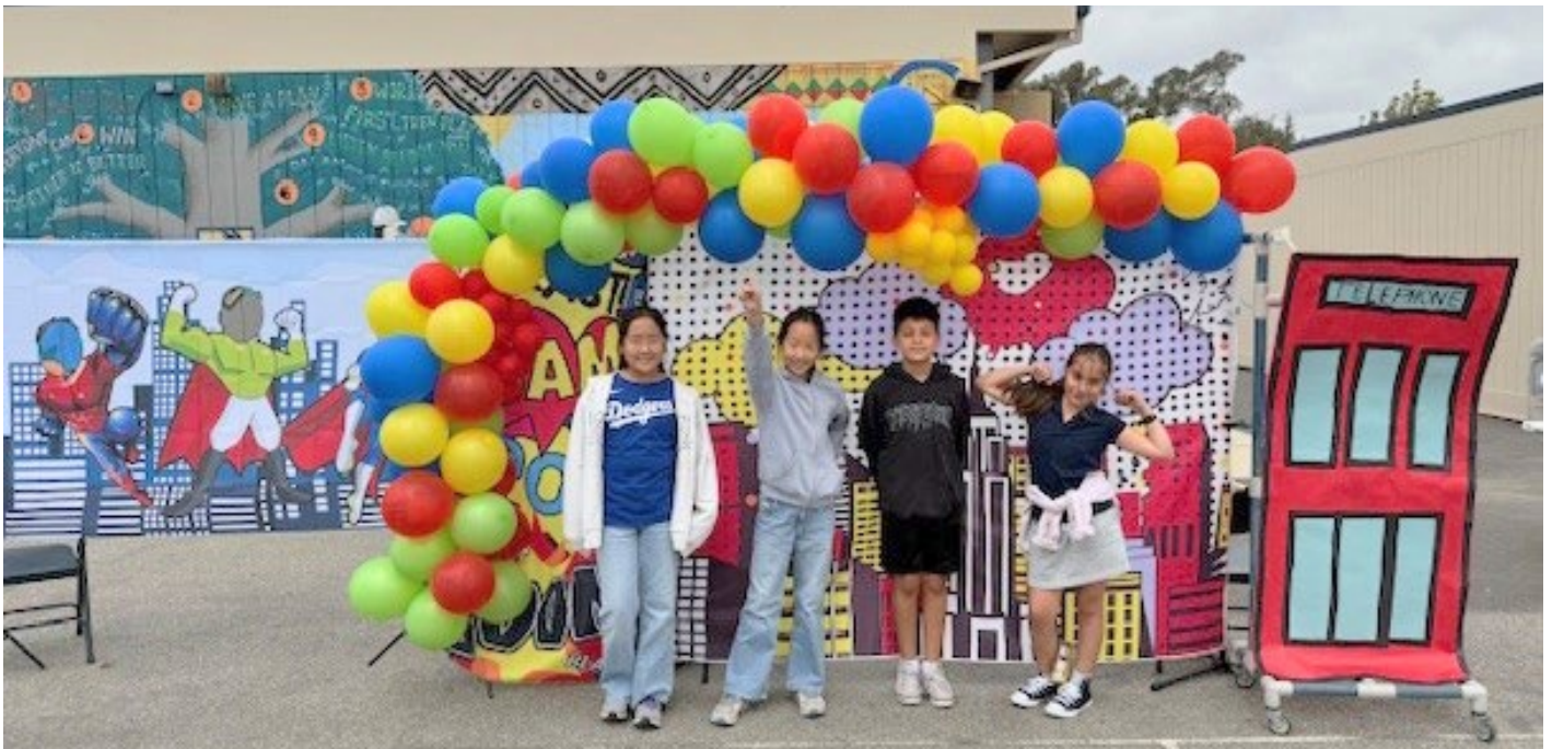
Student Leaders in Action

Hillcrest Elementary has a college and career going culture too! Not only are we a strong Leader in Me School, but we are also AVID Certified in grades 3 - 6. We have been recognized by the California Coalition for our award winning Positive Behavior Intervention and Supports program and last year we had the honor of being selected as a School Tour Site for the Leader in Me West Coast Symposium. Hillcrest is where personal growth matters and the spirit of leadership thrives! We are committed to developing greatness in each student.