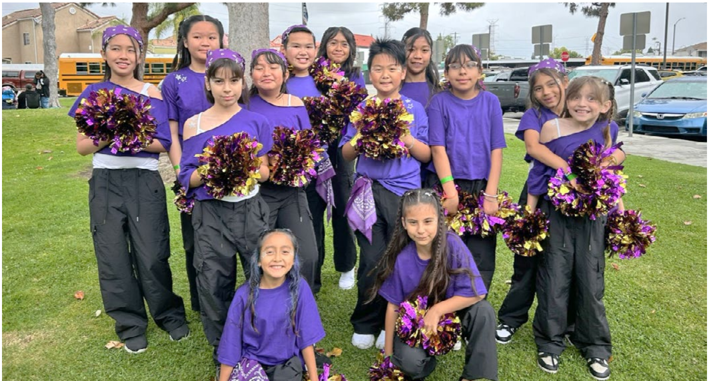
The Award-Winning Sanchez Eagles Cheer Team