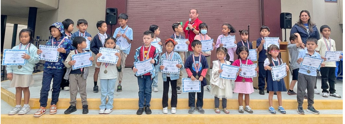
B.E.A.R Awards celebrating student achievement in Academics, Effort and Kindness.

With these joyful events setting the tone for the year, Bitely School is focused on fostering a supportive, enthusiastic, and achievement-oriented environment for all students.