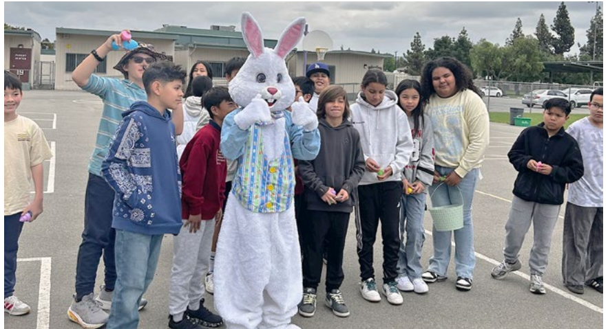
Sanchez students enjoy the enrichment activities that take place outside of the classroom.

We are off to a great start, and are looking forward to building from it and making the 2025-2026 school year one of our best. This is why we say, “Sanchez Eagles S.O.A.R.”