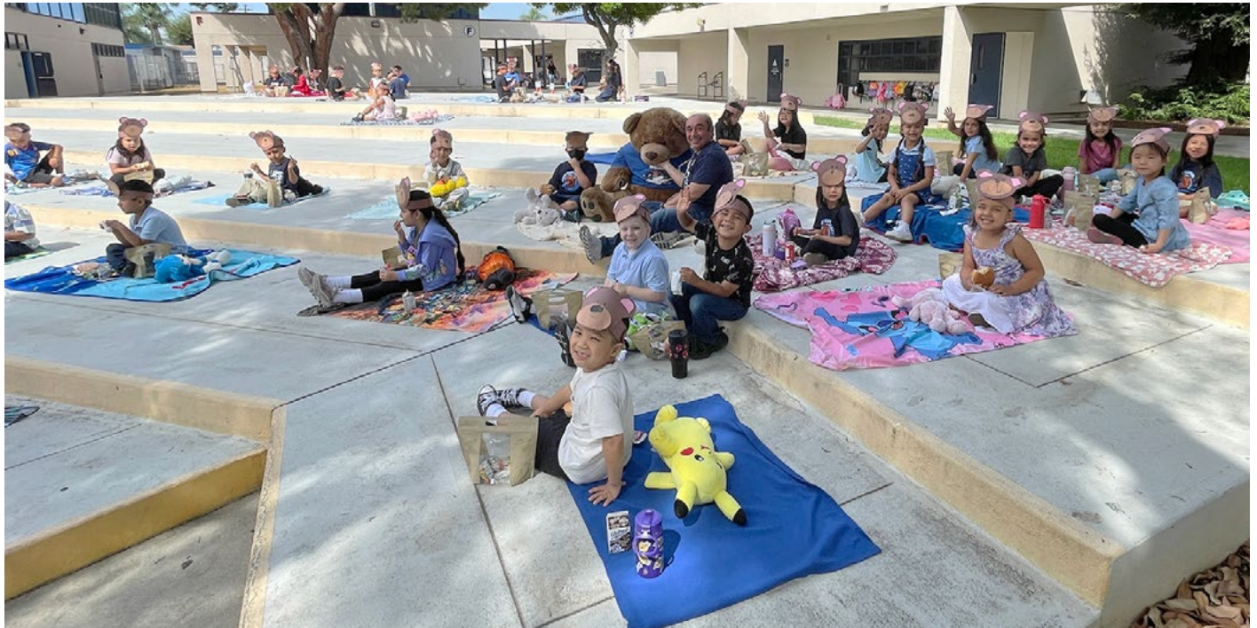
Kindergarten Students enjoying their annual BEAR Picnic.