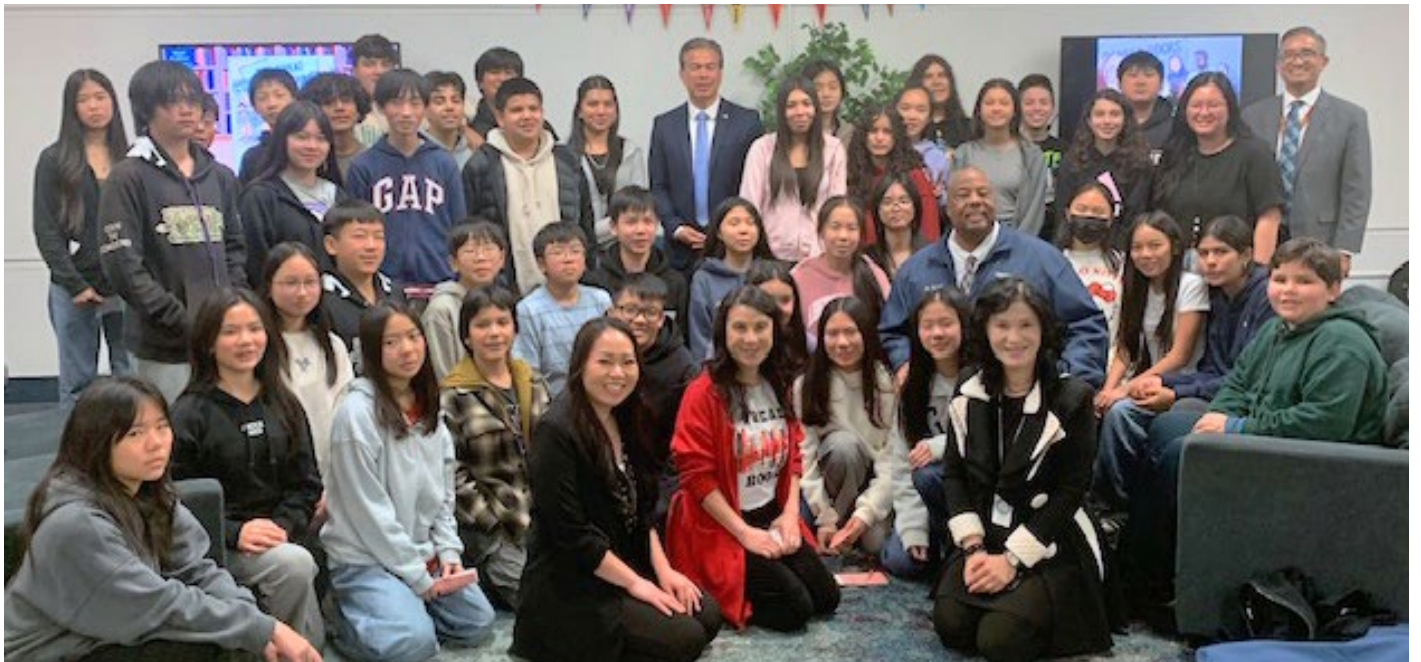
Temple AVID students California Attorney General, Rob Bonta