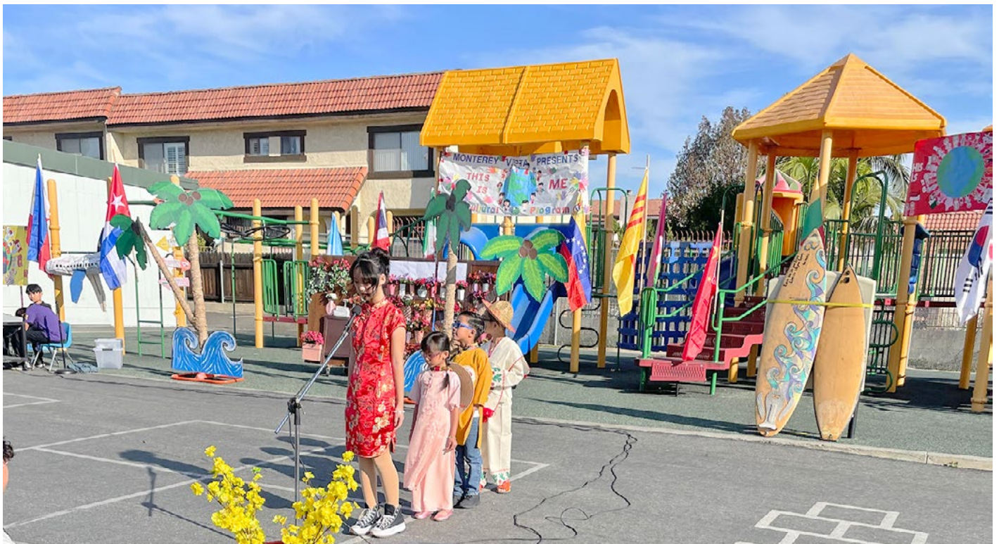
Monterey Vista welcomes everyone back for 25-26 school year