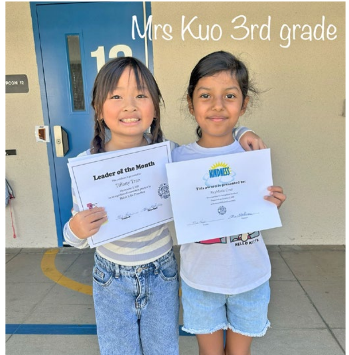
Leader In Me Assembly

Thank you to our incredible Willard community of parents and staff—your continued support helps make Willard a place where students grow with confidence, lead with purpose, and thrive academically. We look forward to sharing more joyful moments with you throughout the year!