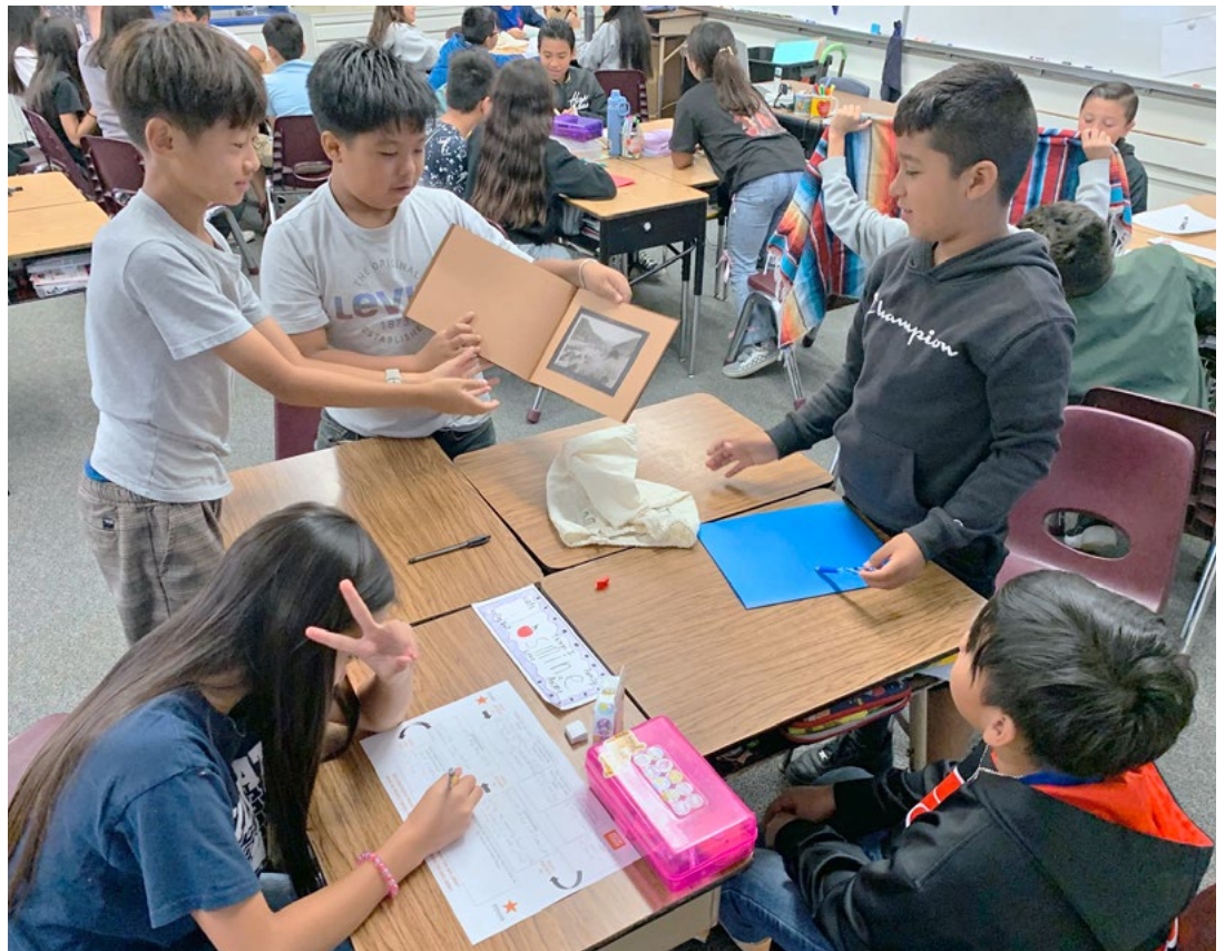
Gene Autry Historical Museum Lesson