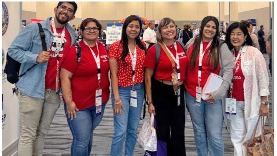
MTSS Conference Attendees

Together, we’re building a stronger, brighter future—brick by brick.