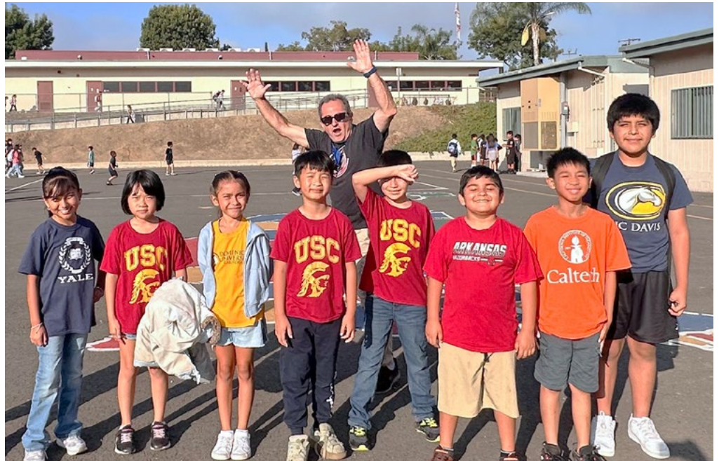
Rice Rockets are Wild About College!

We are thrilled to announce our recent award of a Community Schools Partnership Grant, reflecting our dedication and collaboration with stakeholders to enhance our school and respond to the needs of our community. Our hardworking team is excited to make this an unforgettable year for everyone at Rice Elementary!