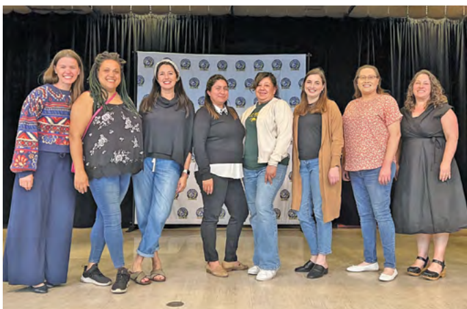
Founders Day Awardees 2025