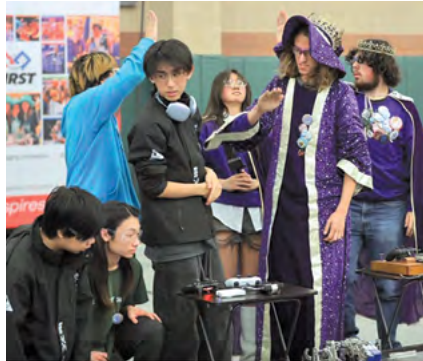
Team Kings and Queens strategizing during the championship competition.