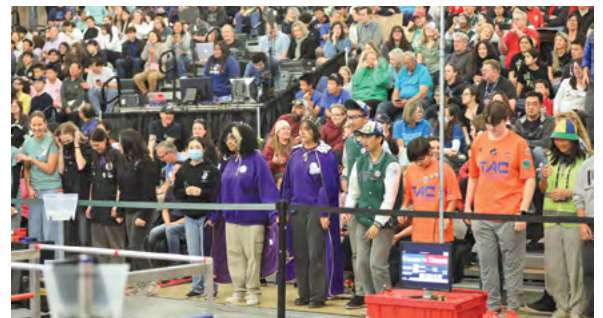
Team Dead Space and Kings and Queens during the SoCal Regional Championship finals.