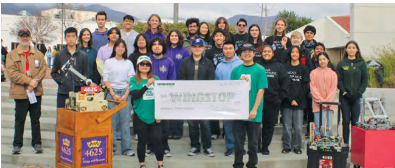
Members from every MHS robotics team with their robots receiving a donation.