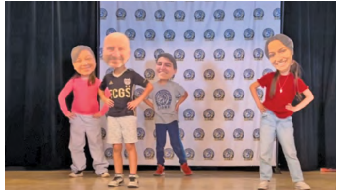
Talent Show 2025