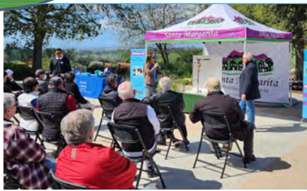
Home Leak Expo Saturday, March 22 10:00 AM – 12:00 PM

Protect your home from costly water leaks! Discover how smart leak detection devices can help you stay ahead of potential issues.