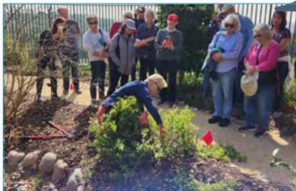
Love Your Garden Workshop Saturday, February 22 9:30 – 11:30 AM

Get your garden ready for spring with expert tips on pruning, pest control, and drip irrigation. Bring your succulent plant cuttings to share with fellow gardeners.