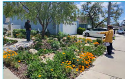
Home Garden Tour & Design Expo Saturday, April 19 9:00 AM – 12:30 PM

Explore stunning Mediterranean-inspired, drought-tolerant gardens on a self-guided tour.