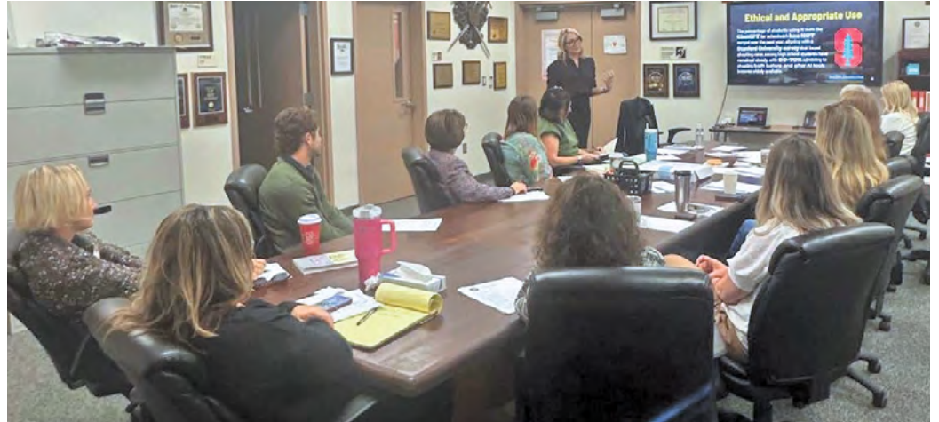
Presentation on Artificial Intelligence (AI) to a group of high school parents, students, teachers and administrators discussing ethical and appropriate use of AI in education.

SVUSD collaborates with AI consortiums like OCDE and has also formed the Tech Forward Task Force (TF2), a team dedicated to responsible AI integration. These efforts position SVUSD at the forefront of AI education.