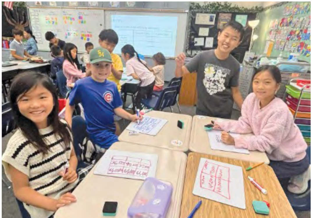
Valentine 4th Grade Students working together on a game-based review of math concepts.

我為我們共同取得的成就深感自豪，並期待著 Valentine 小學在新一年再攀另一高峰。