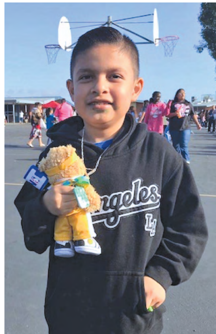
A prize to remember the day.

The Spring PTA Carnival at Lord Baden-Powell School proved to be a resounding success, bringing together families, teachers, and community partners for an afternoon of celebration. Smiles abounded as the sun set on the festivities, showcasing the true spirit of community and togetherness that thrives within the walls of Lord Baden-Powell School.