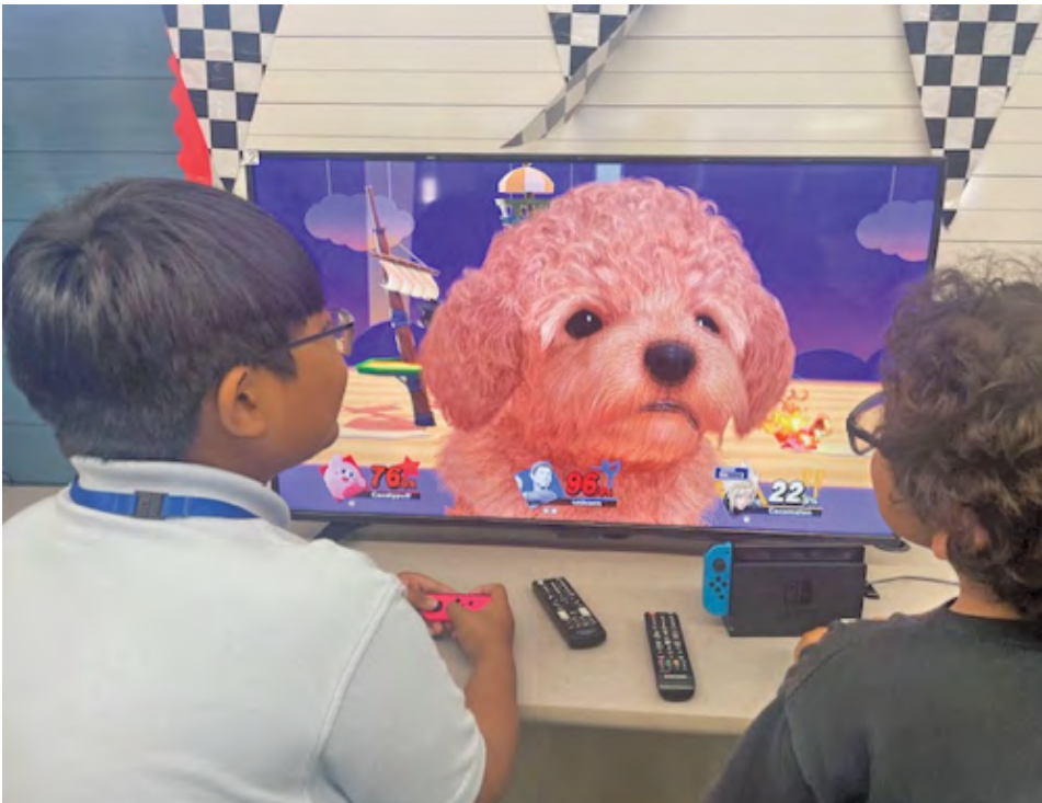
Students from 4th grade practicing Super Smash Bros.

Joining esports at Pyles leads to the ability to continue this path at Dale Jr. High and Magnolia High School. Esports and STEM also go hand-in-hand. Students drawn to gaming are often equally captivated by the broader technology sphere. So whether it be at after-school or weekend competitions, Pyles STEM Academy is proud of its esports teams!