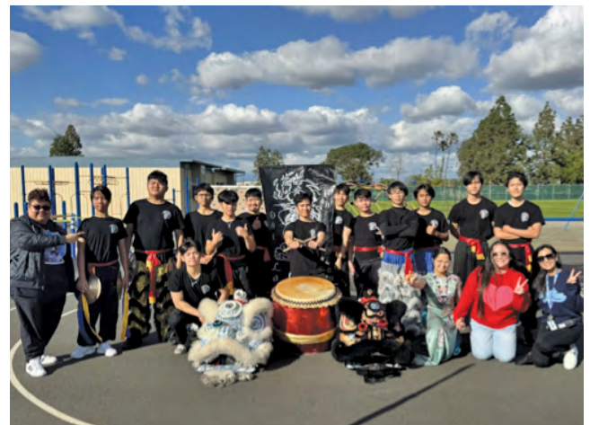
Magnolia High School's Lion Dance Team, part of their Vietnamese Student Association, brought the energy and tradition of Lion Dancing to our school, spreading joy and cultural richness across our campus in celebration of the Lunar New Year