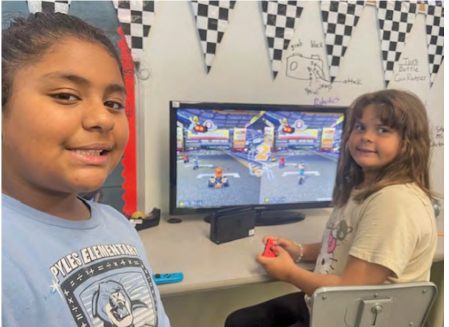
Two students enjoying a game of Mario Kart.

Being a member of an esports team also fosters feelings of acceptance and inclusion regardless of physical abilities, gender, or age. Students working together towards a common goal can improve their interpersonal skills and social interactions. Cognitive