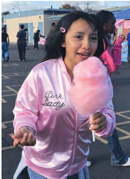
Always a roadrunner favorite -- cotton candy!

Perhaps the highlight of the carnival was the special Principal Booth, where students eagerly lined up for a chance to silly string their beloved principal. With gleeful faces and cans of silly string in hand, the students reveled in the opportunity to playfully douse their principal in colorful chaos.