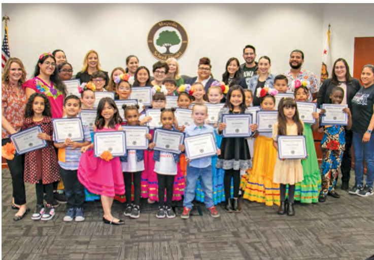
Peter Marshall School students and staff proudly display certificates of recognition for their outstanding cultural presentation at the Board Meeting