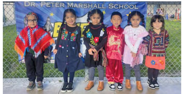
Preschoolers embrace Read Across the World Day by dressing in traditional garb reflecting their rich cultural heritage

feels welcomed, valued, and empowered to embrace the richness of diversity.