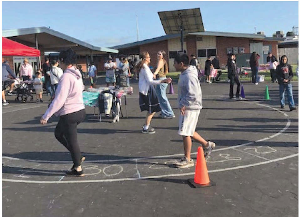
The Cake Walk with sweet rewards for everyone!

The City of Anaheim, a valued community partner, also joined in the festivities, offering an interactive exhibit and informing parents about engaging student and family activities showcasing the city's vibrant spirit.