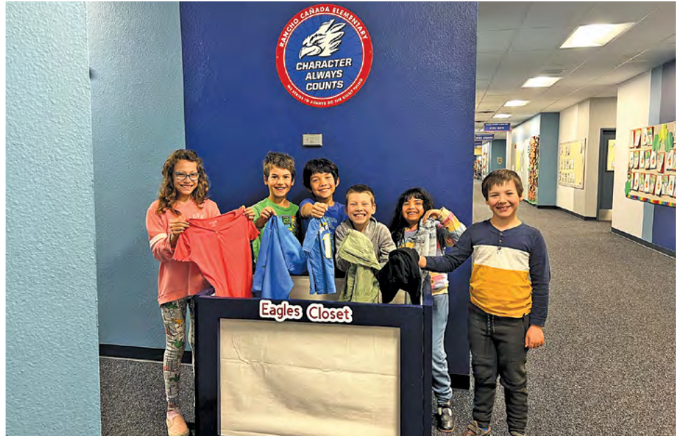
Students enjoy dropping off clothing items to our new Eagles' Closet cart.

is available so we can send items home. Thank you to the program lead, Leah White, and all the volunteers who pitch in to make this happen.