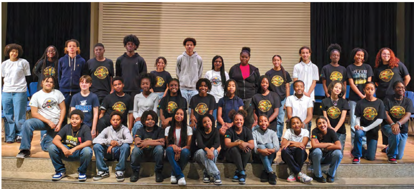
Hughes Middle School Young, Gifted, and Talented Black History Performing Arts Club (page 28)