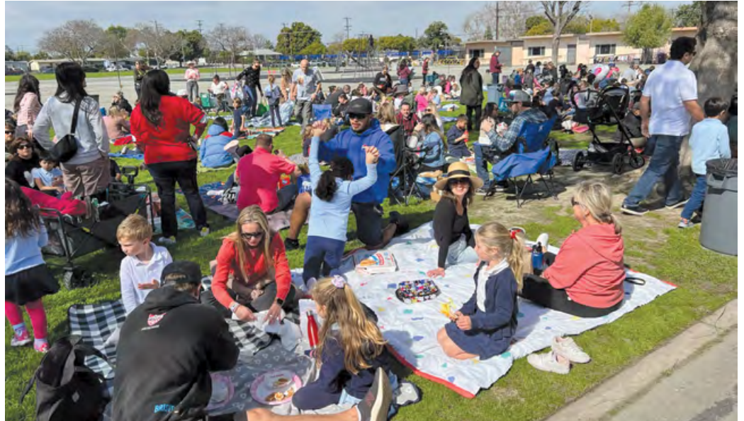
Tincher Families celebrating "Lunch With a Loved One"

Picnic lunches, blankets, and lawn chairs covered the field as families joined together for a meal. The quote of the day summed it up perfectly: "What a special treat it was to eat lunch with both my mom and dad at the same time!"