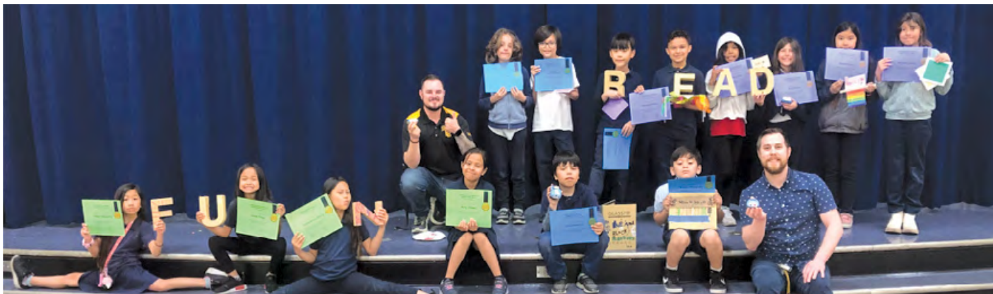
Go Bryant Bears, Go Robotics Teams!

These teams had a blast with the competition and we are very proud of them.