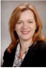
Lori Y. Woods Mayor