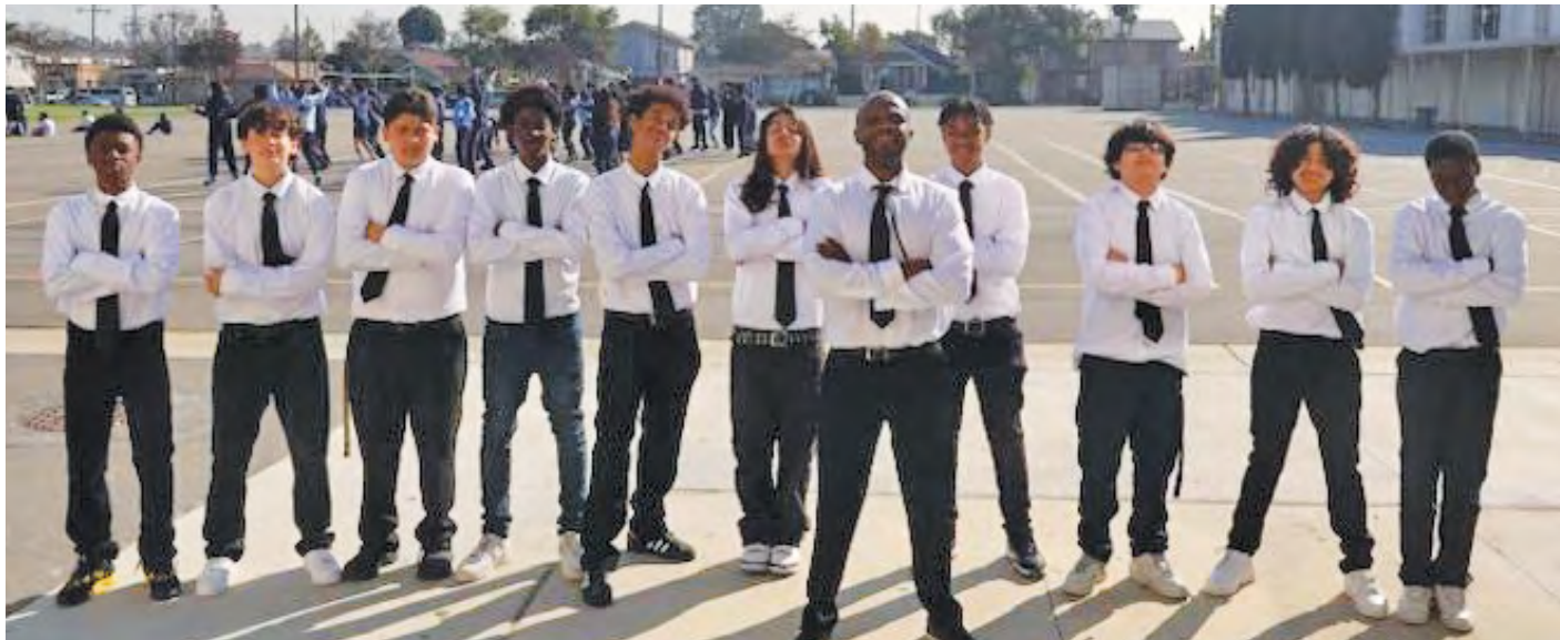
Jefferson Male Leadership Academy Students (page 29)