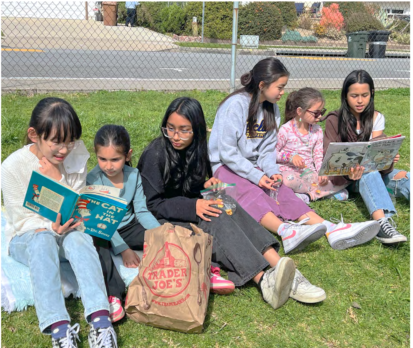
Big and little buddies dive into the magic of storytelling during buddy reading for our Read Across America Week celebration!

Sunset Lane Elementary's Read Across America Week epitomized its dedication to nurturing a lifelong love for reading, fostering creativity, and building a strong sense of community through the power of literature.