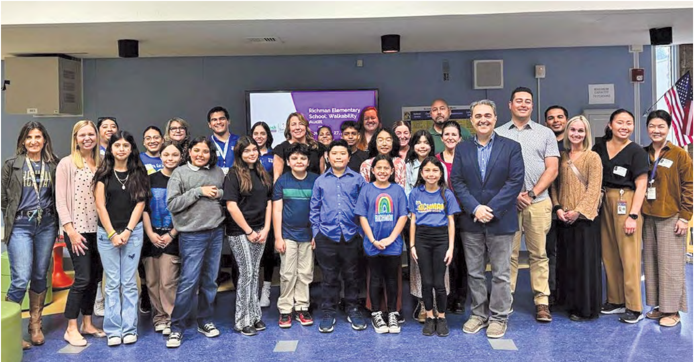
Richman Student Council leaders, present their findings during the walkability audit.

The leadership displayed by our Student Council and their genuine desire to effect positive change in our community serve as a testament to the power of collaboration and the profound impact of student-driven initiatives.