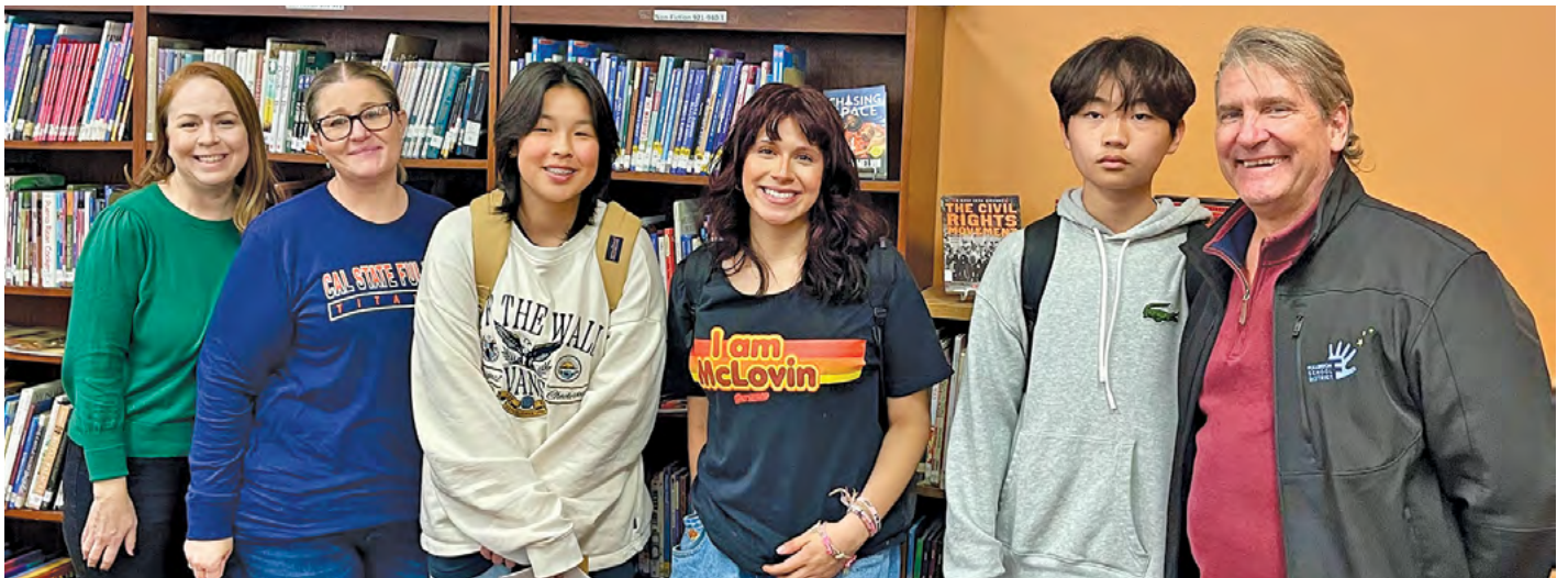
Parks Jr. HS