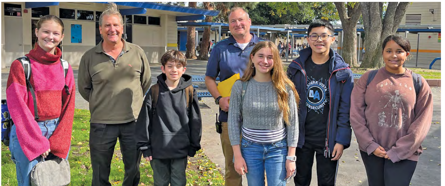
Ladera Vista Jr. HS of the Arts