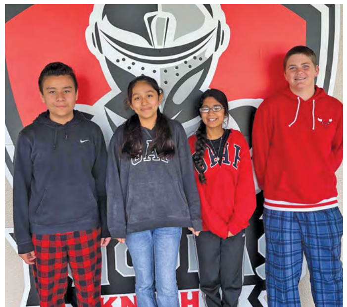
Nicolas Jr. HS