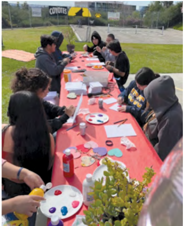
BCHS Coyotes build community through art