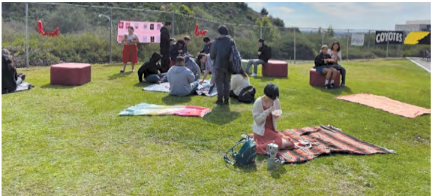
BCHS and Project Kinship Picnic