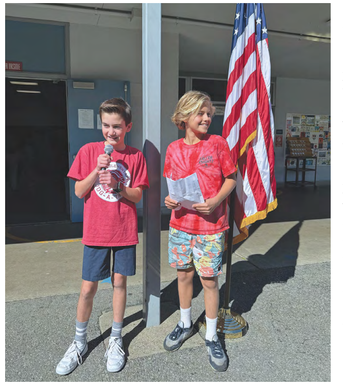
Student Council president and vice president leading Flag Deck.

Composed of representatives from various grade levels, the council advocates for student interests and spearheads initiatives aimed at enhancing the school experience for all. Through open communication and regular meetings, council members actively solicit feedback, suggestions, and concerns from their peers, ensuring that student perspectives are heard and valued.