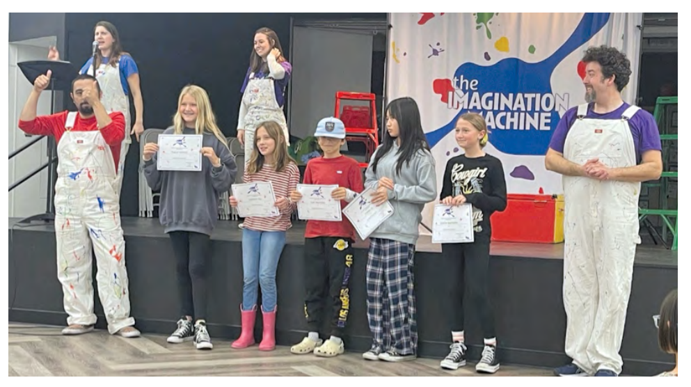
Imagination Machine performers celebrating some of Eastbluff's "otterly" awesome authors!

With great thanks to the Eastbluff PTA, our Otters are already thinking about the stories they want to submit next year!