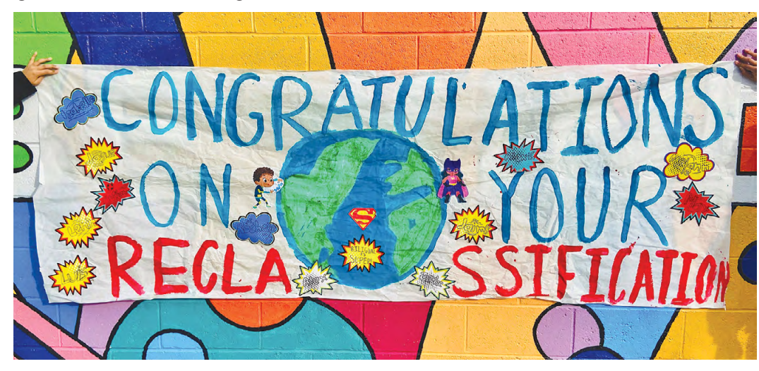
Reclassification poster highlighting individual achievements created by Killybrooke's Student Government.

bilingualism. To add to the celebration, students were treated to a pizza and brownie lunch. These 13 students serve as an inspiration for others embarking on the journey to becoming Fluent English Proficient. The school remains committed to nurturing a learning environment where every student can thrive and excel, fostering a community that celebrates success in all its forms.