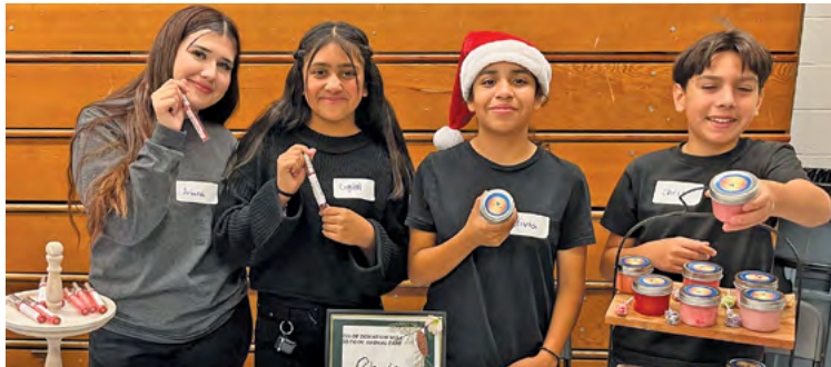
Students showcasing their products at the Cosmetic Convention. Estudiantes presentando sus productos en la Convención de Cosméticos.

¡Brindemos por un año de victorias y abracemos posibilidades infinitas! ¡Vamos, Caballeros de IMS!