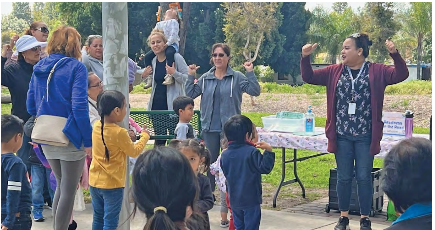
Music and Movement Música y Movimiento

¡El Aprendizaje Temprano está agradecido por la colaboración con agencias comunitarias para asegurar que nuestros niños estén listos para el kinder y más allá!