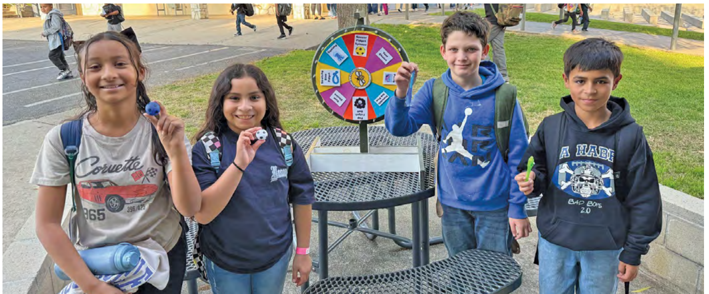
Students are excited about spinning the iReady incentive wheel! ¡Los estudiantes están emocionados por girar la ruleta de incentivos de iReady!