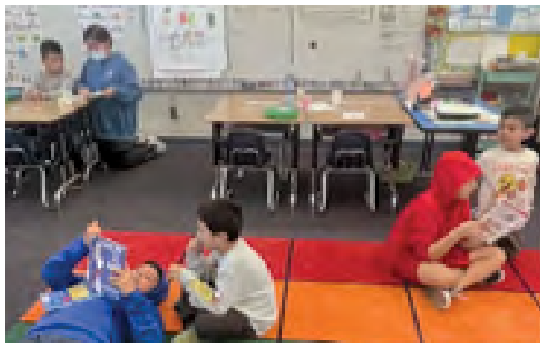
4th & 1st Grade Book Buddies