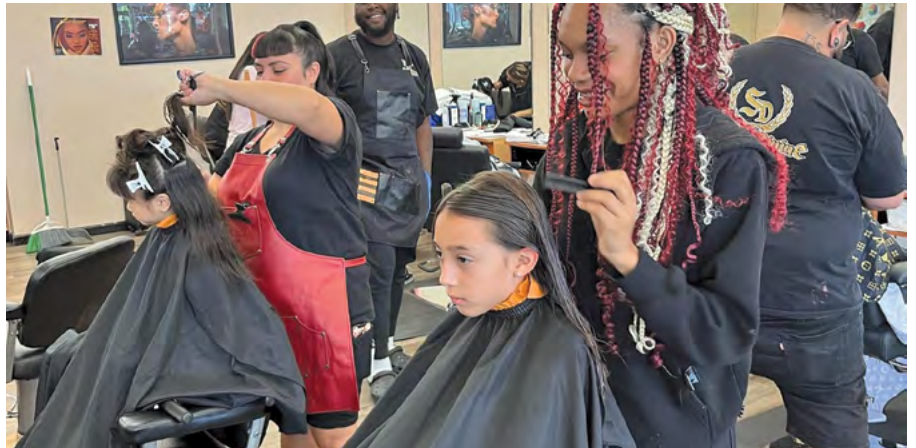
MIT student styles a student's hair in preparation for her first day of Cosmetology and Barbering School.

Duarte's CTE goal is to partner with business and industry to develop engaging and meaningful workforce development experiences to guide students to becoming career ready and certified. There are currently fourteen (14) MIT students enrolled in the Cosmetology and Barbering School, Monday through Thursday from 5 pm – 9 pm and on Saturdays from 9 am – 4 pm. Students have to complete 1,000 hours of hands on training, technical instruction and practical operations. In addition, students learn about human physiology, anatomy; shaving, trimming