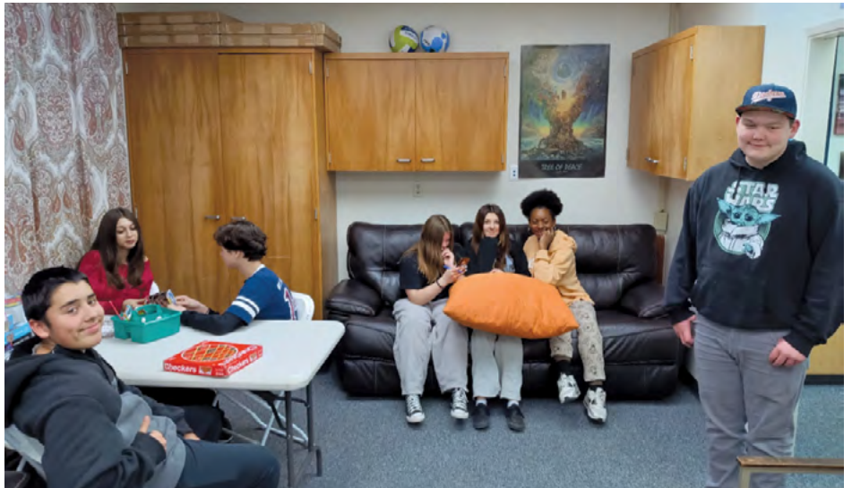
JMS Students Enjoy Relaxing and Playing Games in, "The Big Chill"

are fortunate that TUSD students and families have access to school site mental health support providers. Each school site has a social worker and intervention specialist who work with students to promote social and emotional competency and build resilience. TUSD social workers provide classroom lessons that reinforce positive behaviors and decision-making. Additionally, they work with students who would benefit from greater support in small groups or individually. Furthermore, social workers also provide mental health