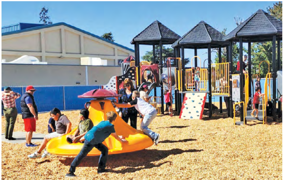
Students Enjoy A New Playground Structure.

to be able to offer TUSD students an environment where they can participate in unstructured play that encourages healthy exercise.