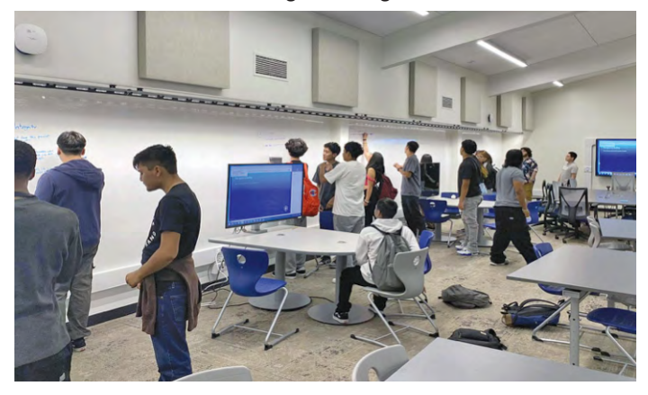
The iLab is a beautiful space for project based learning

The program's signature AIME field trips and guests, including visits to the OC Sustainability Fair, Hyundai Design Center, Roland, Delta Airlines, eKadence, and Deloitte, provide students with valuable exposure to various industries. These experiences bridge the gap between classroom learning and the professional world.