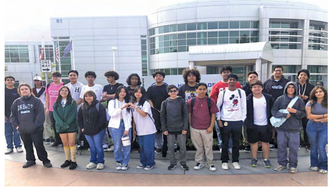
Students attending and AIME fieldtrip at Hyundai

In conclusion, the Western Exclusive Pathway at Western High School offers a holistic and forward-thinking educational model. It