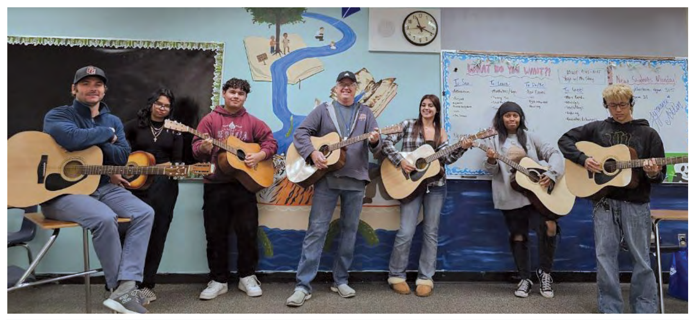
CTE 501 N. Crescent Way, Anaheim, CA 92801 • 714/999-3511 • www.auhsd.us

varying skill levels and fosters the 5C's with an emphasis on creativity, communication, and collaboration. Weekly meetings feature practice sessions, skill-sharing and the joy of jam sessions exploring original pieces. AUHSD Independent Studies thrives on providing a personalized and flexible educational experience that includes opportunities for arts education and enrichment opportunities.