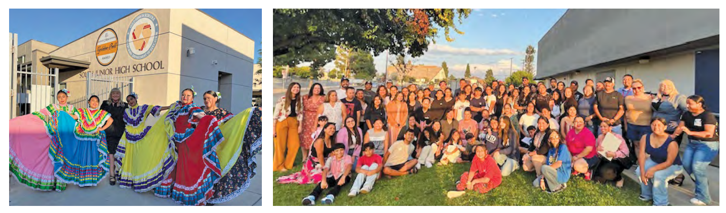
AUHSD scholars earned over 1,300 Pathway to Biliteracy Awards and over 1,000 Seal of Biliteracy Awards in 2023.

of Excellence Award winning programs. AUHSD accepts intra and inter district transfers.