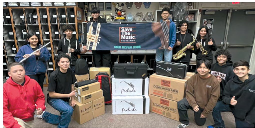
Sycamore JHS band students unboxing new instruments courtesy of a grant from the Save The Music Foundation.

every student with an opportunity to learn in the arts. Implementation strategies include hiring more arts teachers, part-time coaches, and teaching artists, as well as acquiring new instruments and supplies. Additional support involves professional learning for teachers and collaborations with arts organizations like Chance Theater, Laguna Playhouse, and Backhaus