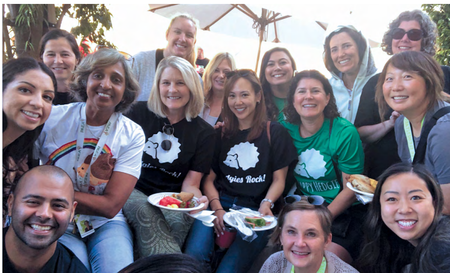
Hoover and Greendell Staff

With a shared vision for excellence and a steadfast commitment to fostering a sense of community, Hoover and Greendell have united. The merged schools embody the belief that together, they can achieve even greater heights of success, innovation, and community impact. As this new chapter unfolds, optimism radiates throughout the classrooms and playgrounds, inspiring students, educators, and the entire school community to embark on this journey of growth, collaboration, and shared success.