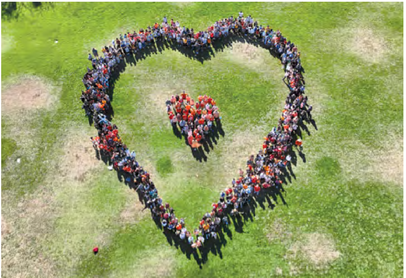
2023 Fletcher Unity Day

As Fletcher continues to prioritize community building, it stands as an example of how promoting agency and collaboration can help transform a school into a thriving, unified community. Through these initiatives, the school not only educates minds but also nurtures spirits, preparing students for success in both academics and life beyond the classroom. For more information on our amazing school, please visit the school website at fletcher.pausd.org