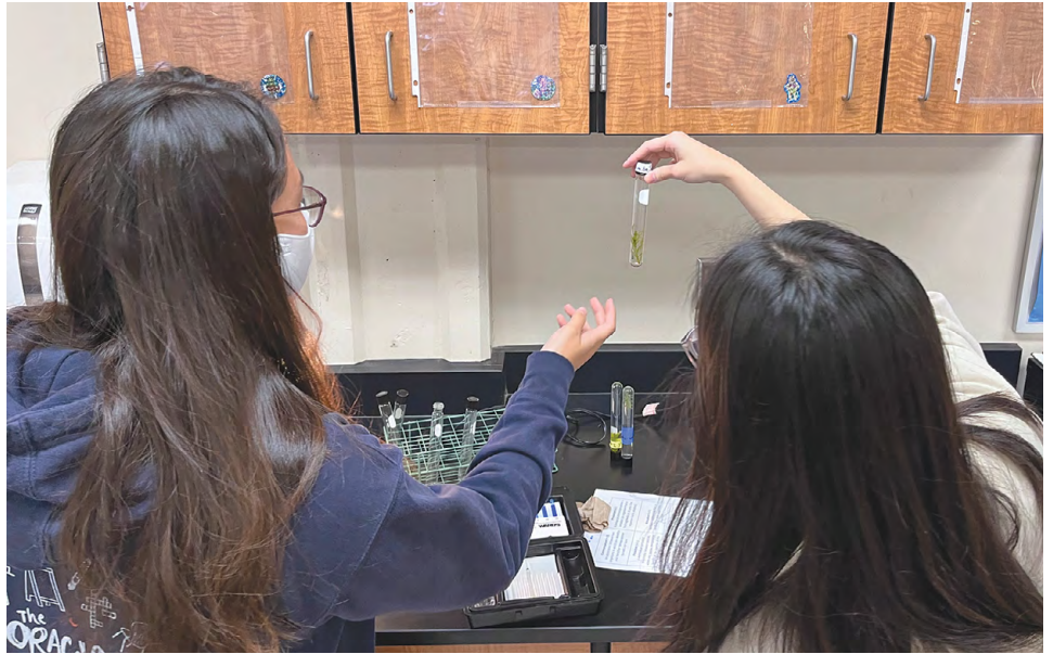
Gunn students Testing water quality to assess development.

"In our inaugural project, the AP Environmental Science class diligently worked on assessing and reducing the school's consumption, with a specific focus on electricity usage. This project provided students with hands-on opportunities to explore the intricacies of energy use, its environmental consequences, and the economic dimensions of energy choices. They audited our school's consumption patterns and proposed practical improvements such as LED lighting and potential solar panel adoption, deepening their understanding of energy-related challenges.