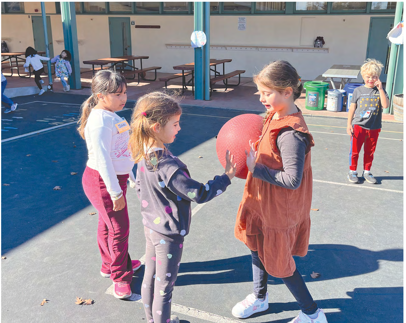
Students practice kindness by encouraging their friends when they get “out” during four-square.

Another PAUSD promise goal always on our minds is early literacy. Teachers at Duveneck fully embrace structured literacy and have been working tirelessly to utilize Heggerty, OG, and Benchmark collaboratively to cater to diverse student needs. Our EL Specialist and Librarian have initiated targeted literacy instruction with small groups, and we recently hired our TK teacher to provide early intervention to kindergarten students with support from the reading specialist. Teachers are strategically planning their small group instruction leveraging the vast decodable libraries recently purchased by Ed Services. The collective efforts of teachers and staff at Duveneck contribute to a nurturing and supportive learning environment.