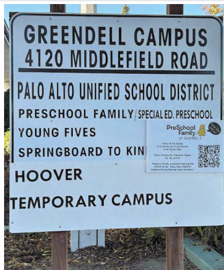
The sign to our new combined campus.

Initially, there were some concerns among the staff from Greendell, PreSchool Family, and Hoover Elementary about seamlessly merging the age groups of babies through fifth grade. However, as the school year began, both staffs realized that the combining of the two schools holds the promise of fostering an enriched educational community. Here, diverse perspectives and talents join forces to create a unified learning environment, perfectly aligning with the PAUSD mission of the 'Power of One.'