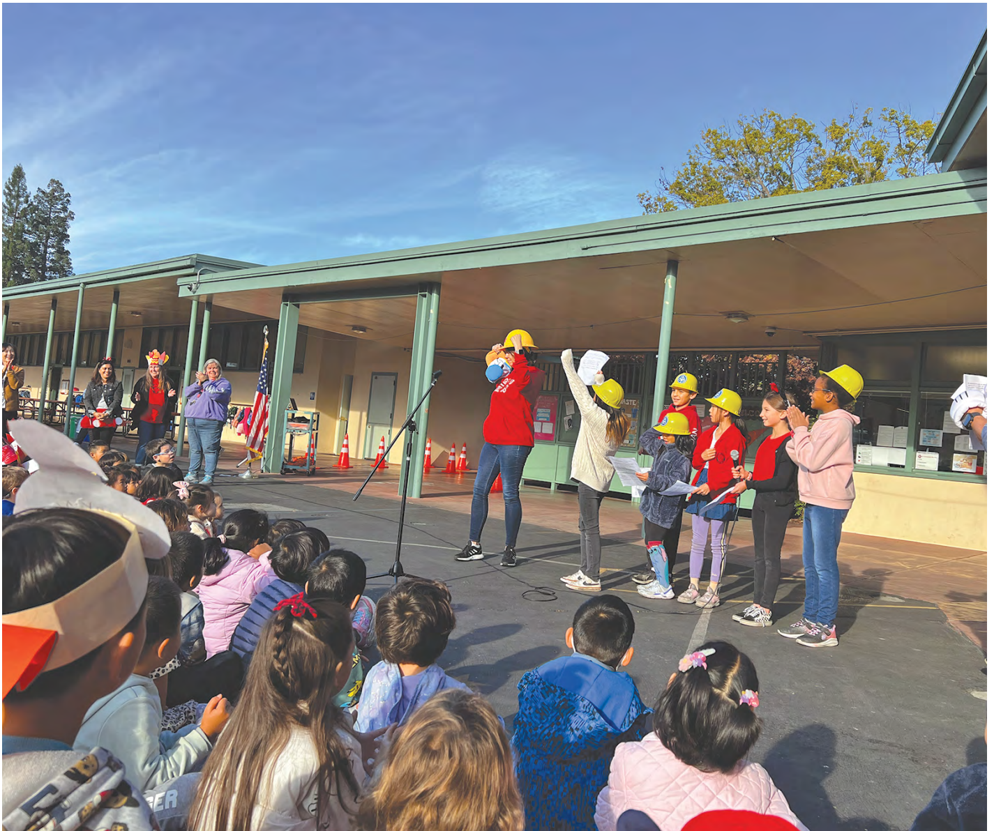
School of Builders