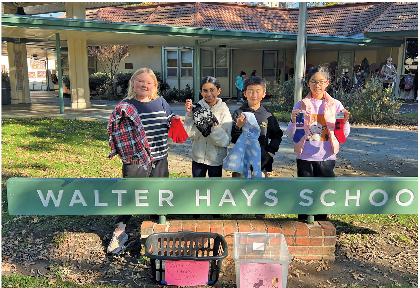
Walter Hays Student Council Providing Hope for Others Through a Winter Garment Drive!

Parents, thank you for partnering with us to cultivate this optimistic spirit in each of your children!