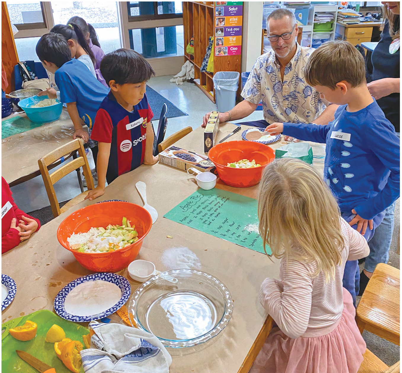
Kindergarten students prepare a feast for their families.

Finally, our admin team hired a coffee cart for staff before the Thanksgiving break, providing a warm and energizing start to their day. This small gesture was one way to express the profound appreciation we have for their incredible work. Nixon looks forward to serving and celebrating into 2024!