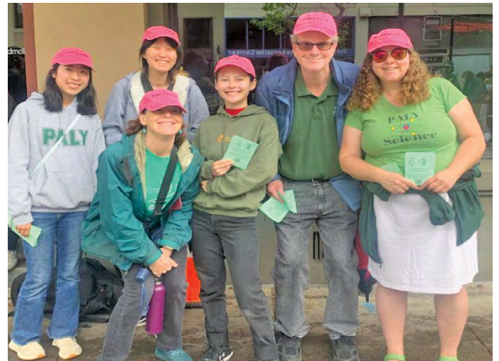
Paly Power Moves getting ready to join the Paly Band at the May Fete Parade.