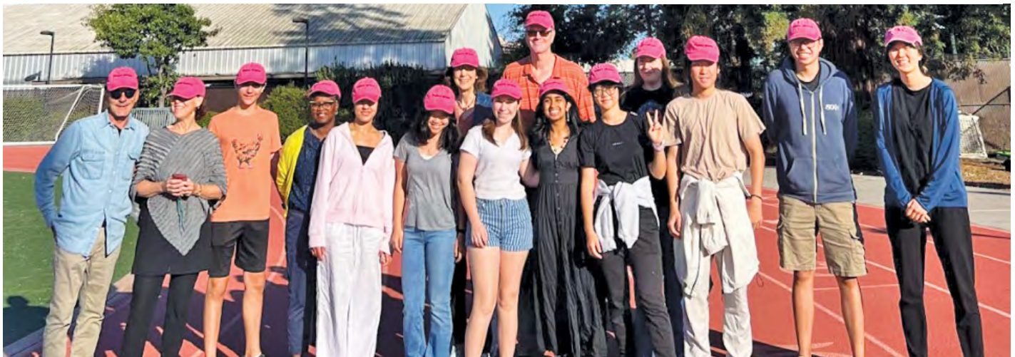
Paly staff and students pausing from their morning walk on the Paly track.