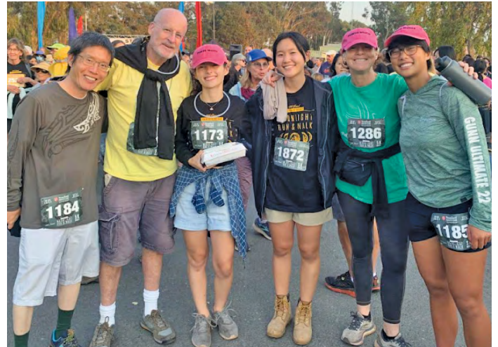
Paly Power Moves participants at the Moonlight Run/Walk at the Baylands.

Power Moves also reaches out to the community. The Palo Alto Weekly has given the group two scholarships to participate in the Moonlight Run/Walk at the Baylands and last year Power Moves followed the marching band for the local May Fete parade. With their pink hats and big smiles, the Power Movers of Paly are hard to miss. Remember, if you want to go far, go together. We'll be waiting for you... .8 a.m. every regularly scheduled Monday on the track. Let's Power Move together!