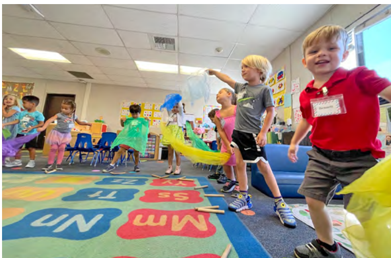
Music is fun with scarfs.

As you and your child listen to various pieces of music, talk to them about it. Discuss the distinctions between the sounds of each instrument, and then ask them about their preference for soft, low, or loud sounds. Early exposure to a wide variety of music will ensure your child's acceptance and appreciation of music for a lifetime, and we start this in preschool!