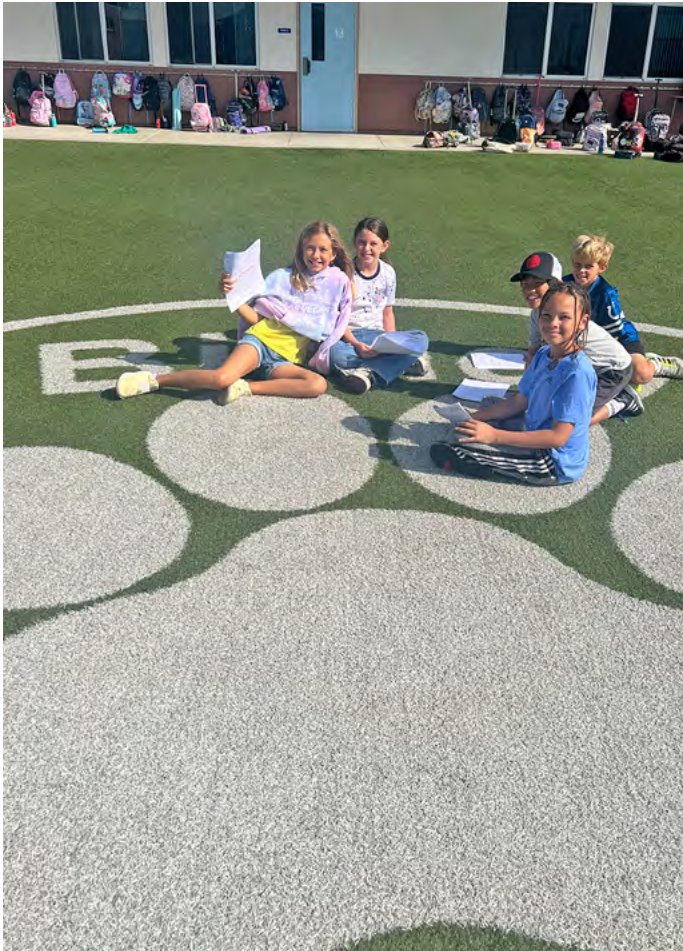
Readers Theater - Fourth grade students are hard at work reading their scripts for their Readers Theater Performance. Readers Theater is a fun way to engage students in repeated reading, which is an academic practice that increases oral reading fluency and comprehension.

This year we rolled out a new program called What I Need (WIN) Time. Three times a week, teachers in grades three to five pause their regular instruction for about 30 minutes so that their students can attend a WIN class. For five weeks the children get the opportunity to explore fun and enriching subjects that are designed to support their needs as learners, before they then rotate to a new WIN session.