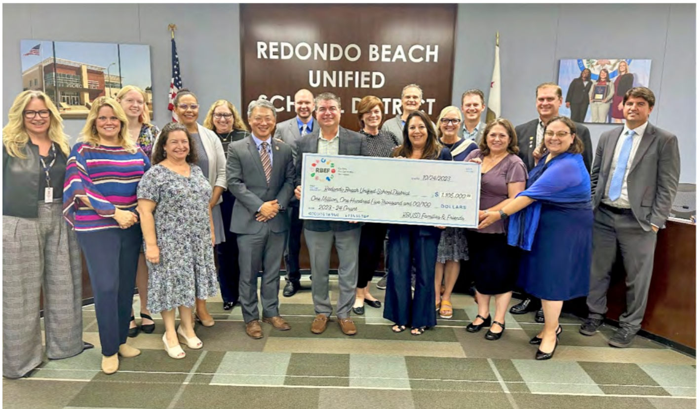
RBEF Board of Trustees presents $1,105,000 check to RBUSD for the 2023/24 School Year.

This 2023-24 School year, the Redondo Beach Educational Foundation is proud to grant a historic $1,105,000 to the Redondo Beach Unified School District to support the educational journeys of all our students. We thank you all for your generous support throughout the year because your investment in RBEF is really what helps ignite the spark that sets our students up for a lifetime.