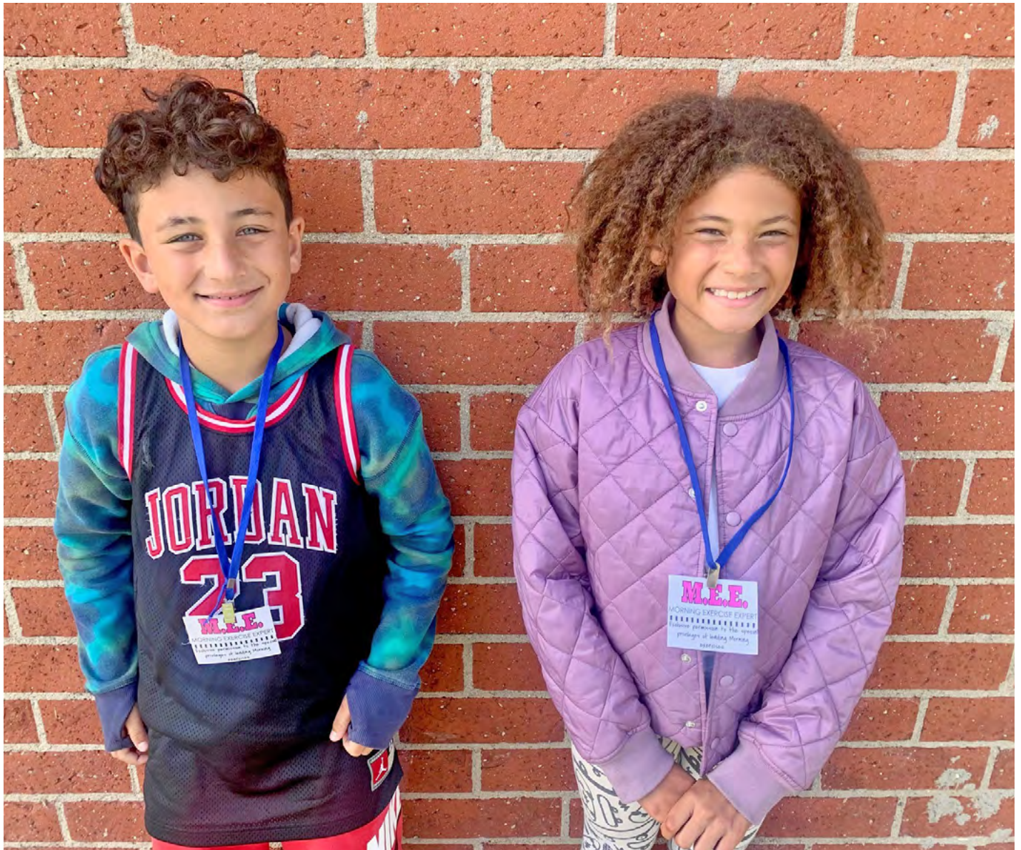
This week's 3rd grade Morning Exercise Experts (M.E.E.).

These leaders have helped re-shape the Tulita school community. For 8 minutes each morning, our school moves as one. Morning Exercises have brought our students together and our Morning Exercise Experts give us a perfect opportunity to highlight the positivity and hard work of our Tidalwaves. There's no better way to start our school day and get our students' mindsets ready for academic success!