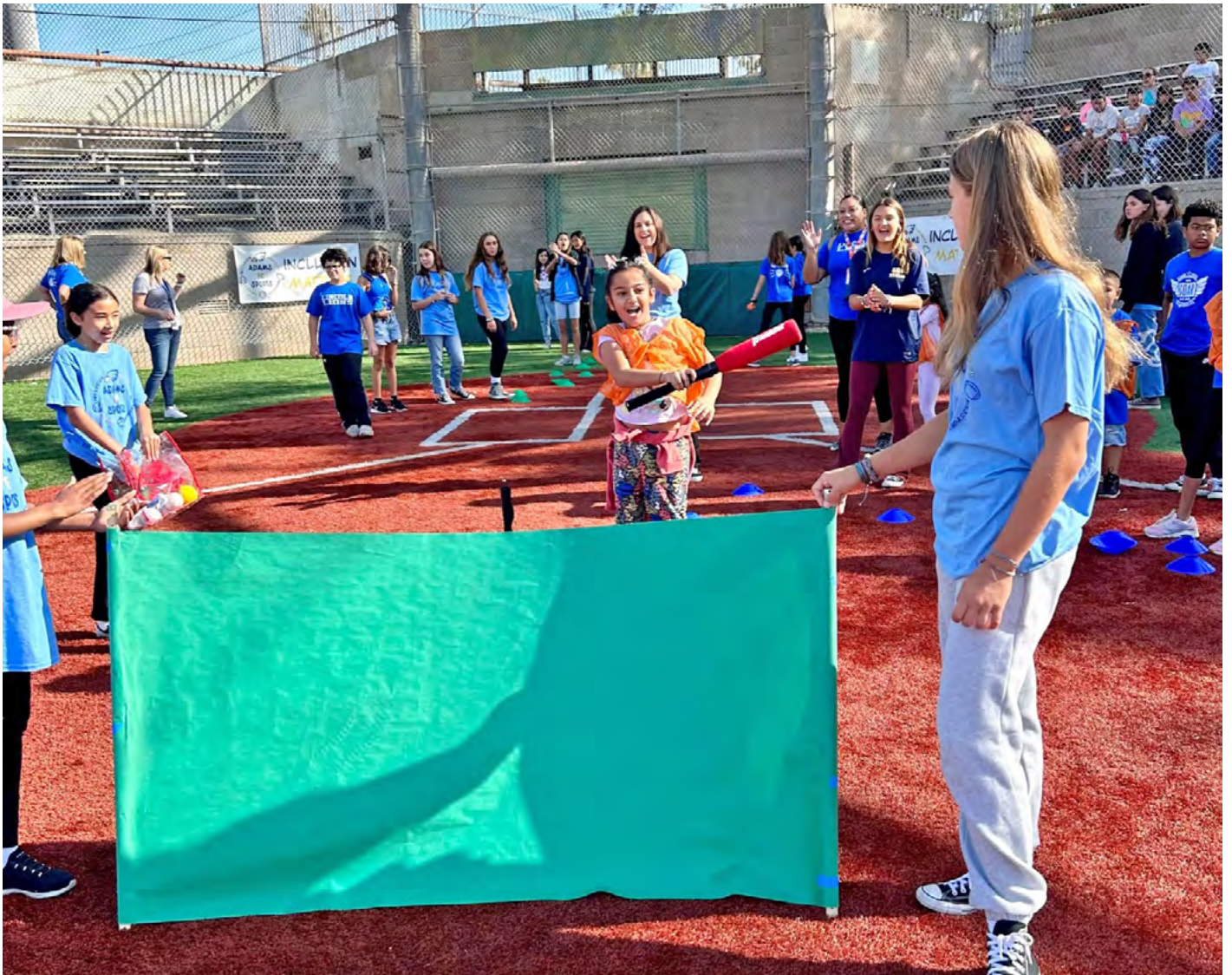
A Lincoln 2nd grade student athlete celebrates a home run!