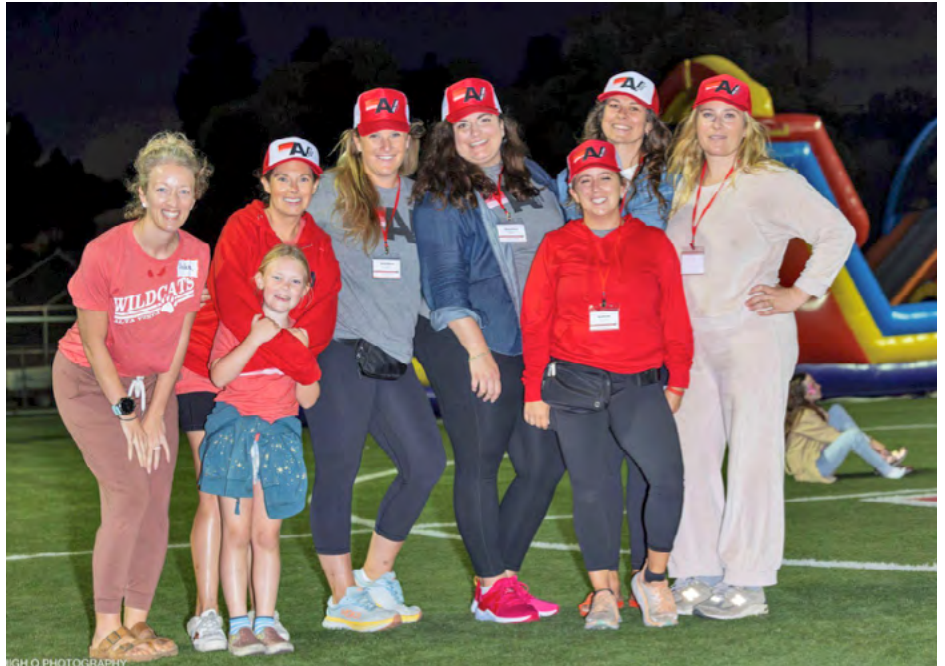
Some Alta Vista Nation members enjoying the evening.

Let's keep the spirit of togetherness and joy alive throughout the school year. I am looking forward to more memorable moments with all of you. Wishing you a beautiful season ahead.