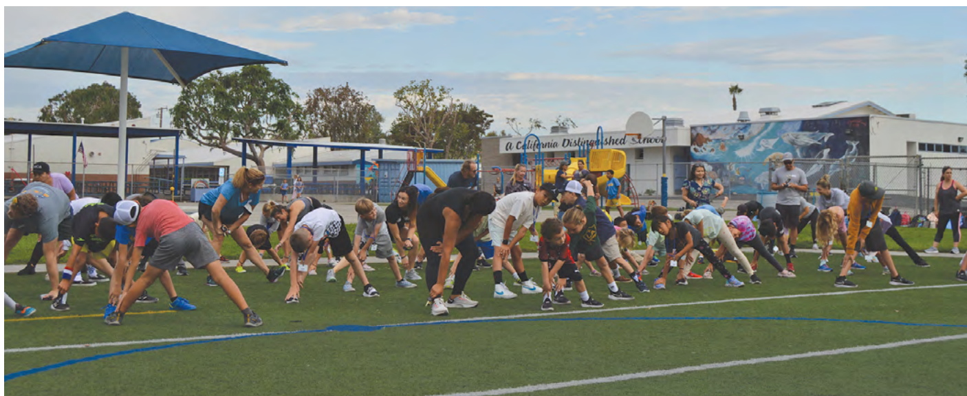
Our runners doing our Washington Stretch.