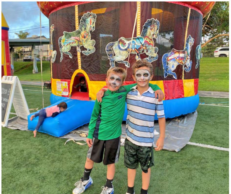
Alta Vista students hanging out at the carnival.