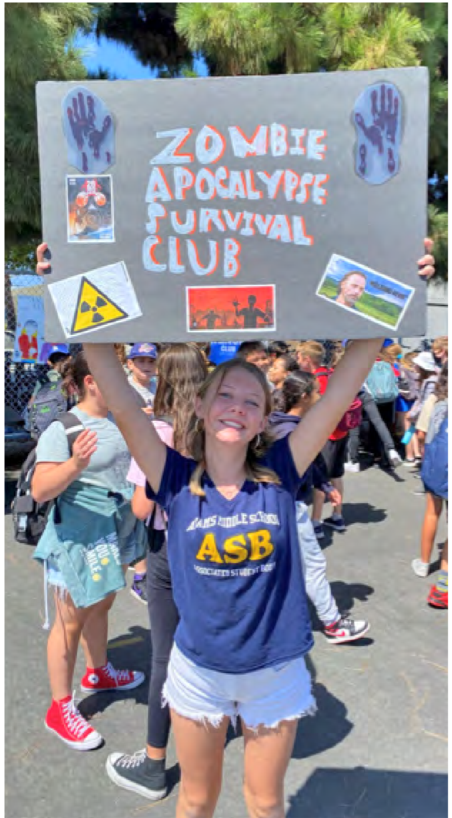
ASB promotes Club Rush during lunch.

We encourage visitors, parents, and others in the community to ask our students, “How are you connected at Adams?” Their answers will make you smile!