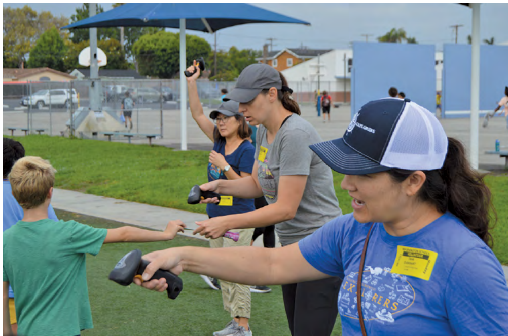
Our fabulous parents helping to track our students' laps.