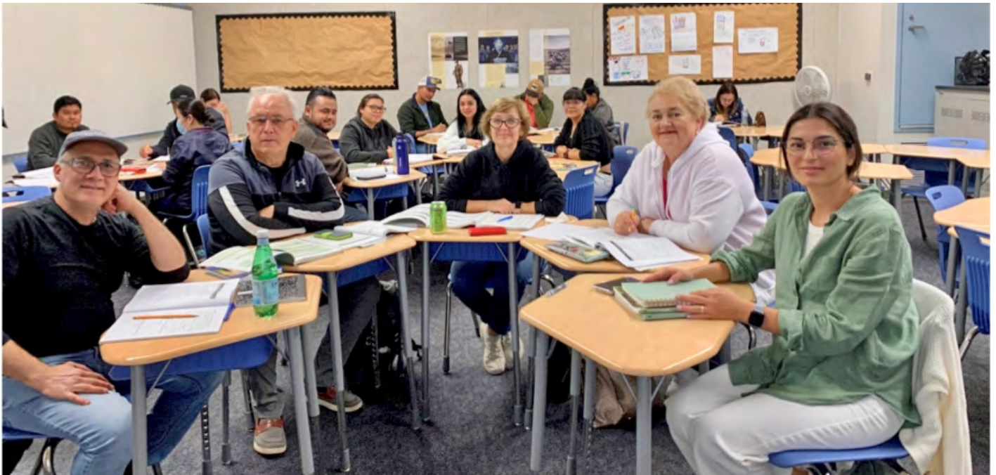
Several Spanish speaking countries, Russia, Ukraine, Turkey, Iran, Brazil, Vietnam, and Italy are all represented in this High Intermediate English as a Second Language course.