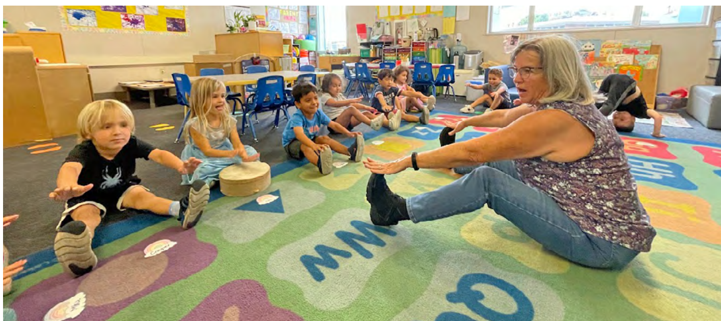
Musical Name Game.