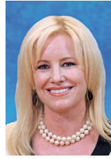
Ashleigh Aitken Mayor

It's a new day in Anaheim, and I'm proud to play a leading role as the city's first female mayor in Anaheim's rich 165-year history.