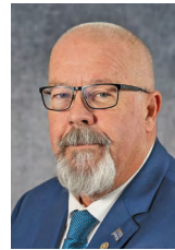
Ward Smith Mayor

The City of Placentia has nearly 52,000 residents who enjoy a close-knit, quiet community with great schools, wonderful amenities, and many exciting developments. Mayor Ward Smith was elected to the City Council in 2016 and reelected in 2020. He has been a Placentia resident for most of his life, and before serving on the City Council, he spent his career with the Placentia Police Department, eventually retiring as Chief of Police. Top priorities for Mayor Smith include public safety, investment in the Old Town and Transient Oriented Development Districts, and City infrastructure rehabilitation, including streets and parks. A robust infrastructure forms the backbone of a thriving city, and Placentia is committed to rehabilitating its streets, roads, parks, and buildings, ensuring they are resilient and capable of accommodating future growth. Understanding that green spaces are essential for a healthy community, the City Council adopted the Placentia Parks Initiative in 2021 to revamp all City parks to promote physical well-being and foster social interaction and a sense of community.