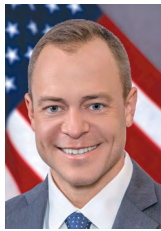
Austin Lumbard Mayor

This past year, the City of Tustin was honored to be ranked the number 1 city in California and 12th nationwide in Fortune's 25 Best Places to Live for Families. Tustin welcomes people of all ages and backgrounds and we are proud of our diverse family friendly community.