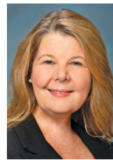
Anne Hertz-Mallari Mayor

I am incredibly proud to serve as the 2023 Mayor of the City of Cypress, a city with a small-town feel and big-city amenities. Cypress' door is open to everyone. From serving seniors who have lived here for a lifetime and young families building a future to nurturing a business-friendly environment, we work diligently to deliver on a promise of progress.