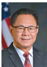
Chi Charlie Nguyen Mayor

The City of Westminster is a vibrant and diverse city that serves as a cultural destination with a rich history, and I am proud to serve my first term as Mayor.