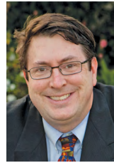
Thomas Moore Mayor

As I embark on my seventh year serving on the City Council, I am honored to be Seal Beach's Mayor in 2023.