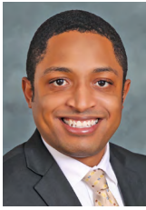
Richard Hurt Mayor

The City of Aliso Viejo is a thriving place to live, work, and play in south Orange County. I am honored to have the opportunity to serve as Mayor and to continue building upon the strong foundations of our community alongside my fellow Council Members.