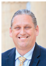
Tony Strickland Mayor

I'm Mayor Tony Strickland and I'm proud to serve you as Surf City's Mayor. As a former State Assemblyman and State Senator, I can tell you by far, being Huntington Beach's Mayor serves as a highlight in my life.