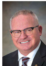
Howard Hart Mayor

It is a humbling and unique experience to serve as the Mayor of San Juan Capistrano, a city nearly as old as our nation itself. Founded in 1776, Mission San Juan Capistrano - the Jewel of the Missions - serves as the spiritual and cultural hub of our community. However, it is just one important aspect of our history. Even predating the Mission, the Acjachemen indigenous people maintained a sizable village in modern day San Juan Capistrano, known as Putuidem, which is replicated at our Northwest Open Space. We also boast the oldest continuously occupied neighborhood in California - our beautiful Los Rios Historic District.