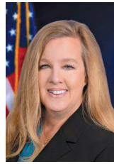
Kim Constantine Mayor

It has been my absolute honor and privilege to serve as Mayor of Fountain Valley – also known as “A Nice Place to Live” to nearly 56,000 residents. I remained active and engaged overseeing many pivotal and exciting milestones. This year, our City Council approved and received significant grant funding for Fountain Valley's first ever Universally Accessible Playground (UAP) in our Fountain Valley Sports Park. The City partnered with the Cities of Garden Grove and Westminster on a Navigation Center that will be a referral-based temporary shelter available to all 3 communities' unhoused population.