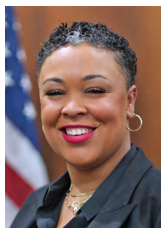
Tanya Doby Mayor

Recently named a 2023 Woman of Distinction by both the State Senate and Assembly, Mayor Tanya Doby first joined the Los Alamitos City Council by appointment in 2019. Seizing upon Mayor Doby's long history of community involvement and volunteerism, residents voted her to her first full term in 2020.