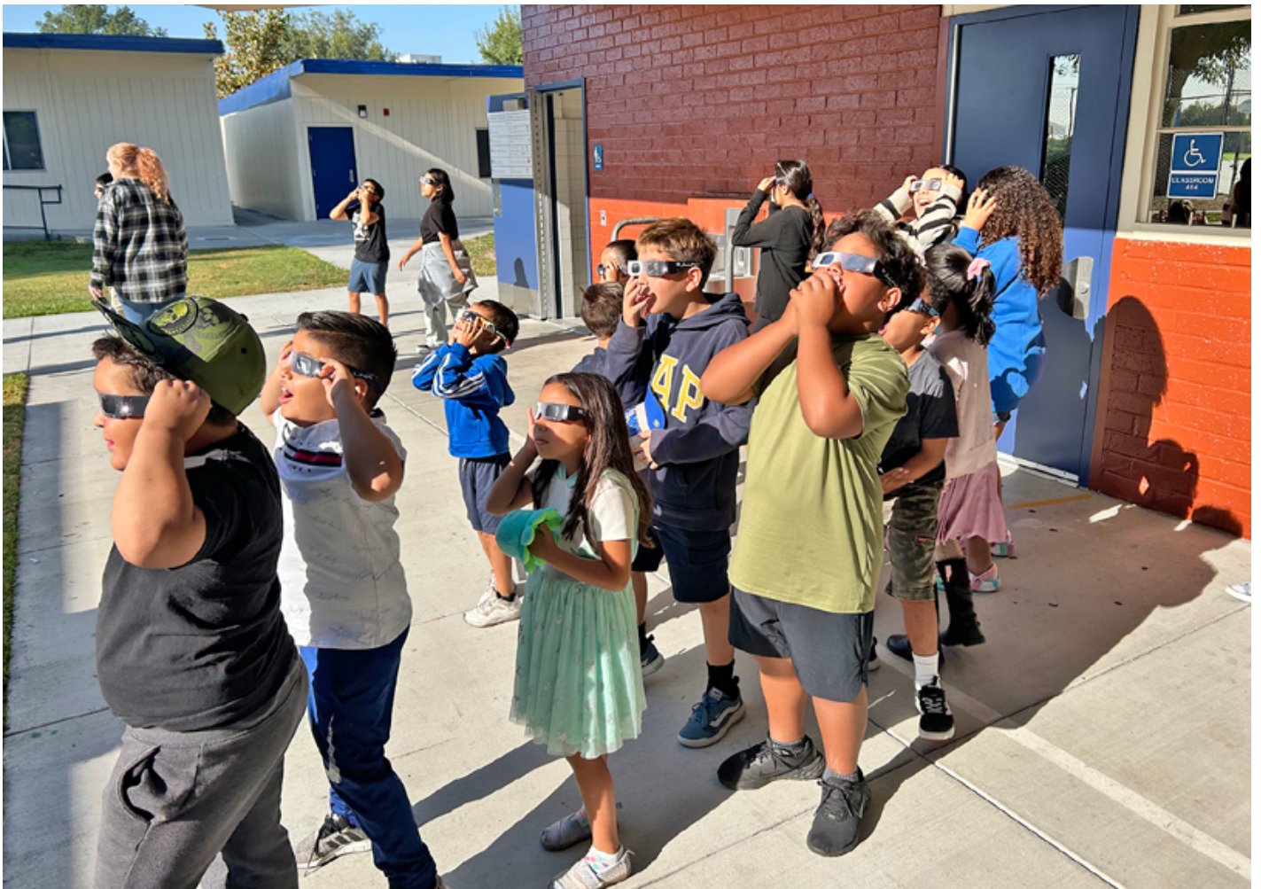
Students viewing the eclipse at Cresson's STEM Saturday School.

As the Cresson team continues to provide rigorous academic instruction, intentional academic support, and compassionate social emotional development, we will continue to see students capable of handling social and academic challenges.