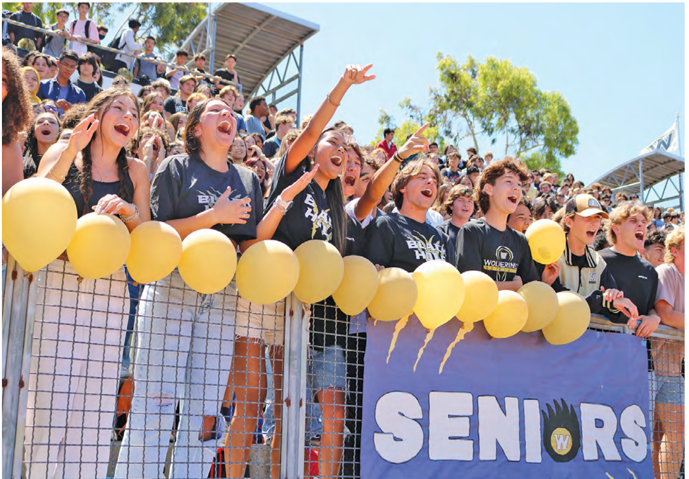
Westview High School Seniors showed off their school spirit during the first pep rally of the new school year, organized by Westview's ASB (Associated Student Body).

High levels of student and parent involvement contribute to Westview's vision and success. Stakeholders support the vision through involvement in ASB leadership, the Student Senate, PTSA, the Foundation and student/parent participation on school and district decision-making bodies. We work collaboratively to make a positive impact in the community and to enhance the culture and overall well-being of our students, staff and families.