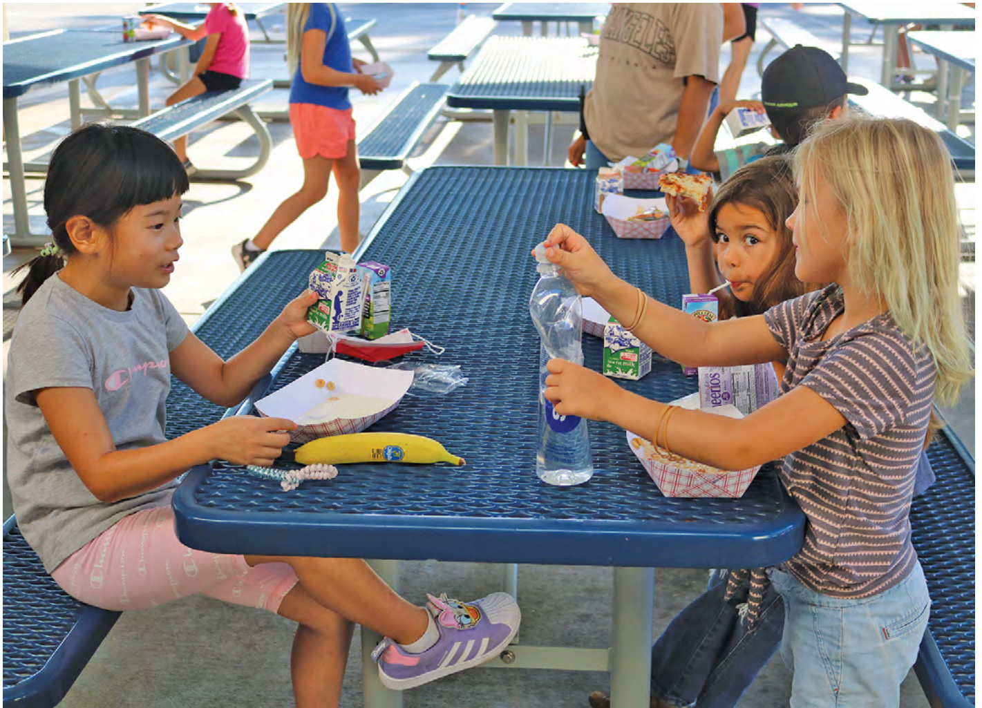
Painted Rock students enjoy free breakfast and lunch at school, as part of California's Universal School Meal Program. All Poway Unified students have access to free breakfast and lunch, Monday through Friday.

Our Mission Statement is that we believe that every child can learn. To fulfill our mission, we provide a comprehensive TK-5 program to maximize a wide variety of learning strategies, experiences, and levels of support to promote student learning. We provide students with a rich and rigorous academic program, successful fine arts and technology device initiative programs, character building and self-esteem programs, and a variety of physical education activities to promote a healthy lifestyle. Our goal is for every student at Painted Rock to reach their highest potential through our challenging and differentiated educational program. We believe that as elementary educators we have a professional and moral obligation to successfully establish a firm learning foundation for all our students. We are committed to ensuring that all students are solidly equipped with the necessary skills, knowledge, and character qualities to be successful at the secondary level and beyond.