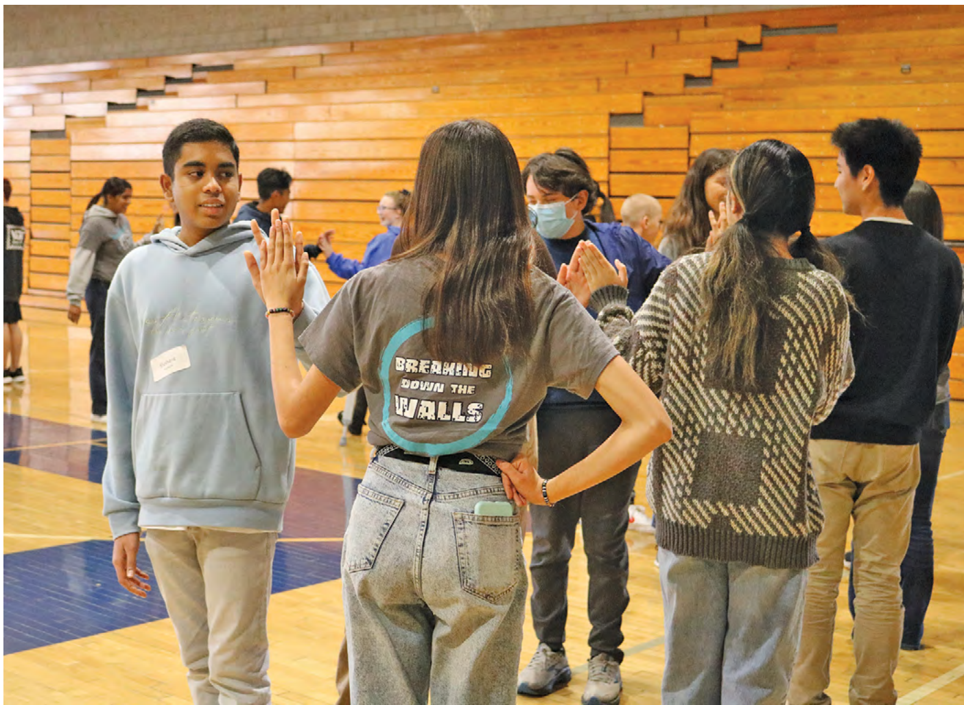
Rancho Bernardo High School student leaders host an annual Human Relations Conference to encourage students to connect despite their differences; the day is filled with bonding activities, deeper conversations, and guest speakers.

All of these facets work in concert to support the District's vision to create culture and conditions to empower world-class learners.