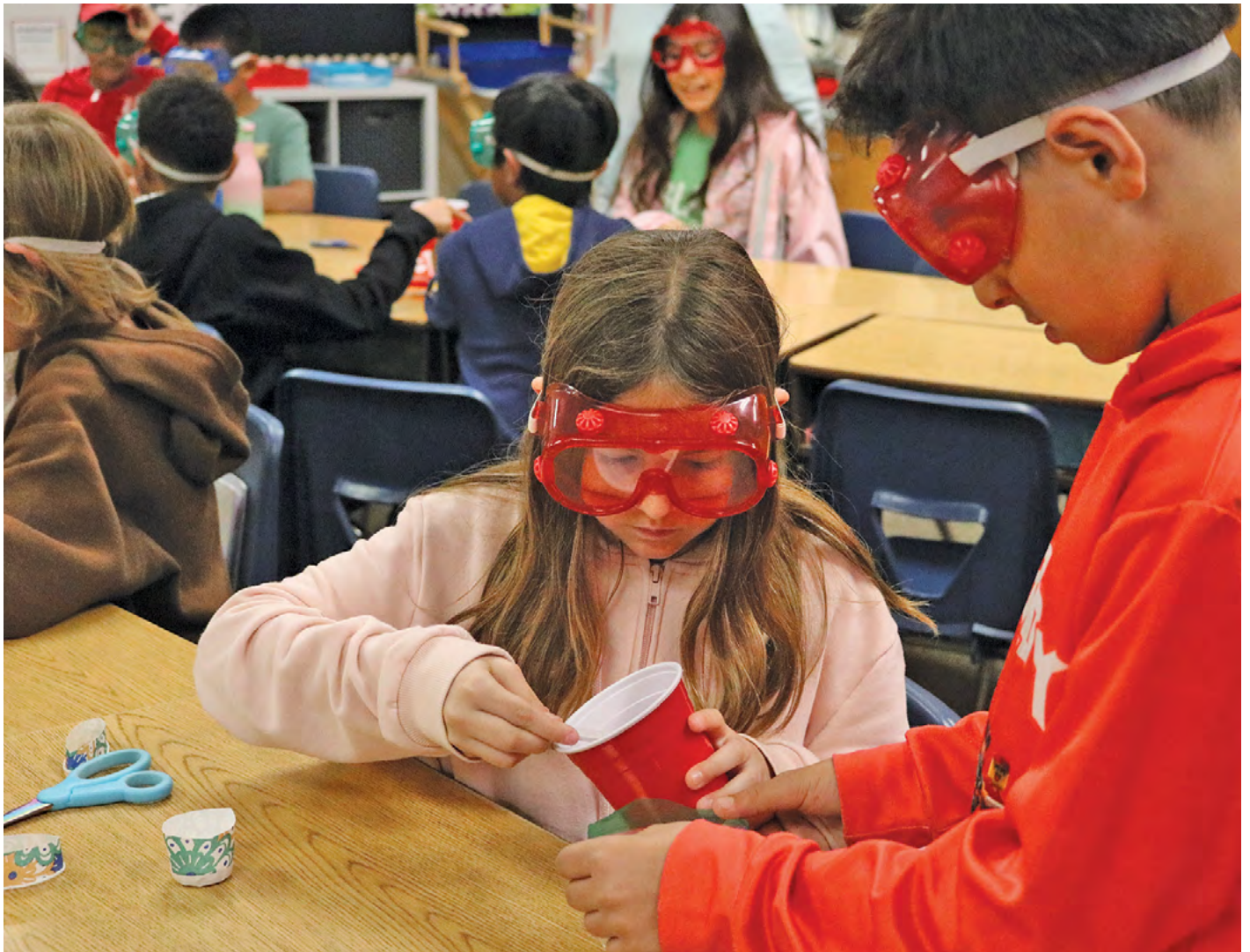
5th grade students enjoying a science experiment as they learn about chemical reactions and gas emissions.

Students are exposed to a unique program at Los Peñasquitos which has won numerous awards including the National Blue Ribbon School Award, The California Distinguished School Award and most recently the San Diego Impact Award. Welcome to NEU!