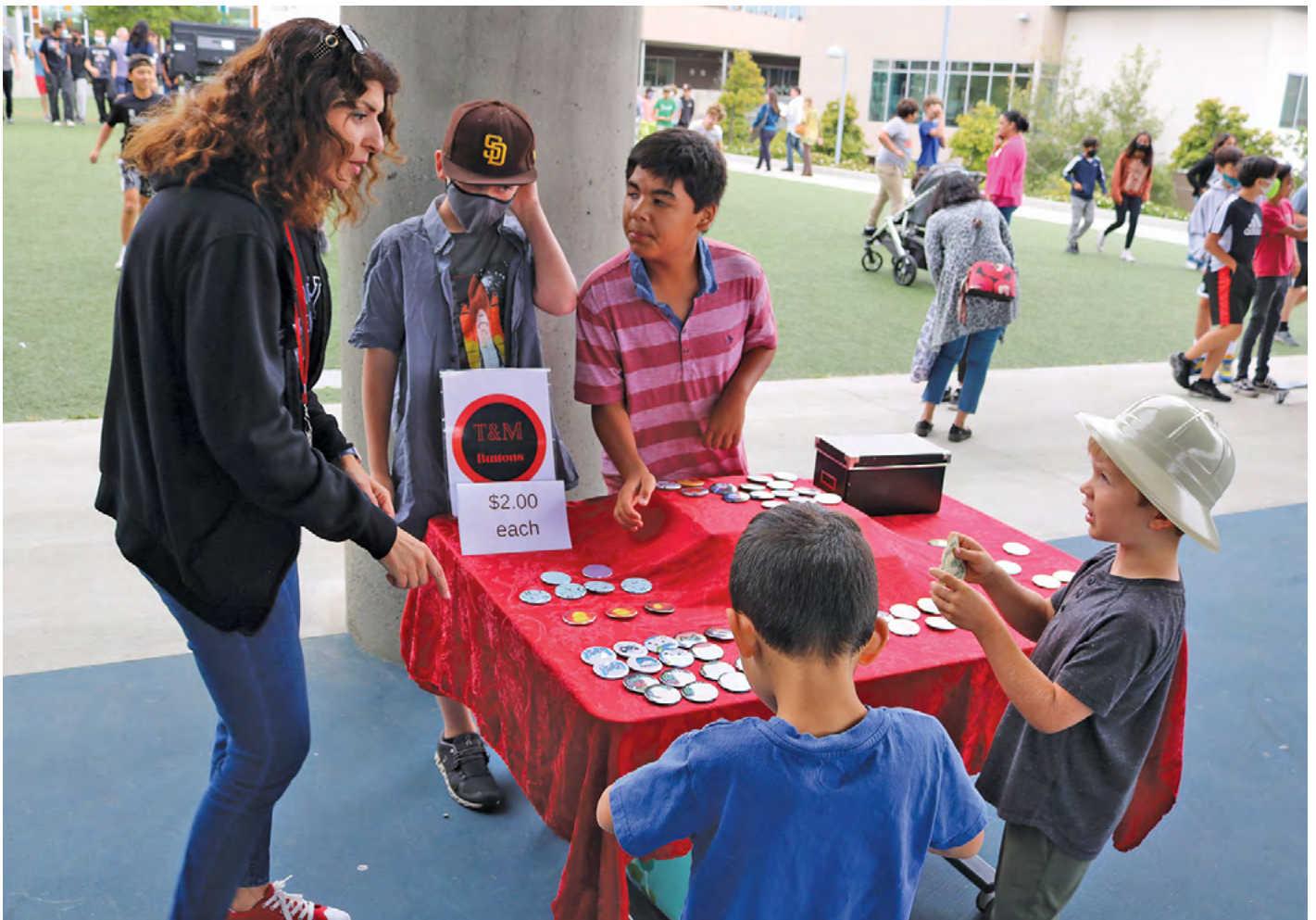
Design39Campus hosts “Maker39,” an annual program where students of all ages create their own businesses, product pitches, prototypes, and then finally sell their products.

Our beautiful campus features glass walls to facilitate openness and transparency; flexible seating and writable surfaces to encourage student and colleague collaboration; and easy-to-move furniture to allow adaptability of the space over time. Educators come from around the world to learn how we are changing the way we do school. Once you visit, we know you will be impressed too!