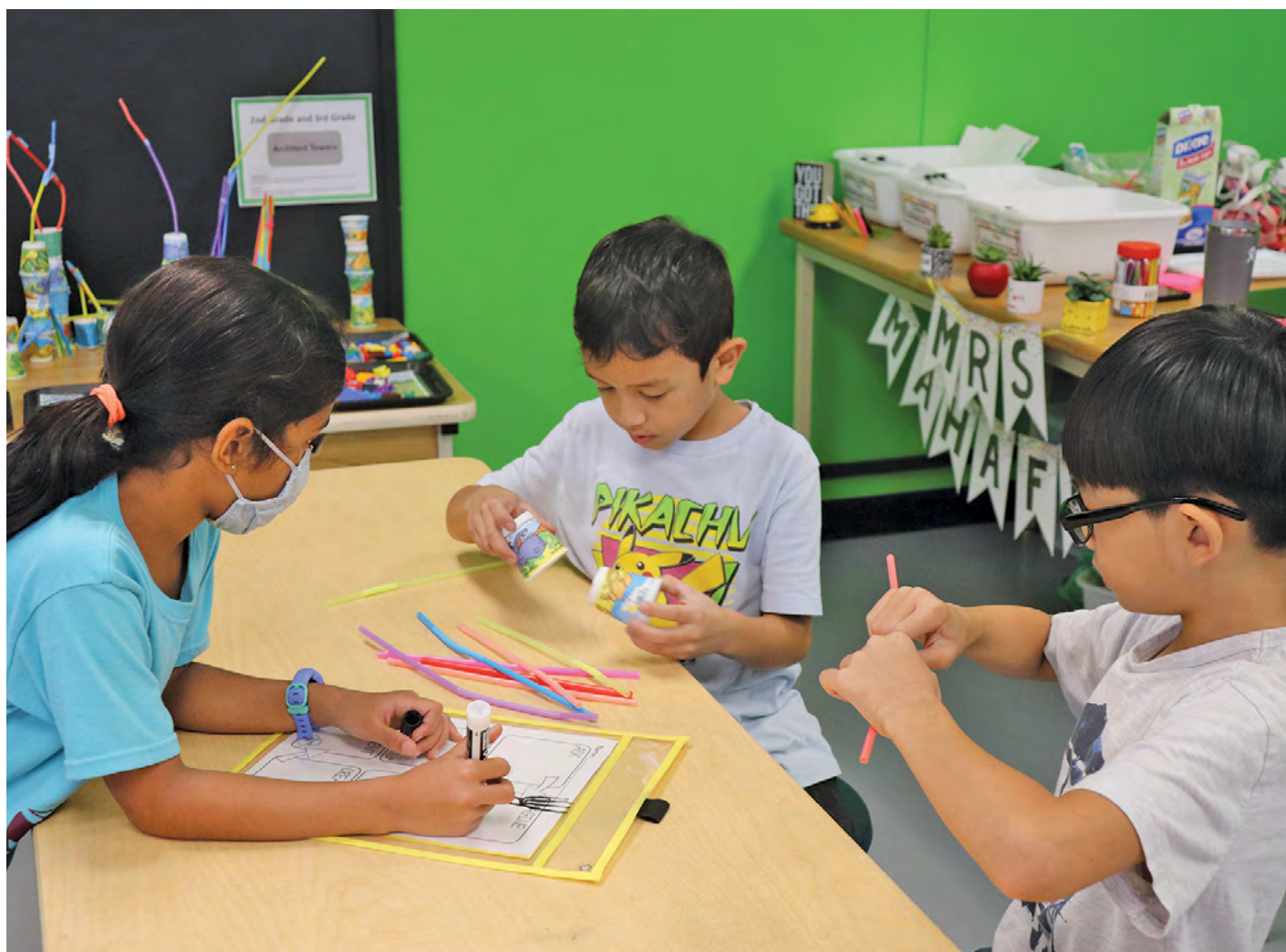
Morning Creek students visit the STEAM lab every week to explore Science, Technology, Engineering, Art, and Math.

As a college-focused school, each classroom at Morning Creek has adopted a college and students proudly represent their college by wearing their t-shirts and calling out their college cheers. Student goal setting is a core value at Morning Creek. It is the collective goal of staff to instill positive self-esteem and perseverance within each child. Students in grades 3-5 set personal academic goals for their learning, review their progress with their teacher, and develop a plan to achieve the goal. Goal setting helps students take responsibility for their learning and helps them see the relationship between effort and achievement.