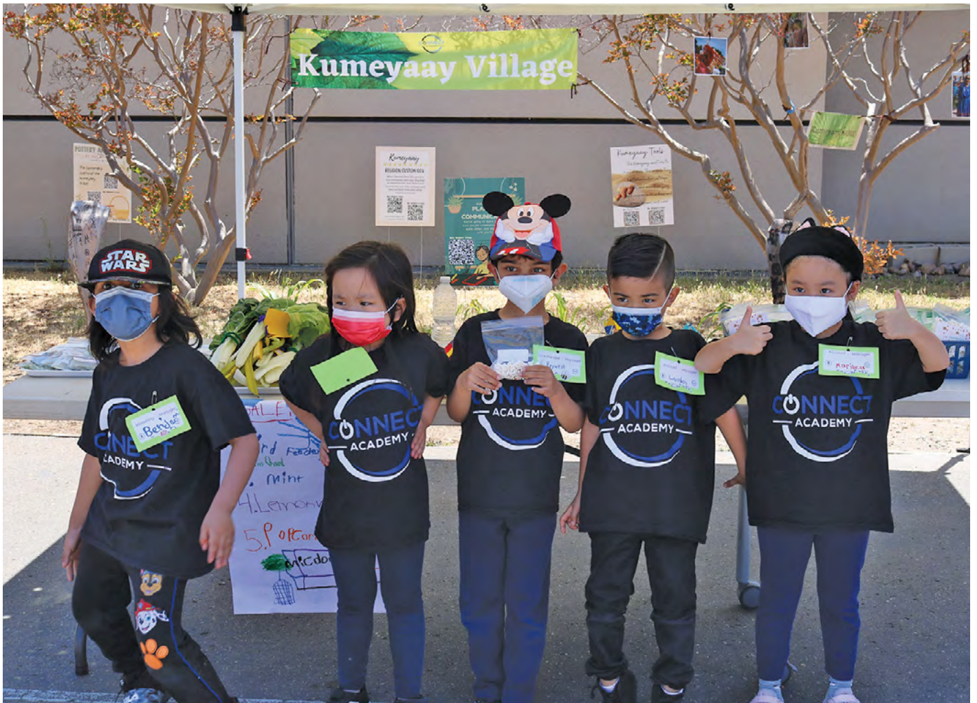
Connect Academy kindergarten students hosted a Farmers Market, where they showed off products grown in their school garden alongside the knowledge they learned about science and math.

We strive to develop resilience, kindness, courage, empathy, and creativity in our students through a flexible digital learning experience. We accomplish this by building trust and understanding within our community and creating partnerships and connections to share knowledge and extend our network to explore career pathways and opportunities for life readiness. We invite you to learn more!