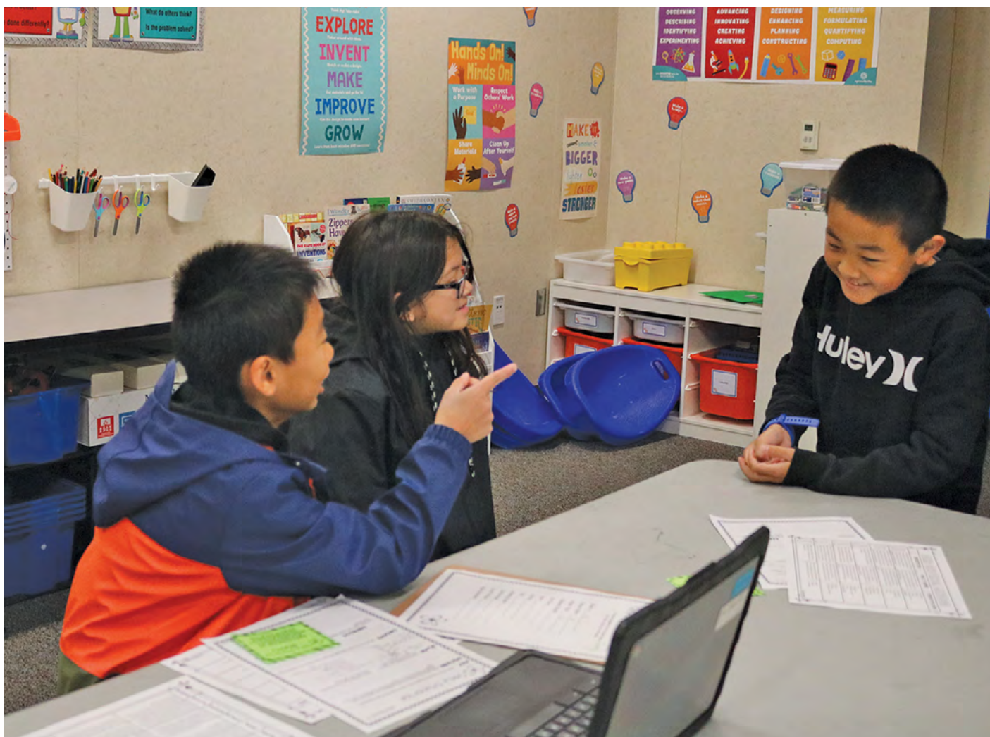
Rolling Hills students love visiting the STEM & Innovation Lab to create and collaborate with hands-on projects.

Rolling Hills enjoys the support of an active school Foundation and many parent and community volunteers. The Foundation supports our school and community goals to provide resources that address the needs of the “whole child.” In addition to providing resources for academic intervention, our Foundation provides funds for instruction in music, physical education, and technology, areas that we consider essential components to a well-rounded education. By providing a rich educational experience for all students with multiple pathways to access learning, we believe our students gain confidence in themselves, advocate for their learning, and understand the importance of being a lifelong learner. Our community members often refer to Rolling Hills as a “hidden gem” in Poway; we are proud of the positive energy and joy in learning evident throughout our campus as we work together to meet and exceed our goals.