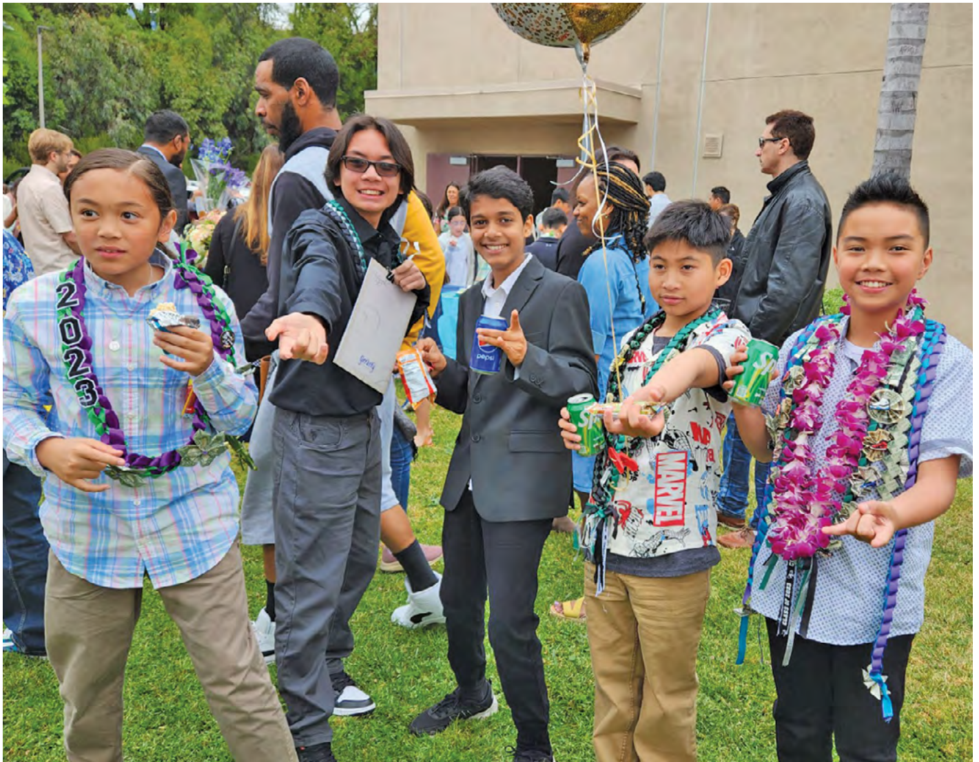
Promoting 5th graders from Turtleback Elementary celebrated with their classmates before heading to middle school.

Turtleback proudly serves as a nurturing and inspiring place for learning where staff is dedicated and committed to the development of the whole child. This commitment is exemplified through our rich and rigorous academic program, our successful fine arts and technology device initiative program, our character building and self esteem program, and our emphasis on a variety of physical education activities to promote a healthy lifestyle.