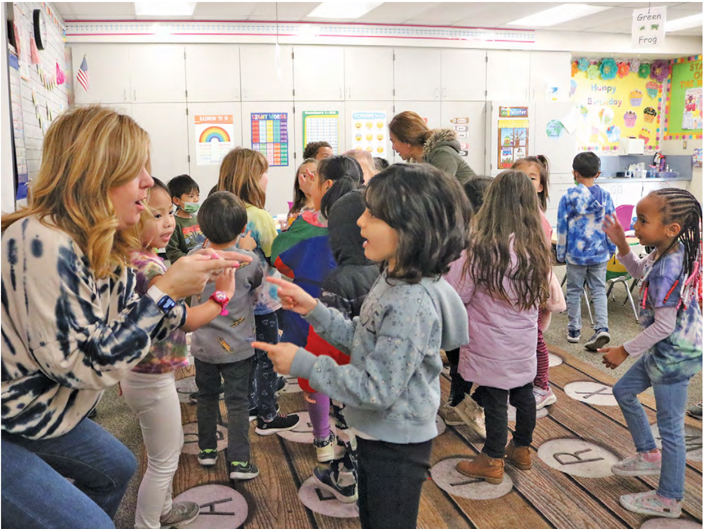
Highland Ranch teachers and staff work hard to create a welcoming environment – this class starts their day with a fun “Good Morning” greeting and activity to get students excited about the day.

Our PTA and our Foundation, as well as independent parent groups, work closely with staff to determine what our primary need areas are and to develop a plan to support those needs both financially and by volunteering. Highland Ranch lives up to its reputation as an outstanding school and instills in the students a commitment to lifelong learning, high achievement and dedication to the development of the Six Pillars of Character, and the modeling of these characteristics in staff and parents.