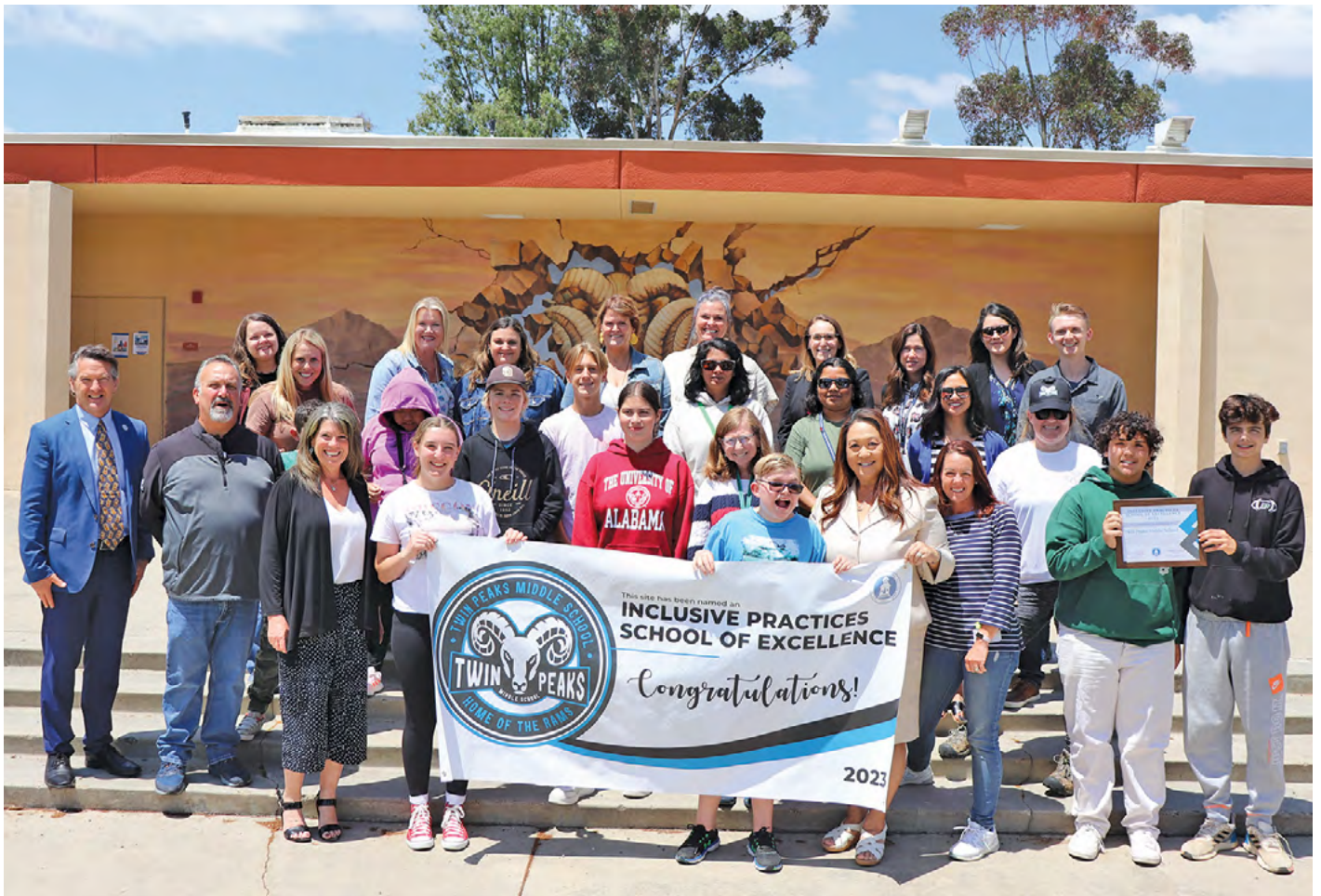
Twin Peaks Middle School is a proud Inclusive Practices School of Excellence, which is a recognition by the Poway Unified School District for efforts to include students with special needs in general education lessons and activities

At Twin Peaks, the student experience is not limited to academics. Students can choose to participate in a variety of clubs and intramural sports, including basketball, golf, wrestling, cross country, lacrosse, flag football and volleyball. Students also have access to leadership opportunities such as Where Everyone Belongs (WEB) and ASB.