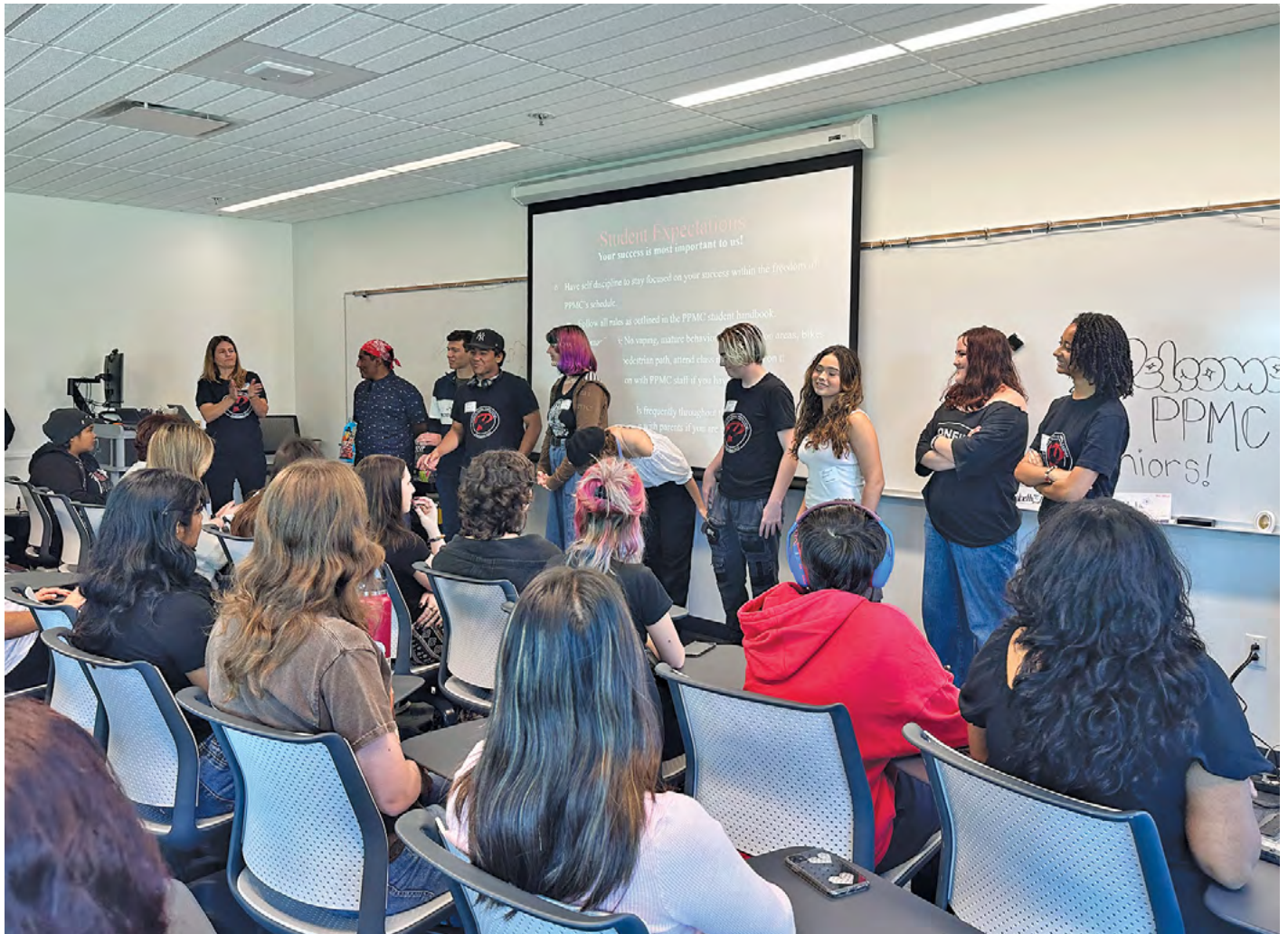
Returning PPMC students served as Senior Ambassadors, to welcome incoming juniors and seniors during their first week of school. With fewer than 100 students, PPMC students are able to take ownership of and design their own student experience.

Additionally, they will actively participate in work-based learning experiences, including internships and practical work opportunities, equipping them with valuable real-world skills. By the time they graduate from the middle college program, these students will possess the essential knowledge, skills, and attitudes required for success in college, career, and life. Notably, they will achieve the remarkable feat of earning both a high school diploma and college units, setting a solid foundation for their future endeavors.