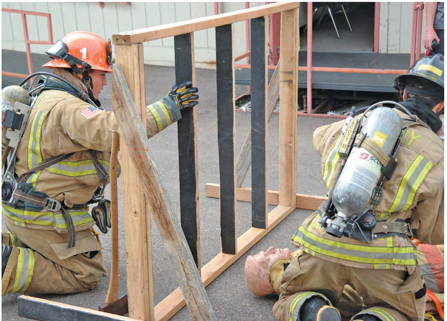
Mt. Carmel High School’s unique career technical education programs include a public services pathway, with fire science and Emergency Medical Technician (EMT) courses that meet requirements at Palomar College.

Our mission is to have all students develop the broadest set of choices for college and/or career paths upon graduation and to have the skill-sets, mindsets, and knowledge to succeed on their chosen path.