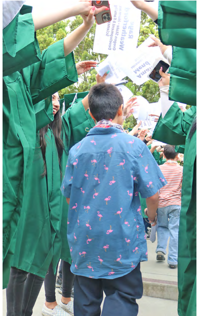
Former Midland students (Poway High graduating seniors) returned to their alma mater to help celebrate the promoting class of 5th graders.

Academic achievement is paramount to our vision. We have shown excellent progress with the majority of students demonstrating proficiency in Math and English/Language Arts based on California State Standards. Moving forward, we aim to help students discover their strengths and passions, ensuring a promising future.