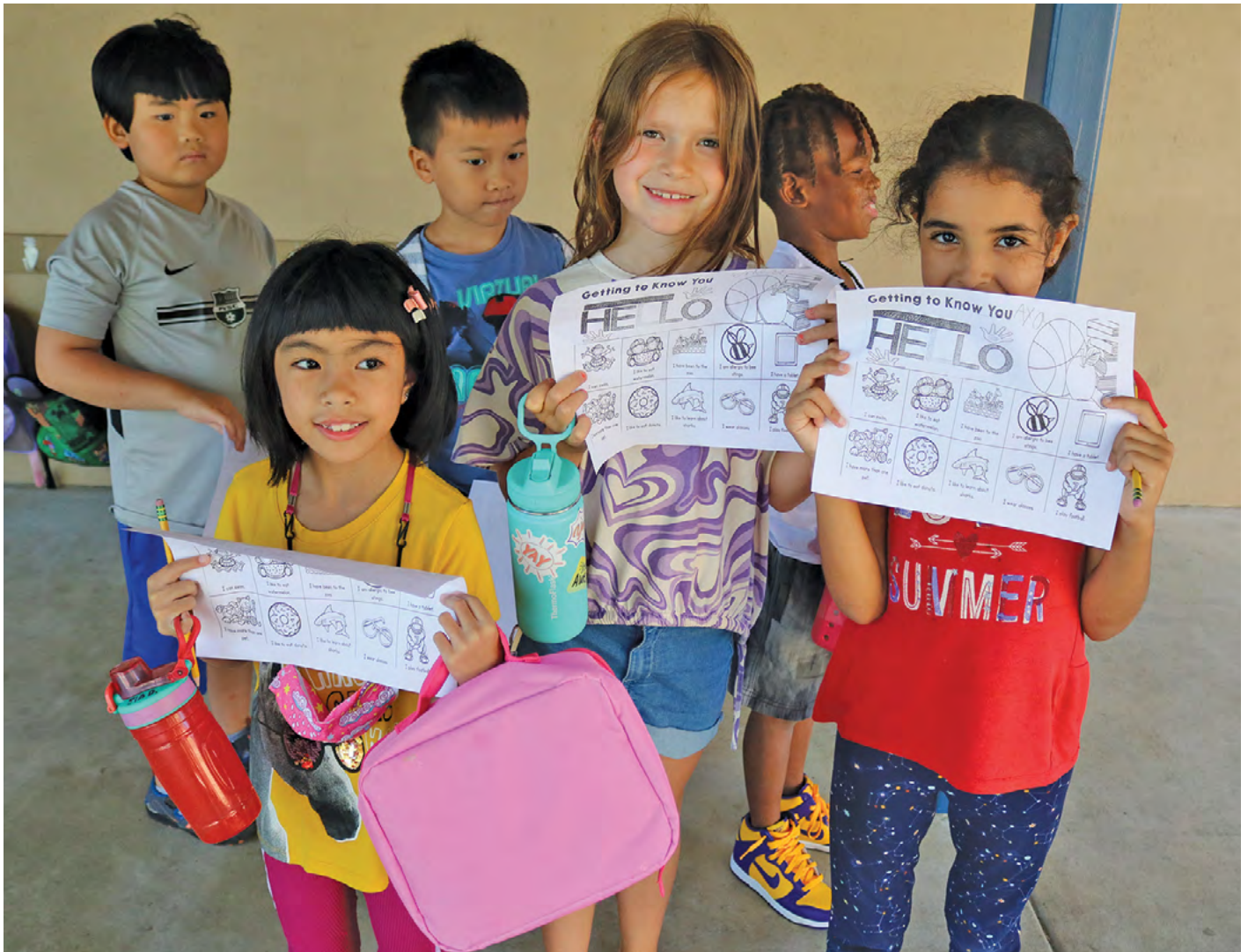
Students create a positive message of kindness and inclusiveness during Start with Hello Week.

Learning doesn’t happen in isolation, but rather, as a result of all stakeholders working together holding one vision – the education of all our students!