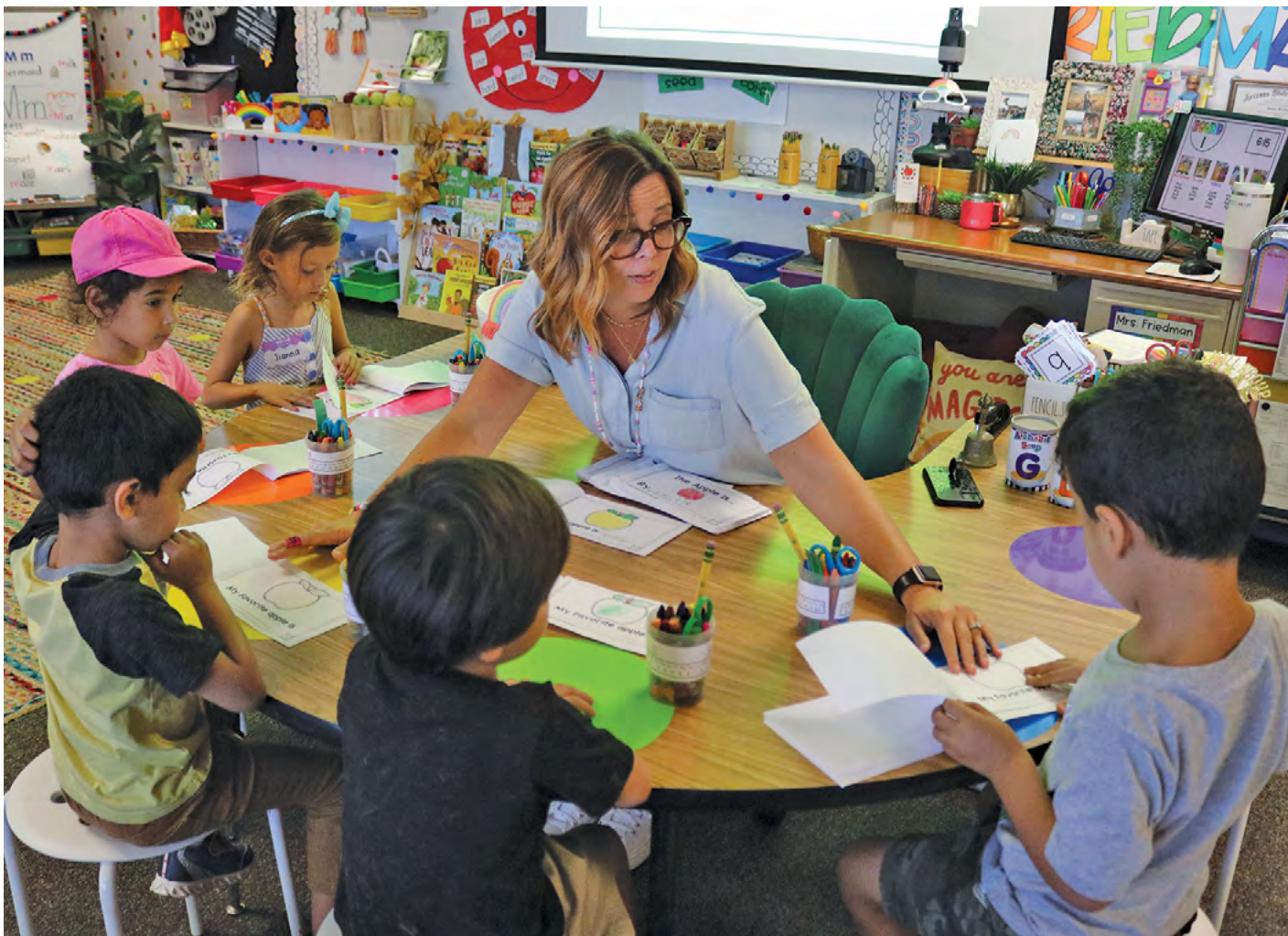
Deer Canyon's Transitional Kindergarten classes offer a nurturing learning environment for some of our youngest students. Transitional Kindergarten (TK) is designed as the first year of a two-year kindergarten program that uses a modified kindergarten curriculum for 4-year-olds.

The teachers and support staff at Deer Canyon believe that a strong academic focus supported by a positive and caring learning environment is essential to student success. Equally important is the emphasis here on developing the whole child through early mental health programs, character development and service learning opportunities. The school climate is truly peaceful with student rights and school rules maintained campus wide.