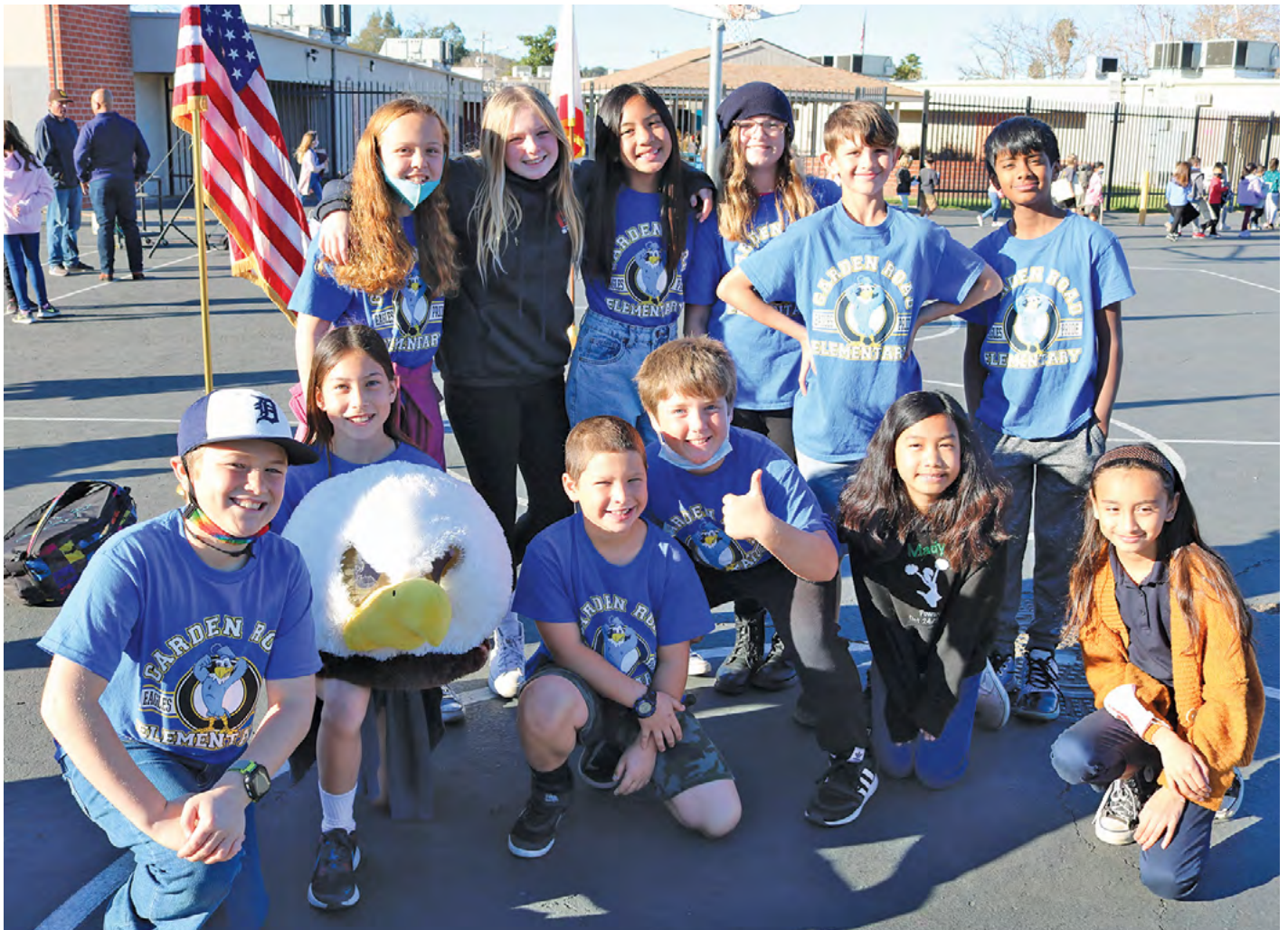
Garden Road has implemented the Leader in Me program – to empower students to take on leadership roles, including tutoring younger students and leading schoolwide Friday Flag assemblies.

Our goal is to support the highest level of academic achievement and social emotional growth of our students, and to promote and recognize student leadership and academic achievement.