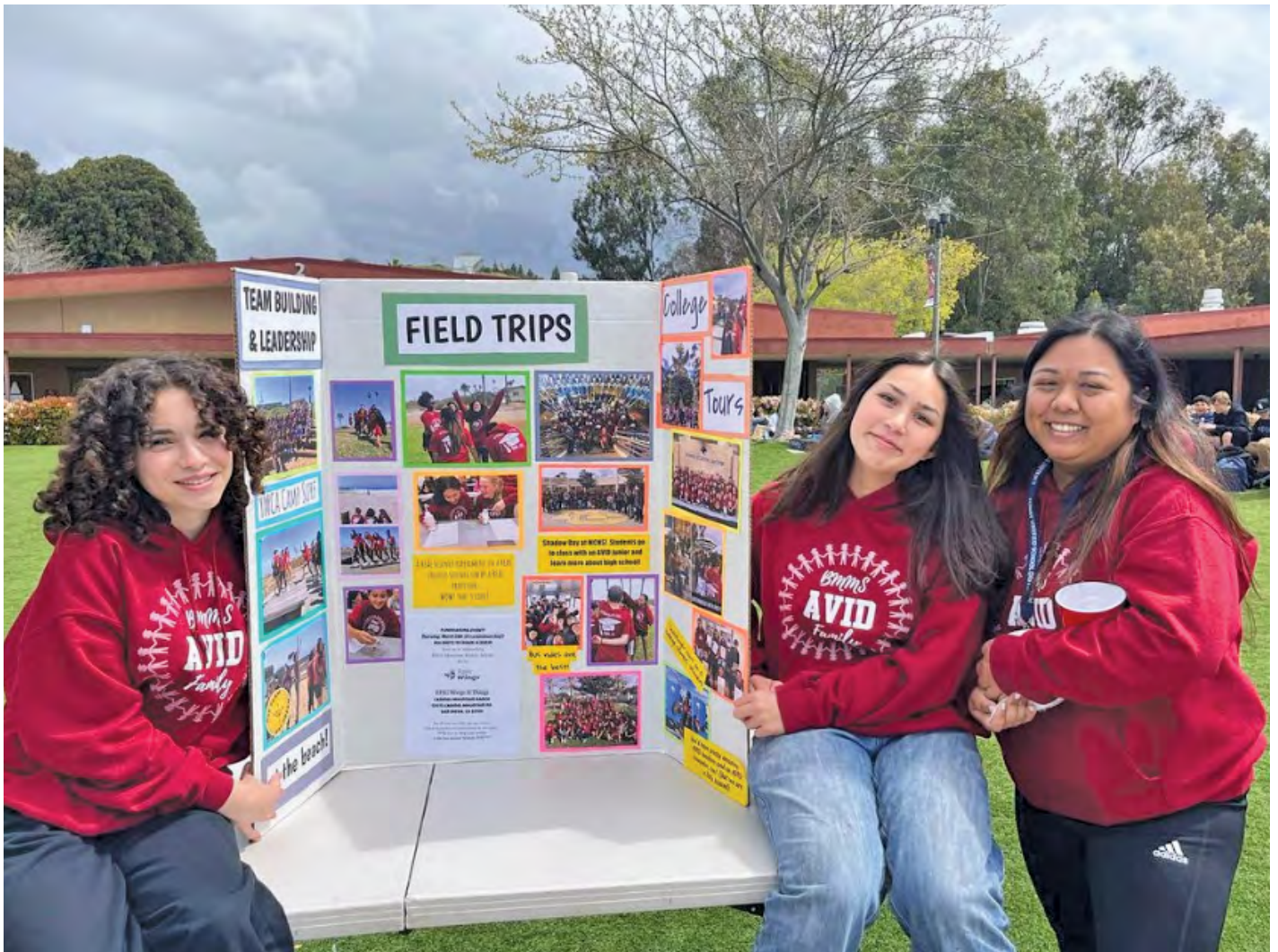
As a National AVID Demonstration School since 2009 and AVID Site of Distinction since 2019, Black Mountain strives to create a schoolwide culture of college, career, and life readiness. These 8th grade students recently displayed their public speaking skills and school pride at an AVID showcase to recruit future AVID students.

It is recognized on our campus that memorizing facts and information are not the most important skills for our students to master. While there is a time and place for these skills, we understand the need for our students to think more deeply, read with a powerful lens, and write with purpose. One of the ways that we achieve this is through our belief of AVID and its focus on critical reading, writing and thinking. We utilize AVID strategies and its best practices in all our classrooms.