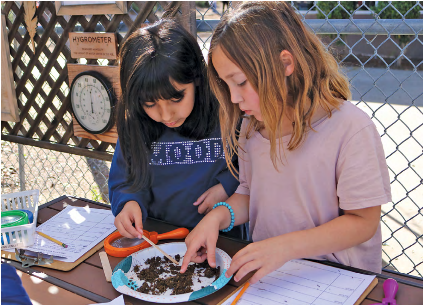
Students love their school garden, where they apply their math and science skills while enjoying the fruits of their labor.

Our school goals are to increase student responsibility for individual behavior and to promote academic excellence for all students. Chaparral is a district leader in integrating character education throughout our academic curriculum. Our mission statement reads: "The students, parents, and staff of Chaparral Elementary School create a positive and productive environment that instills in each child, strength of character, a sense of community, and love of learning." Teachers' teams have been trained in Responsive Classroom, a program highlighted on the federal list of best practices for character education. In our classrooms, one can observe strategies such as morning meetings, academic choice, and cooperative structures to teach and support appropriate social development and academic achievement. Chaparral Elementary School is a place where students and teachers can feel free to take educational risks. I encourage all students and staff to push their thinking, to tap into their imagination, and to increase the boundaries of possibility.