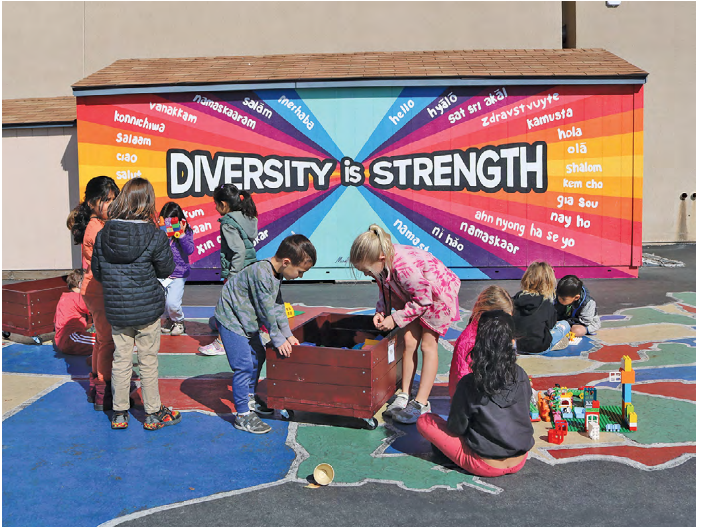
Del Sur's student body consists of students from richly diverse cultural, ethnic, linguistic, and religious backgrounds. We view our Diversity as our Strength!

It is our mission to be a technologically progressive school dedicated to providing high levels of learning for all students while being focused on exploring the richness of the past, the opportunities of the present, and the infinite possibilities of the future. Partnered with our state of the art technology, students at Del Sur will connect with the rest of the world giving them an unparalleled education.