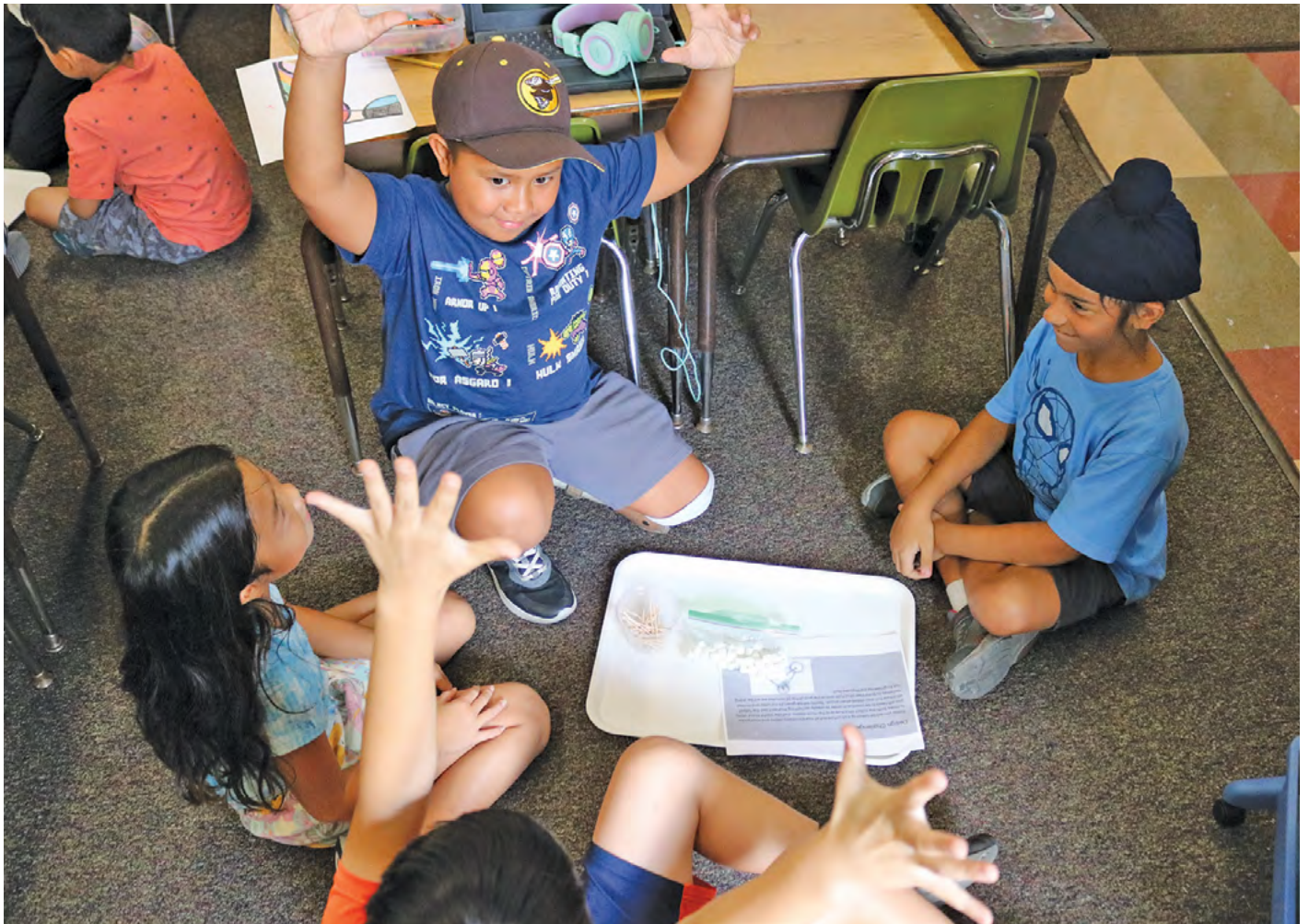
Sundance Elementary students celebrated International Dot Day, a global celebration of creativity, self-expression, and collaboration with a design challenge.

Because we have created a tight-knit relationship, we are able to provide the resources for a plethora of activities for our students. We know that we cannot reach these goals without working in partnership with our students' families and, therefore, have established strong parental engagement systems. Our active volunteer program, Foundation, and Parent Activity Committee (PAC) provide academic and social enrichment to our students. Our Foundation and PAC support the IMPACT teacher, fund assemblies, author book talks, family and community nights such as the annual Sock Hop, Talent Show, parent education nights, as well as a host of other wonderful monthly activities. We are proud that families remain our most important partners in the education of our children.