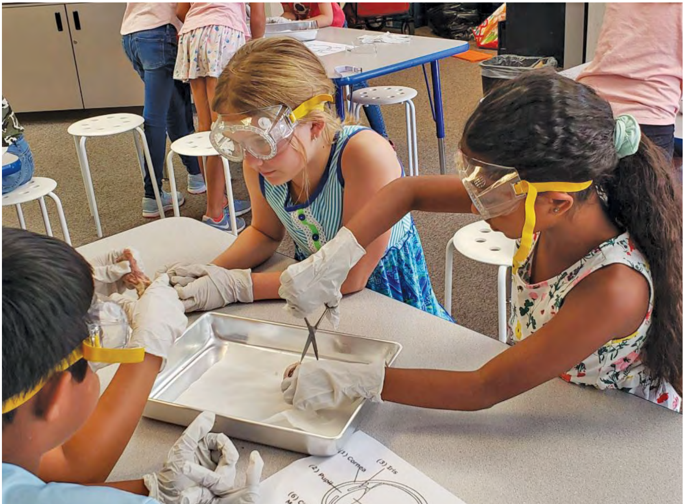
Park Village students learn about the anatomy of an eye and the science behind vision and sight in a dissection lab.

Each year PTA and Foundation volunteers provide over 20,000 hours of service and other community members help enrich student experiences with programs. Learning comes first at Park Village Elementary School where each child is valued and recognized.