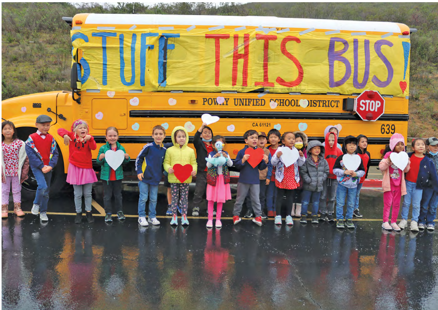
Shoal Creek Otters love giving back to the community, including the annual Stuff the Bus drive, to provide much-needed food to families in need.

During our 25th anniversary year, we are celebrating that one of our greatest assets is our strong parent/student/staff relationship that maximizes student achievement. This is the embodiment of what a united school community can accomplish.