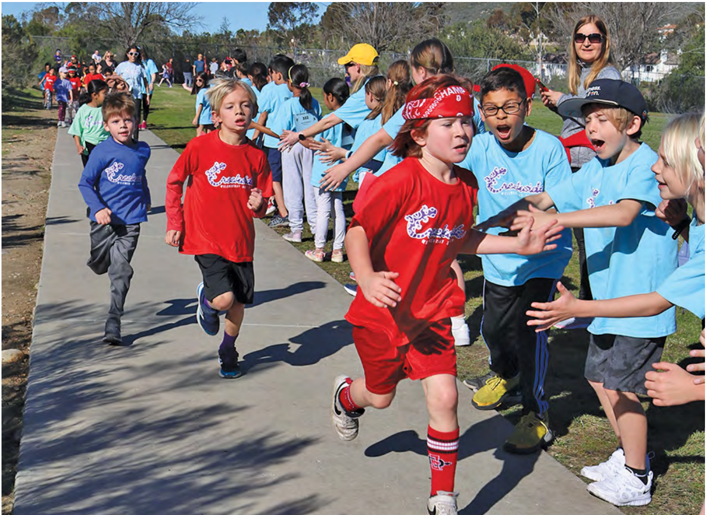
The Gecko Run is a schoolwide fundraising event at Creekside, with older students cheering on younger students as they run around the track. Guest military instructors also lead the students in warmup exercises.

With the support of our PTA and Creekside Educational Foundation, we are able to provide our students with enrichment opportunities in technology, math, art, and music. The support of parents and the numerous volunteers on campus each day contribute to the success of our students, as our community works toward our goal of each student leaving Creekside with Gecko Greatness, amazing memories, real world skills, and a lifelong love of learning.