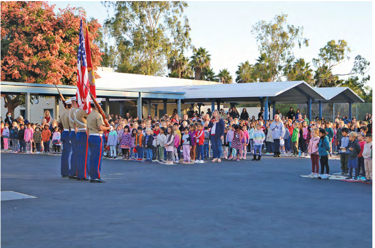
Westwood Elementary paid tribute to members of the military during their Friday Flag assembly in honor of Veterans Day.

Staff, parents, and community members agree that the collaborative spirit on campus is Westwood's greatest strength. By working together, an environment exists where learning is stimulating, child-centered, and focused on the unique qualities that all children bring to the classroom.