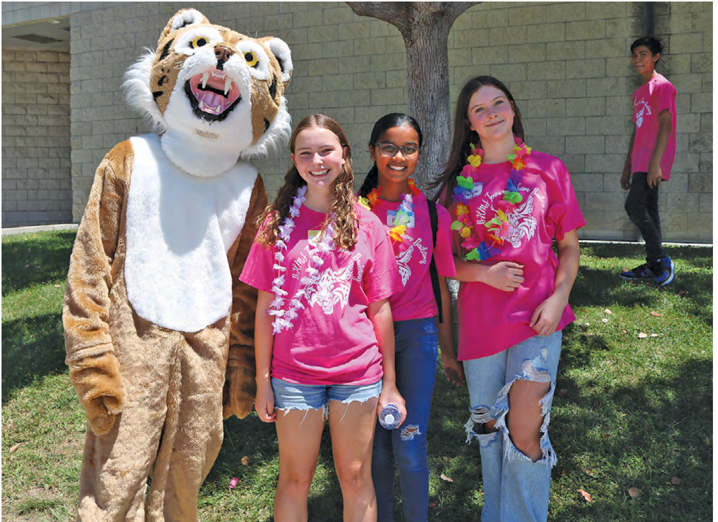
Bernardo Heights student leaders host an annual Bobcat Day at the beginning of the school year to welcome 6th graders and new students to middle school.

From our unique architecture to the exciting learning environment within our classrooms, Bernardo Heights is a vigorous, active educational center filled with the promise of tomorrow.