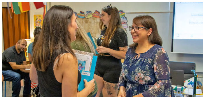
MUSD parent meets with Mayflower teacher after their info session for Back to School Night on August 24th, 2023. These events allow families to get a better idea of what to expect for the school year and build a rapport with their child's teacher.

We look forward to sharing this school year's growth and accomplishments. Thank you for being part of the Monrovia Unified School District community. Here's to a fantastic year!