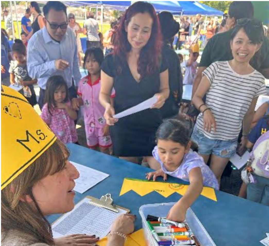
Students meet their new teachers at the Meet Your Teacher Event.

Monroe also hosted its annual Back to School Night. This event gave parents and guardians an opportunity to hear our classroom and school-wide expectations, the curriculum, and news of other events. Our awesome PTA and many of its community partners also attended the event to promote and provide support and opportunity to students outside of the classroom.