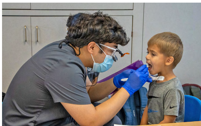
CELC student received dental screening from Western University dental students on August 31st, 2023. This new partnership will allow MUSD students to get dental screenings throughout the year.