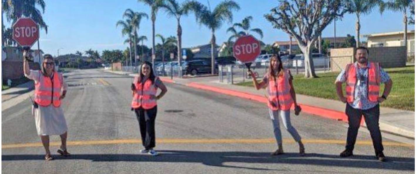
Be kind. Be Aware. Crosswalk Initiative.