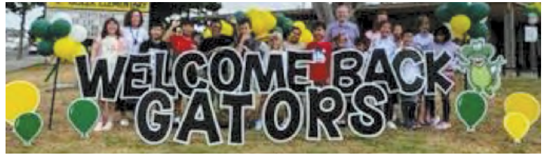
Welcome Back- 1st Day Photo

To our students, you are the heart of our school. Your curiosity and passion infuse energy and vitality into our halls. We're here to support you every step of the way.