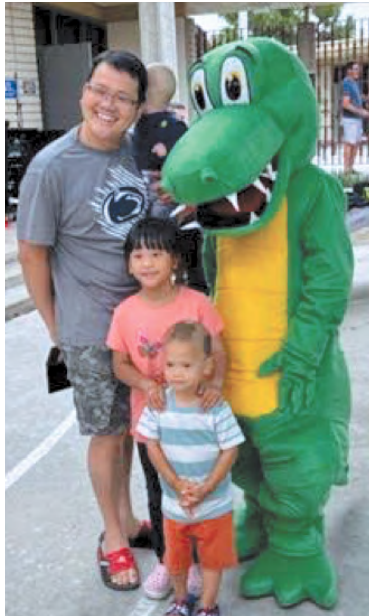
Mascot Meet & Greet

Welcome back to Gisler. Let's make this year exceptional!