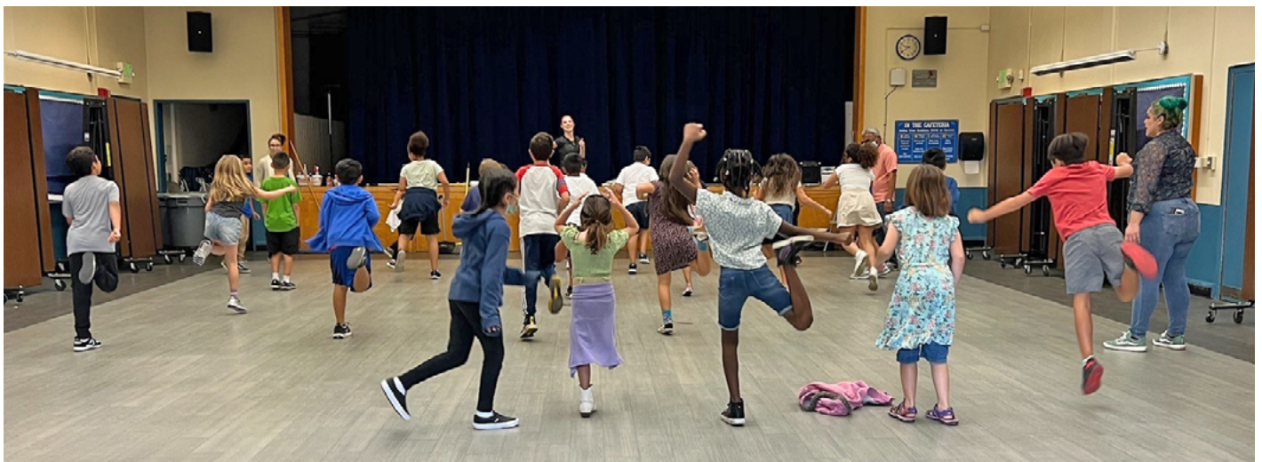
Dancing Dolphins in Action