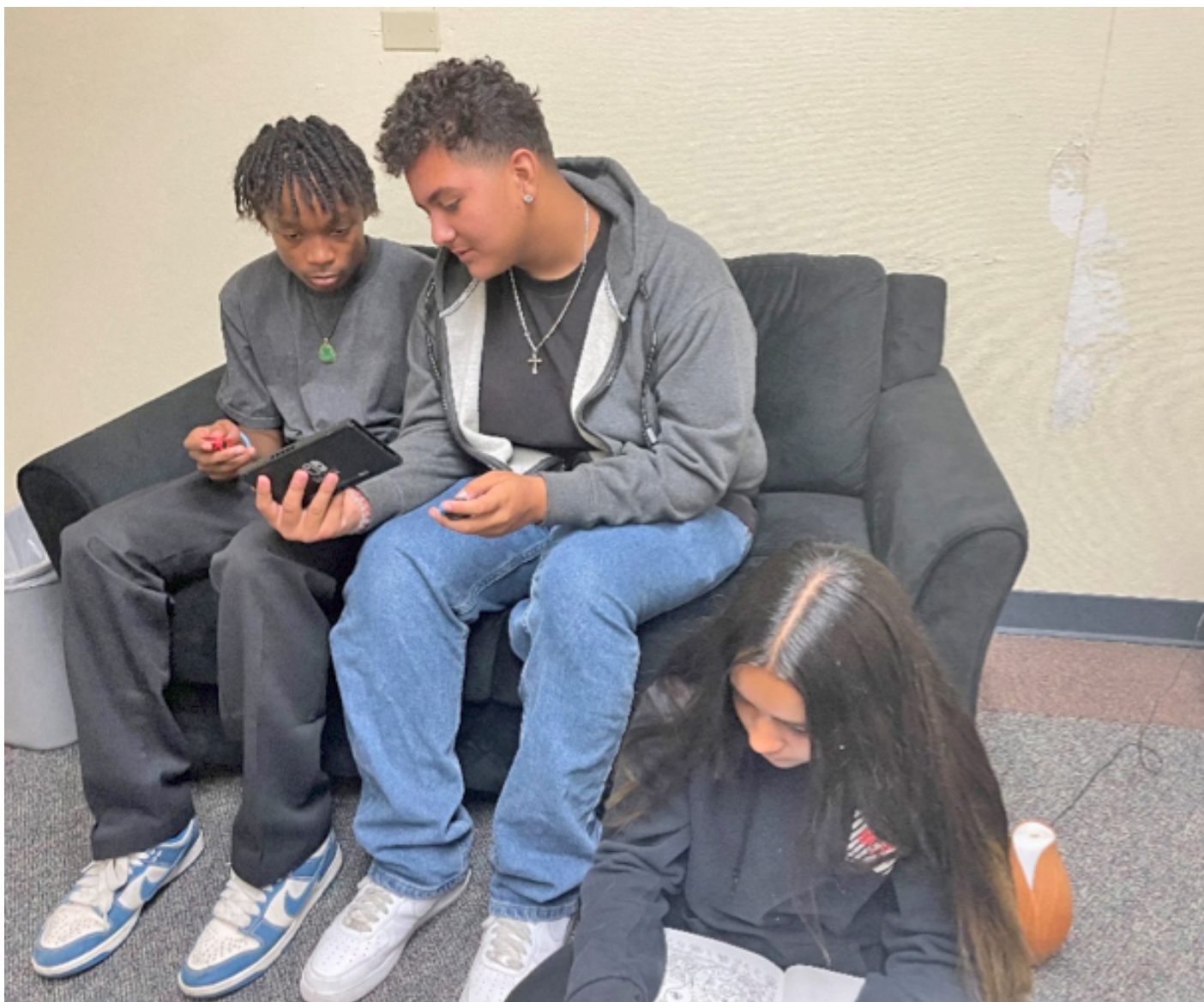
A few Maxwell students checking out the new space and activities.

The room is coming together with a futon, beanbags, fidgets, games, and even a Nintendo Switch. It offers soft lights and pillows for additional comfort. We cannot wait to invite students into the space and watch them grow and flourish in the Wellness Center.