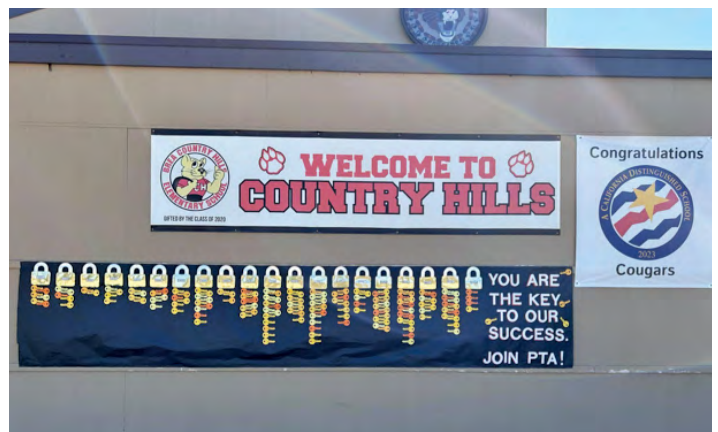
Country Hills PTA Membership Drive Poster.

Through our fund-raisers, we are able to provide incredible experiences for our students and classrooms