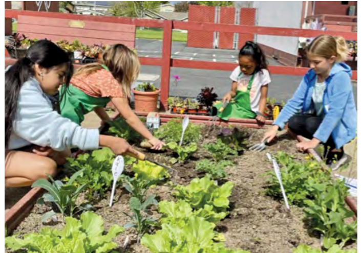
5th grade Jr. Master Gardeners giving support to our 2nd graders.

We are very thankful for all of the teachers and PTA members who continually support our garden. Their help and commitment is critical to making our garden always full of life, as well as a place for teaching our children how to be kind to the Earth.