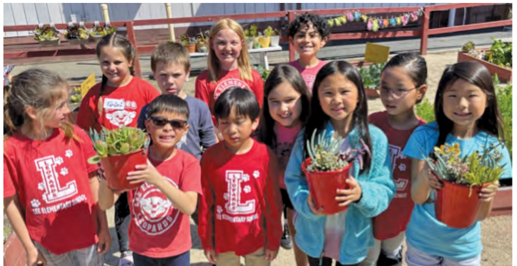
4th Grade Jr. Master Gardeners teach the 2nd graders all about succulents.