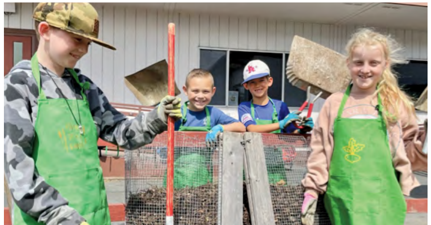
2nd and 3rd graders learn about composting. This compost is what makes our garden so beautiful.