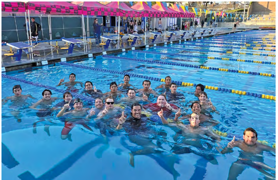
Boys Swim CVAA Meet Champions/Co-League.

Letters of Intent to play in college. Opportunities to play sports are available to each and every student and we strongly encourage participation. Congratulations to all MVHS student-athletes for a successful year. Go Diablos!