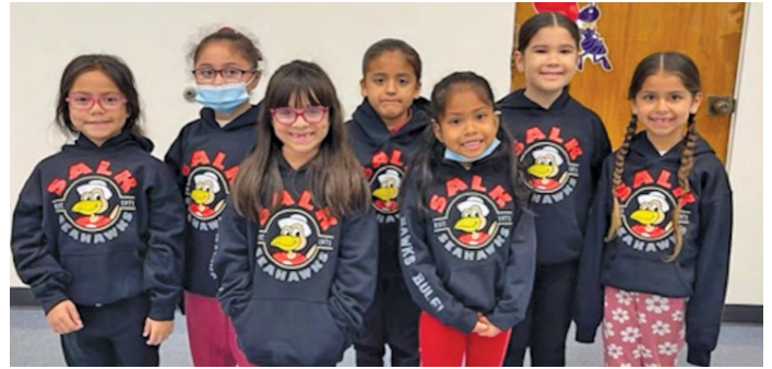
Our first graders are thankful for the generous donation.