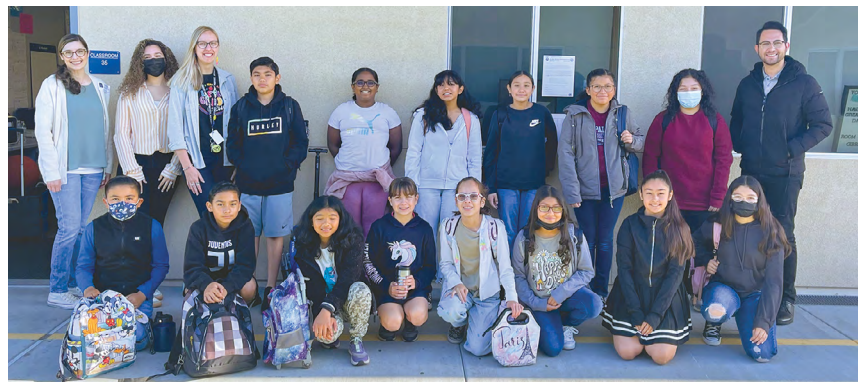
PAL Advisors and their Scottie leaders after attending a mental health awareness workshop.