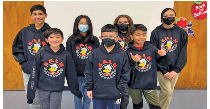
Seven lucky 6th graders received a new warm Salk hoodie.