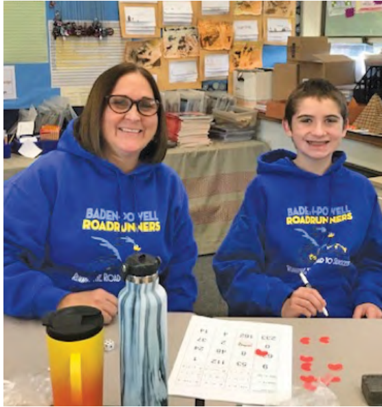
6th graders compete with order of operations.

But, on the very last Friday of each month, parents are welcomed into our classrooms to participate in fun and engaging math activities created by their