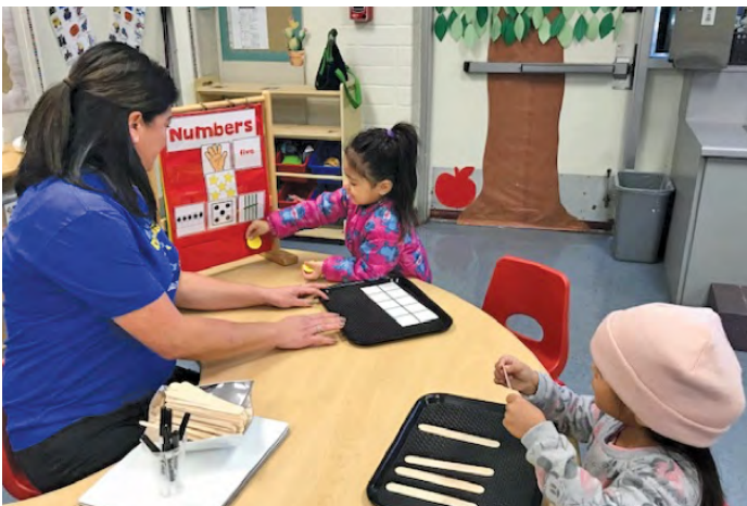
Pre-K students show ways to count to five.

child's classroom teacher. Families join their child/children directly following our weekly spirit assembly to participate in math activities that support our school-wide focus on building and reinforcing math proficiencies. The Family Fridays for math have been a huge success with each month's family attendance growing larger and larger as 'the word spreads'. Lord Baden-Powell is so happy to welcome families back on campus and we look forward to our final Family Friday in May. Go Roadrunners!