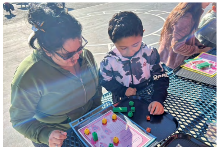
Kindergarteners add numbers using dice.