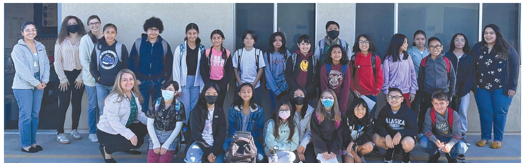
Pictured are OCDE's Youth Development Program Facilitators, Student Council students, their Advisors, and School Social Worker after learning about the importance of keeping our minds and bodies healthy in order to be our best selves.