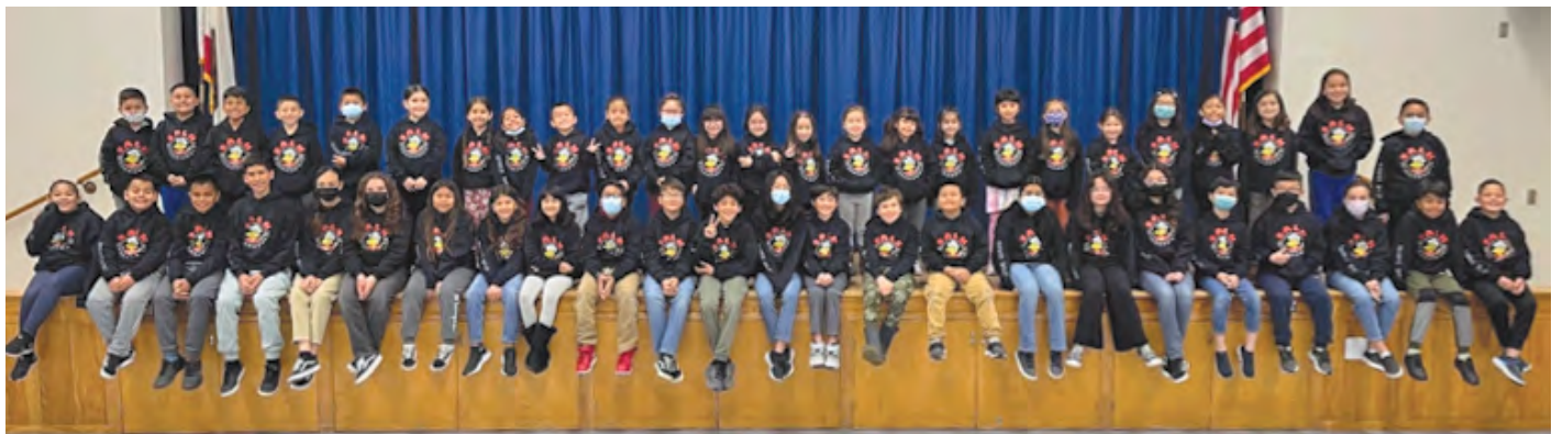
Over 70 Salk students received the gift of warmth – a new sweatshirt - purchased with a generous donation from Hyundai.