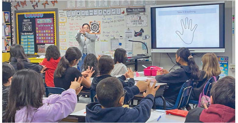
Students learn Calming strategies.

This collaboration sparked many ideas within the student leader groups of activities that can occur at recess to promote mental health. We are proud of our