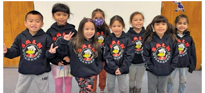
Salk Kindergarteners showing off their new Salk hoodies.