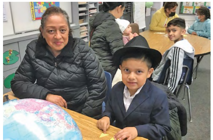
2nd graders create tangram figures.