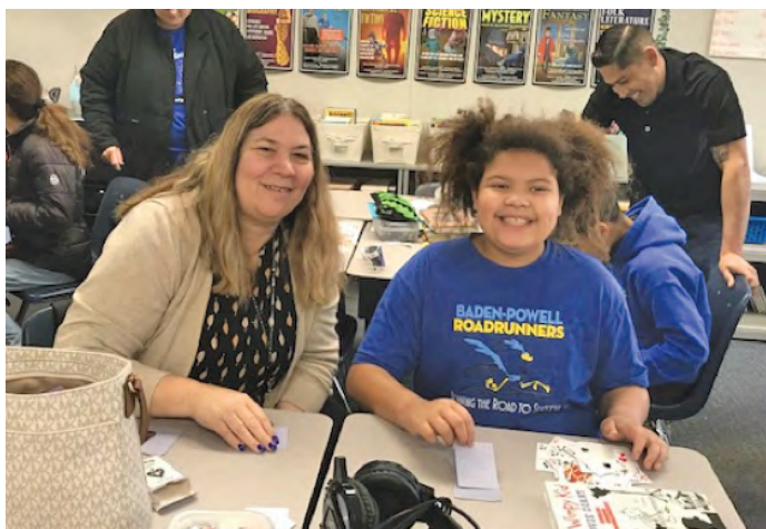
5th graders play multiplication 'war'.