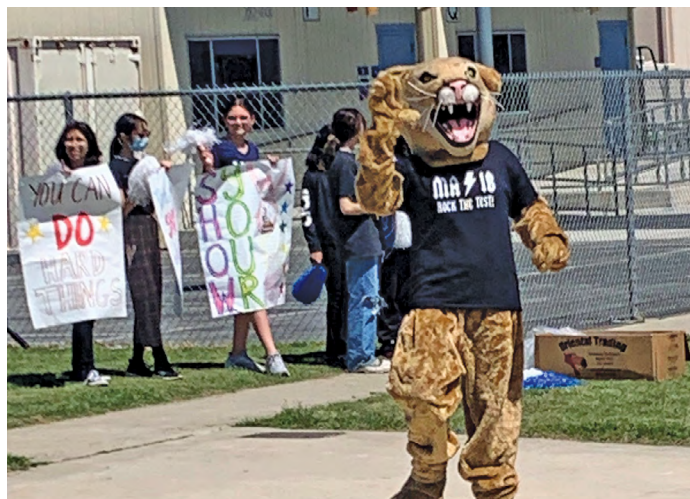
Max the Mountain Lion and ASB members helping to motivate us for testing.

a pep rally to encourage everyone to do their best! Even Max the Mountain Lion came to pump us up. We have been preparing all year and we are ready to show what we know. And as the year comes to an end, we are preparing to celebrate our promoting 8 th graders, our bridging 5 th graders, our moving on kindergarteners, and each and every accomplishment of all our students. It has been a wonderfully busy year full of learning!