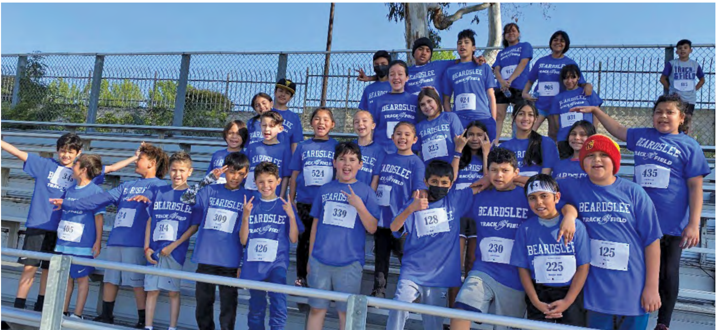
Beardslee track students gearing up for the District Track Meet.