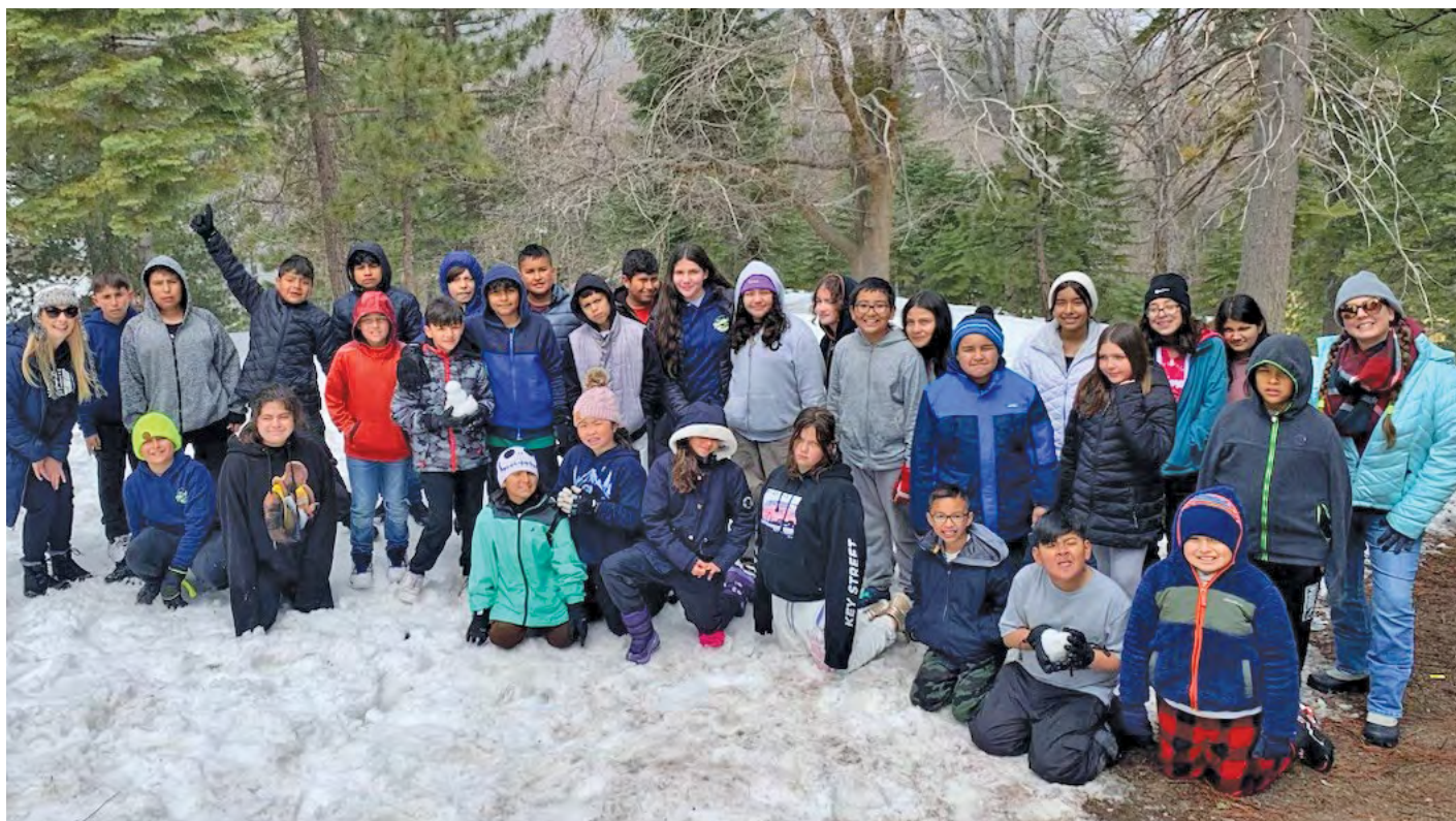
5th graders in the SNOW in April at Pali Institute.