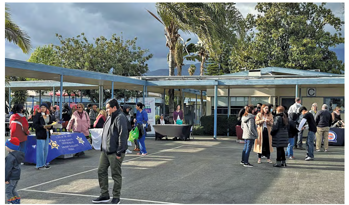
Open House community event.