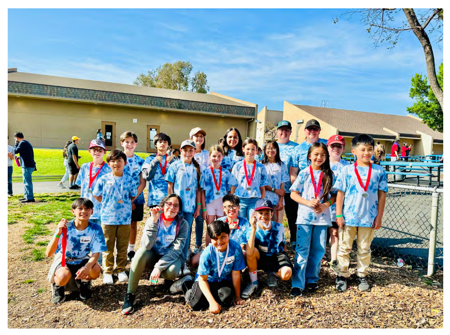
Science Olympiad Team

The celebrations will continue through May as we strive to end the year strong with happiness and gratitude in our hearts. Our upper grade students will be showcasing their talents in a strings performance and kindergarten will be putting on an end of year performance for parents. We are getting ready to host our annual volunteer tea to honor all of the hard work and dedication Dysinger's parent volunteers have shown us this year. To close the year, our sixth-grade students will be engaged in several fun and active events culminating in their promotion to junior high school. We are very proud of the hard work and commitment of both our students and staff this year.