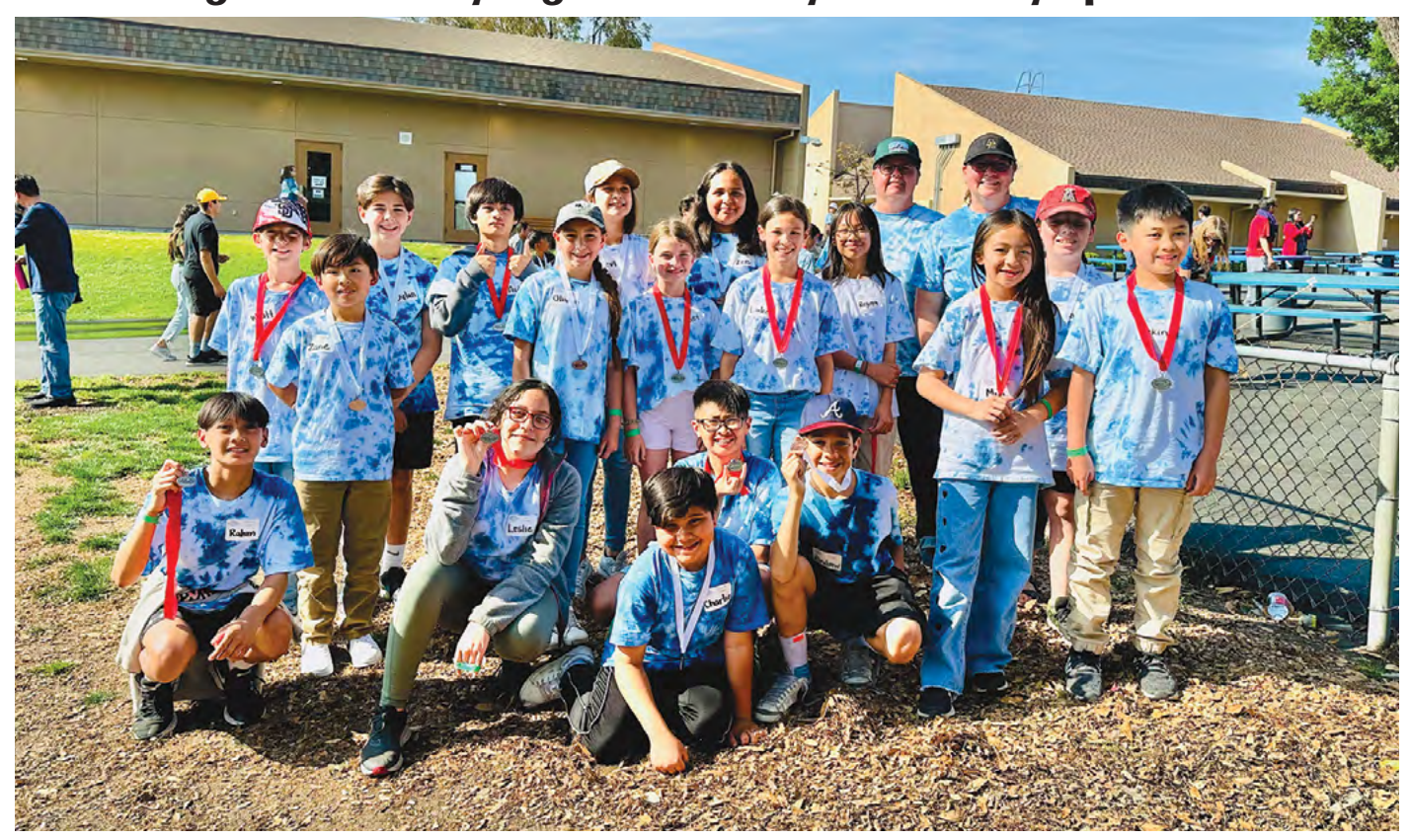
(please see page 10)