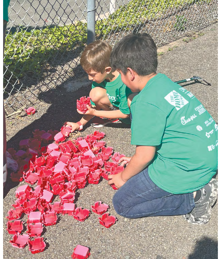
We love our Volunteers!

Not all Country Hills Cougars contributed at their own school. Several Cougars and their families were dispersed to other Brea Olinda Unified School District schools, which speaks to the fact that the spirit of public service and volunteerism is alive and well at our school, our sister schools, the district level and the city. Thank you again to everyone who participated!