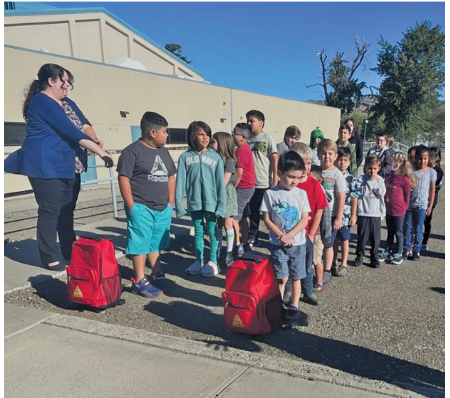
TILA students practice a fire drill.

An important part of school safety is preparing for an emergency. Emergency drills such as fire, earthquake, and lockdown drills are also practiced on a monthly basis for TK-8th grade students and quarterly for high school students. TUSD sites also have a fully stocked bin that contains items to help school staff respond to an emergency. In the event that students need to remain on campus for an extended period of time, supplies including; water, cots, blankets, and first aid kits are also stored in the emergency bins. Safety is a priority at TUSD!