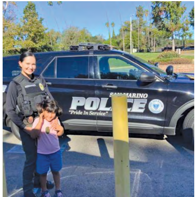
San Marino Police Department with kindergarten students at Valentine Elementary

and community, our district office, and local city first responders. Together we innovate and adjust to ensure we continue to provide a safe learning environment where students learn beyond their potential and thrive. Valentine Elementary also understands the importance of social-emotional well-being in our students, teachers, and staff members. Our work and focus on social-emotional learning through our school counselor and Second Step curriculum also contribute to our safe school environment as students learn to communicate better, solve problems, and deepen their emotional regulation abilities. Thank you to our Valentine Viking community and educational partners for their continued support and partnership in ensuring our safety priorities.