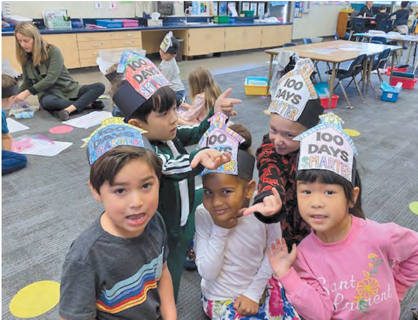
100 days smarter

We wrapped up our February with Read Across America week and the beginning of our One School, One Book community program. Our campus is buzzing with the excitement of reading!