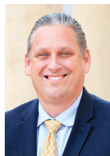
Tony Strickland Mayor

714/536-5553 • www.huntingtonbeachca.gov