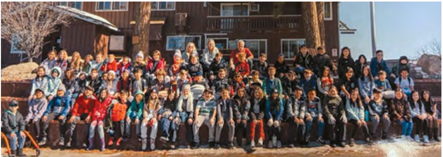
5th graders at Outdoor Science Camp