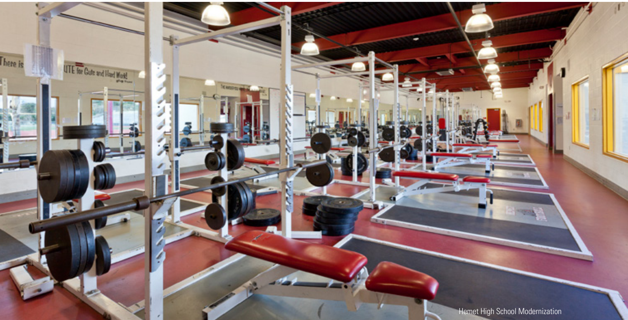
Hemet High School Modernization