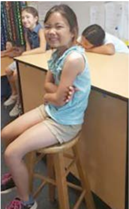
Third grade students learning PBIS.

Smiles are abundant at Morse Elementary School! Our Morse students and staff members are off to a very positive beginning of the school year. During their first week of school our students participated in Positive Behavior Interventions and Support rotations (PBIS), where they learned about what to do to be successful. Their focus was on the positive aspects of how to behave at school, as opposed to what not to do. Collaboratively, our teachers have developed new ways to motivate their students. Positive Attitudes Worth Sharing (PAWS) encourages students to have fun at school. Each day they can earn a "paw" for their desk by showing a positive attitude. They can also earn Cat Cards for demonstrating our school-wide expectations. The Cat Cards can be collected and redeemed at our Wildcat Warehouse for gift cards, pencils, and other items. Positive attitudes can be seen all around Morse Elementary!