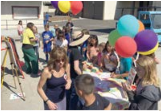
Students enjoy lunchtime art to build interest in PTA's Reflections contest.

Since the opening of the school year, the PTA has worked tirelessly to make Fairmont an excellent place to learn. We are blessed to have such a wonderful group of parents working with teachers and staff to make sure everyone comes together in excellence.