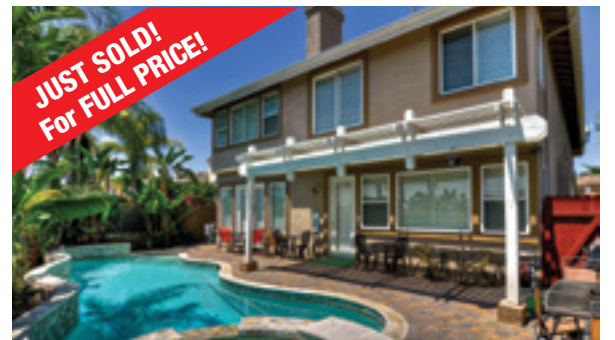
2676 Belinda Court, Fullerton