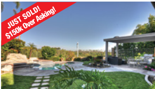
2664 Belinda Court, Fullerton