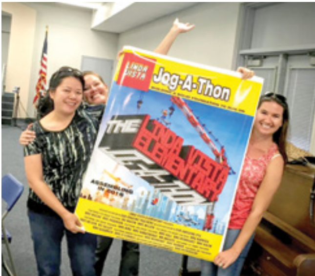
Parent volunteers enthusiastically reveal the new Jog-a-thon posters at our first PTA meeting of the year.

Having these resources in place has set the foundation for an exceptional 2016-2017 school year. The PTA has also planned all kinds of enriching experiences that promise to further connect our students, staff, and families to this wonderful school. This year in particular we are excited about our Jog-a-thon, carnival, school play, book