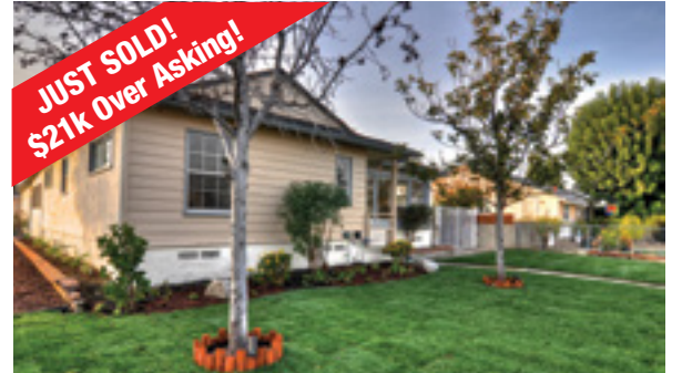
1119 S. Pine Drive, Fullerton