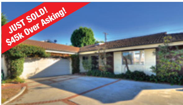
1000 Boxwood Ave., Fullerton