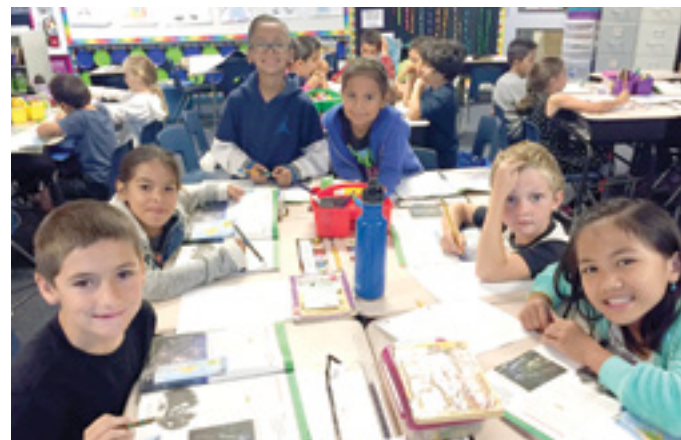
Third grade students use two column notes to better understand social science text.

A parent AVID rally was held in October and was well attended. Parents learned all about how AVID supports their children in becoming 21st century career- and college-ready individuals!