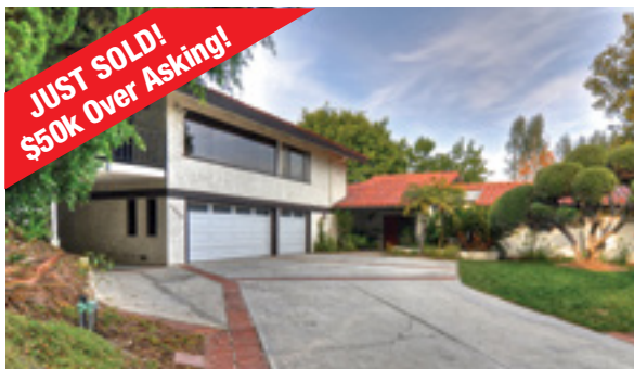
1724 Rocky Road, Fullerton