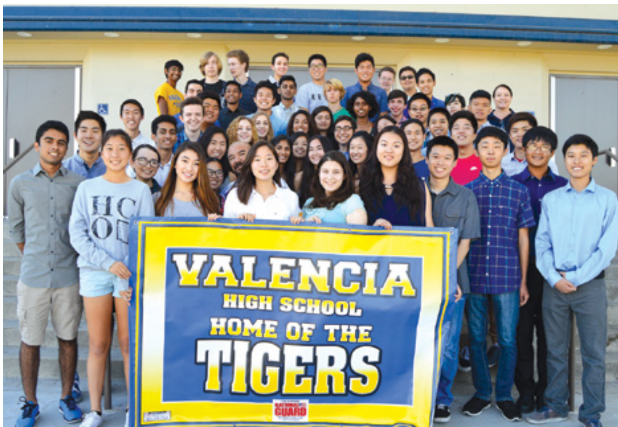
National Merit Scholars

Valencia HS is proud, focused, and ready to continue our record of success!