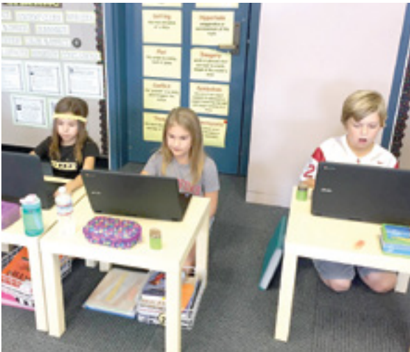
The 4th grade students in Ms. McClain's class enjoy working at small table top desks while sitting comfortably on the floor. This is just one option of many students have.

may include standing desks, round tables for collaboration, or small tabletop desks, which allow students to sit on the floor instead of at the traditional student desks. It is a well-accepted fact that children need to have movement throughout the day. In fact, the California Department of Education concludes that Flexible Learning Environments give student the opportunity for movement while better meeting their diverse learning needs.