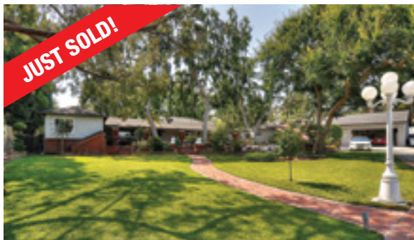
1910 Sandalwood Ave., Fullerton