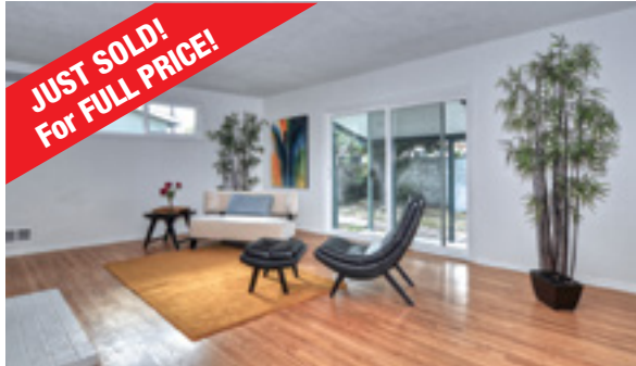
1524 W. Elm Ave., Fullerton