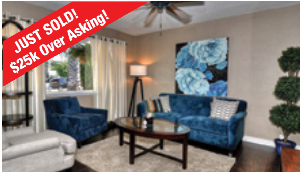
321 E.Valencia Drive, Fullerton