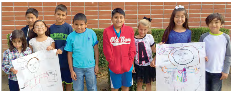
3rd grade students share their Successful Student drawings.

In October, Morse teachers spent a full day analyzing student data, determining students' areas of strength, and determining best practices for reaching identified goals. Our Morse Wildcats are very lucky to be in the care of such outstanding and dedicated educators who give of their time to ensure that their students get the best instruction every day! Thank you, Morse Teachers!