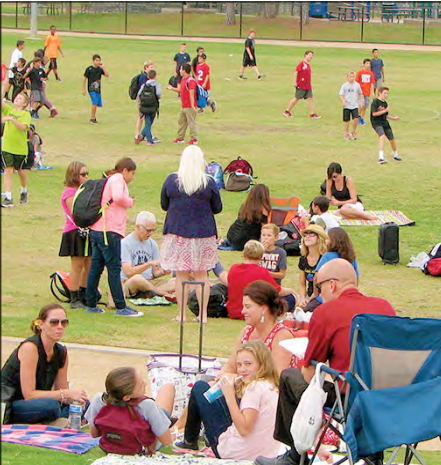
Food and fun at the Bobcat Family Picnic.

Friday, October 16, was an eventful day at Yorba Linda Middle School. At lunchtime, we held our Bobcat Family Picnic. Parents were invited to come to school to share a picnic lunch with their students. And come, they did. This was a very well-attended and well-enjoyed event. Then, at the end of the school day, we enjoyed an all school “M3 Rock n Talk” assembly which featured a professional rock band with a message. There was student participation as the band invited several students to sing and dance with them. They also intertwined motivational messages about overcoming challenges and encouraging students to be kind to one another. It was very entertaining and inspirational. Between the picnic and the assembly, it was a great day to be a Bobcat!