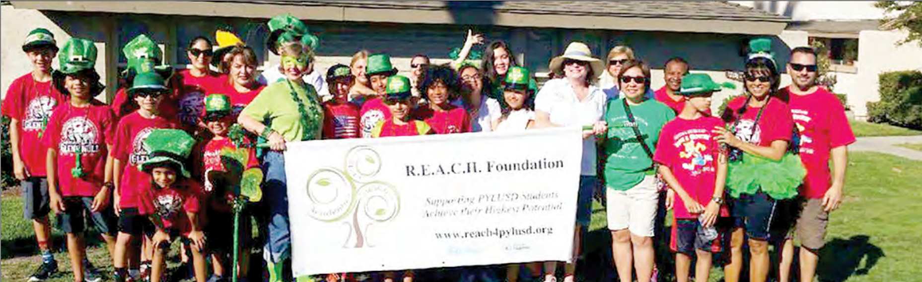
Glenknoll Elementary School shows their school pride at the 2015 Heritage Parade.

Your tax-deductible end-of-year charitable contributions and company-matching opportunities can go a long way to help our enrichment goals. Please explore our website—click on “Ways to Donate”—and Facebook page to learn more about us and our efforts to bring greater enrichment offerings to our students.