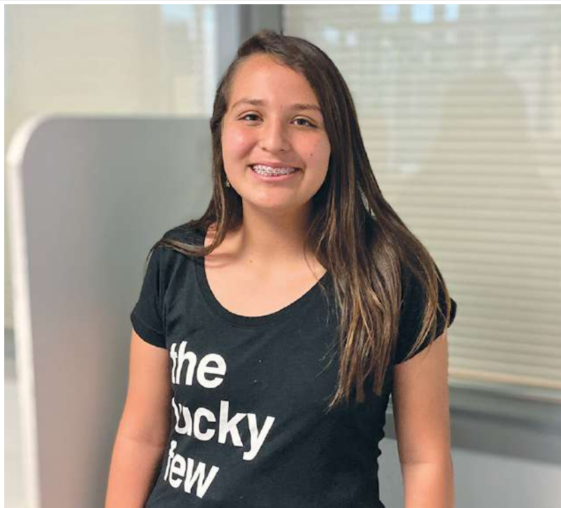
BeYorba students work for all to belong.

very own students organized a school-wide homeroom lesson on the joys of inclusion with highlights of Down Syndrome Awareness. Our Girls Gear Up launched a campaign called “Make Someone’s Day” where all students could write notes of encouragement outside of our science and art classrooms. The week before Spring Break was packed with an Anti-Bullying assembly where students shared their thoughts on how to make BeYorba a kinder place. We hosted a schoolwide pancake breakfast and ended our week with a career speaker day. Our students put belonging into action through these activities at BeYorba.