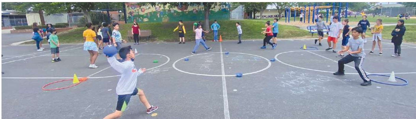
Students playing Castle Ball.

they encourage students to play fairly, resolve conflicts, and use positive language. "Good game, nice try" can be heard all over campus during recess, and staff members are passing out Gold Cards for positive behaviors aligned with PBIS. With the introduction of our new recess games, student behaviors have decreased, and students who may not have played during recess before, can now be seen running to the playground. Overall, the students love the new games!. Recess at Golden is a safe and fun experience for all!