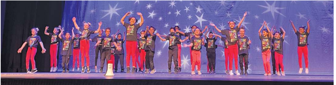
Second grade rocks when they perform the Cupid Shuffle!