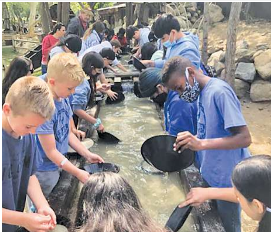
4th-grade students panning for gold on a field trip to Irvine Regional Park.

and we have celebrated our students' achievements at awards assemblies each trimester. For enrichment, all of our students have enjoyed going on field trips to exciting places such as the California Science Center, the Long Beach Aquarium, and even Centennial Farm. We are planning for a fun end of the school year and students and staff are looking forward to upcoming events such as schoolwide PBIS parties, 6th-grade promotion, and other fun assemblies. Go Bulldogs!