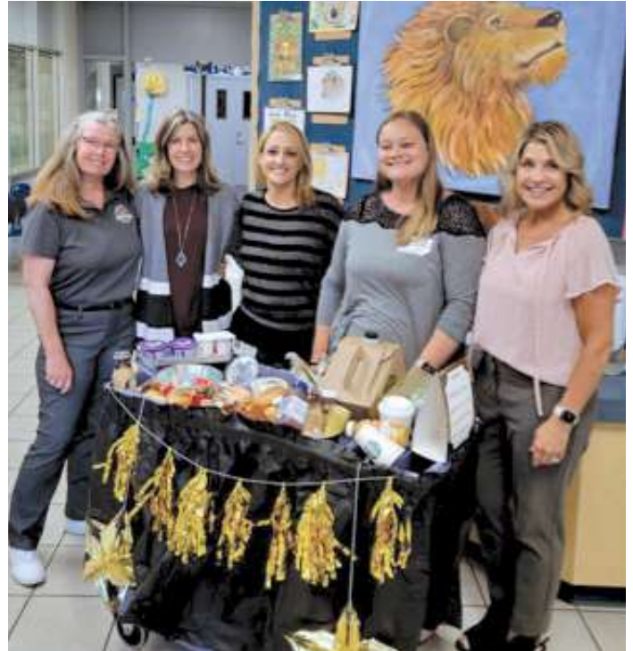
Our PTA stopping by the front office to deliver a VIP breakfast.

We are thankful to our PTA and school community who "rolled out the red carpet" for us this year during Teacher Appreciation Week. The celebrity treatment included delicious food and special notes from students. These gestures and tokens of appreciation mean so much to our dedicated staff, as they, too, deserve to feel "Noticed, Need and Nurtured."