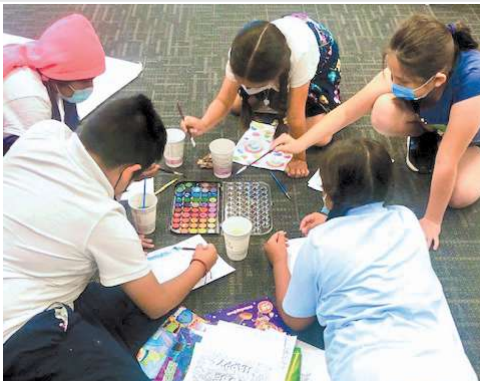
Students unwind at lunch in the Wellness Room at Melrose Elementary.