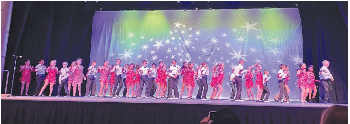
Our 5th graders danced into the end of their elementary career to Conga by Gloria Estefan & Miami Sound Machine.