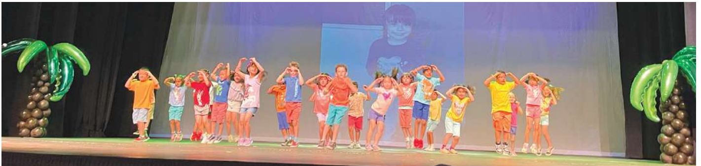
Our 1st graders were animals on the dance floor, showcasing their skills to Dance Monkey.