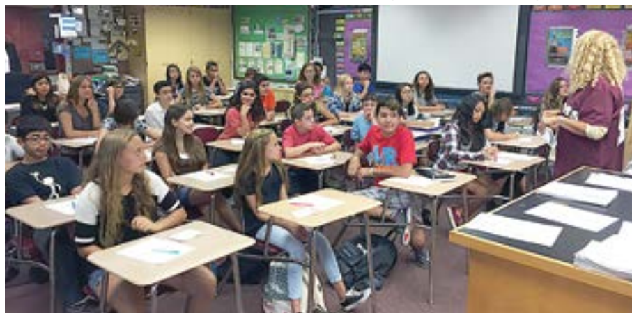
Bernardo Yorba journalism students working in the Matador Messenger room.