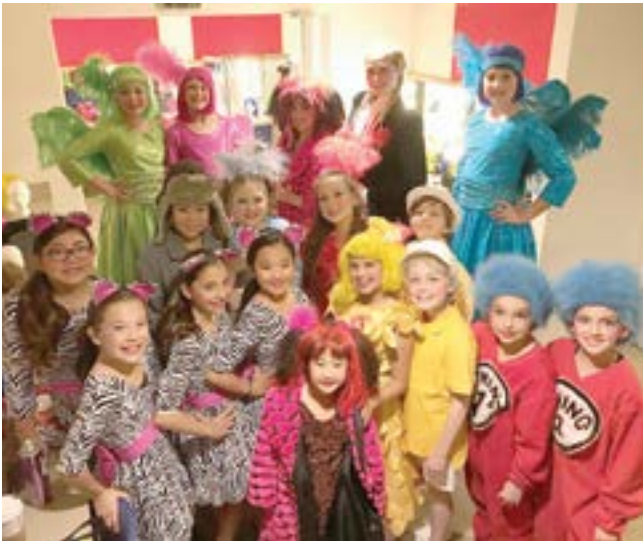
Golden Elementary students develop multi-grade friendships performing Seussical Jr.

For Golden Elementary School students, that classroom was the school play, Seussical Jr. Over 200 students ranging in ages from kindergarten to sixth grade journeyed together through the land of Seuss, navigating rehearsals among the homework assignments, baseball games and piano practices. In March, magic happened while these newfound friends worked in synergy to present an amazing performance.