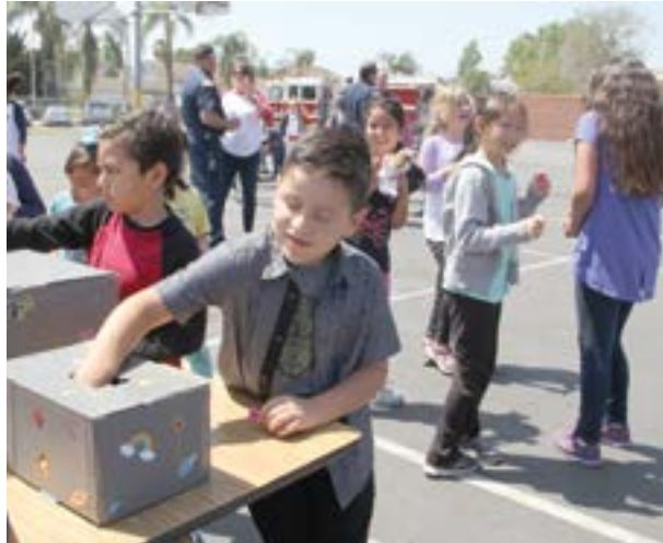
Students, PD & firefighters are enjoying the games at the student-led Carnival.

Morse students held their second annual Team Kids Challenge this spring. Partnering again with the nonprofit Team Kids Inc., Orange County Fire Authority and the Placentia Police Department, 40 students met weekly for five weeks to plan and prepare three philanthropic challenges. They also created and organized a culminating carnival held for students to participate during their lunch playtime. The Placentia Police Department and OC Fire Department joined in the fun by participating in skits during the kickoff assembly. The skits illustrated the importance of teamwork. At the carnival, they played games and even had their nails painted!