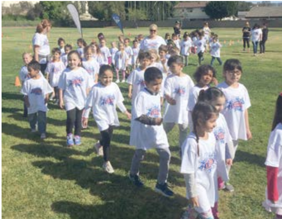
Woodsboro Students enjoy their annual PTA Fun run.

Project. Throughout the year, they have been recycling bottles and cans, using that money and their own donations to purchase supplies to make personal care kits for homeless families. The kits will be distributed through the Orange County Department of Social Services.