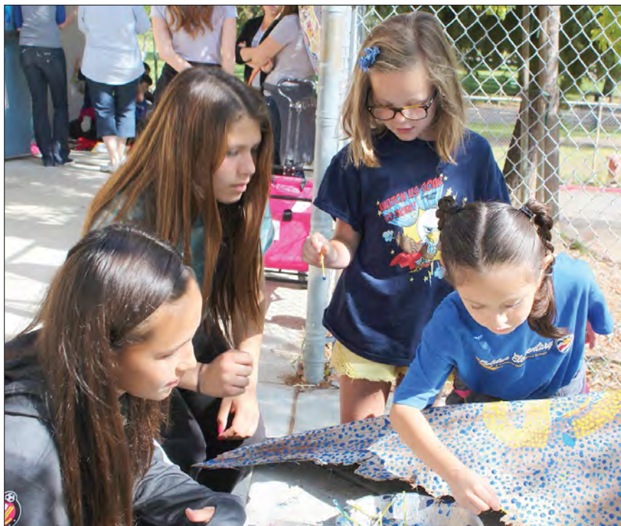
Students from Tuffree Middle and Golden Elementary collaborate and bond as they complete the "Painting Across Boundaries" project for the PYLUSD Performing Arts Center.