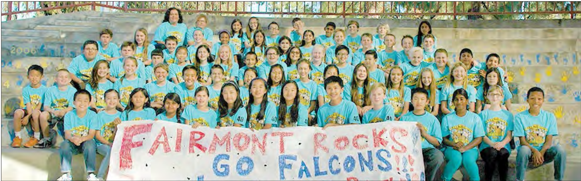
Our Battle of the Books participants!

Finally, our student council wrapped up a canned food drive for our district food pantry. They collected over 50 boxes of donations from our students to help support Placentia-Yorba Linda Unified School District families in need! Way to go, Falcons! You are fabulous!