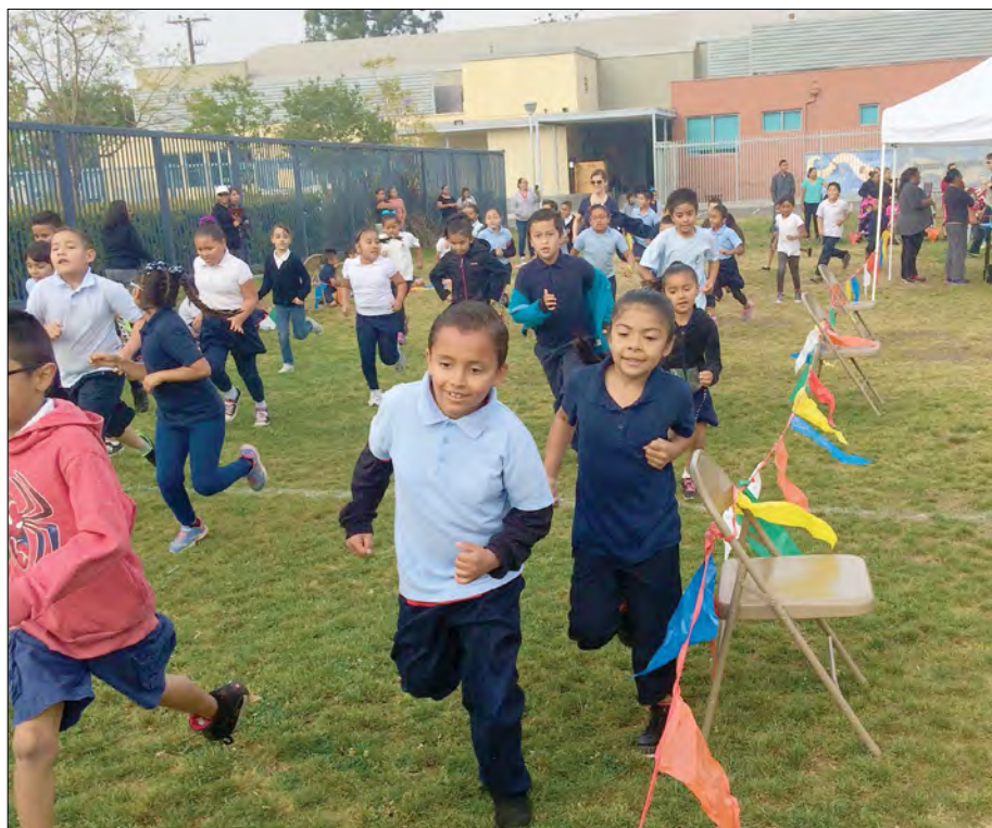
Second graders jogging alongside their teachers.

We are fortunate to be part of such a collaborative school community. Our students are not only supported by their parents through their participation in PTA, School Site Council, and English Learner Advisory Council but also through their participation in adult education. Leading by example, our school community has rallied to participate in parent workshops, which incorporate research-based strategies and support student achievement and healthy development.