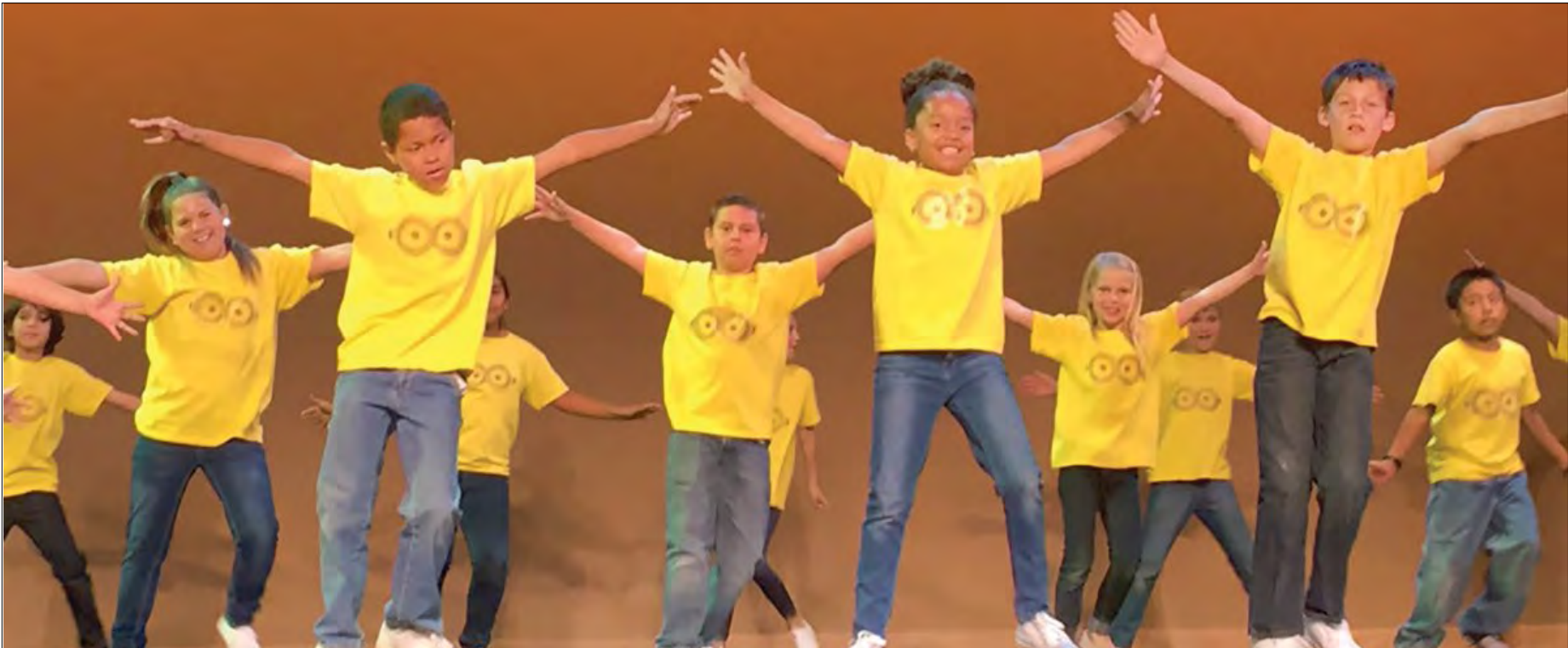
Third grade performance at Talent Show.

It’s been a great year, and we are proud of all that our Morse Wildcats have accomplished!