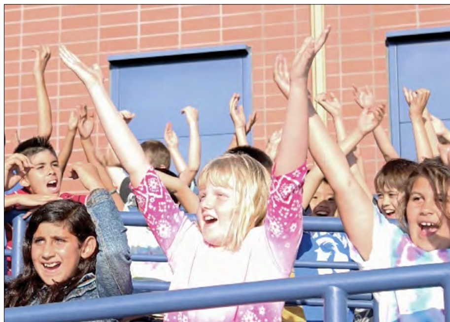
Fourth grade singing.

Popular music was also well represented, as each grade level entertained us with a song from a past decade. We sang along to ABC (the fifth- and sixth-graders); YMCA (the fourth grade); Celebration (third grade); Fresh Prince of Bel Air (second grade); High School Musical (first grade); and Happy (Pre-K and K).