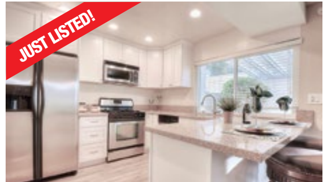
733 Jaywood Court, Brea