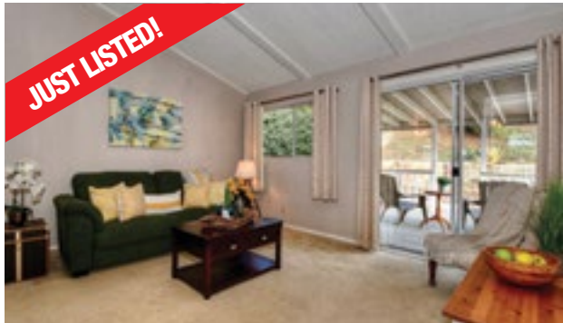
1040 La Casa Avenue, La Habra