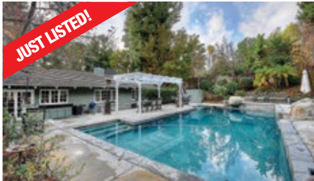
140 Buckthorn Drive, Brea