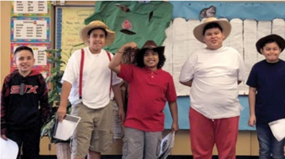
Fifth grade Tom Sawyer play.

Our students have been hard at work the past few months collaborating inside and outside the classrooms. As we actively implement the new Benchmark Advance English Language Arts program, Ruby Drive students have been excited to collaborate together to perform the Reader’s Theater. Reader’s Theater provides a creative way to practice reading comprehension and fluency. This enrichment activity has been very motivating for our scholars! Some of the highlights include the fifth grade students reenacting Tom Sawyer’s white picket fence and third grade students performing several Greek Myths. By working together, they were able to practice their skills and play to each other’s strengths!