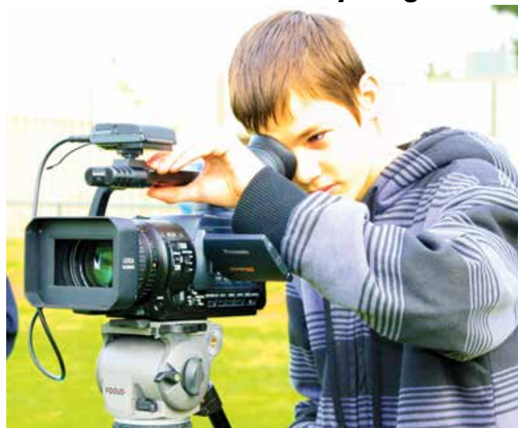
High School Academies provide real world experience.

El Dorado High School will expand its award-winning Digital Media Arts Academy to include a broadcasting pathway. El Dorado's academy already offers film and television production, photography and animation. Students in the highly-sought-after academy produce digital portfolios, a weekly broadcast show, and numerous animation/film projects using the best equipment