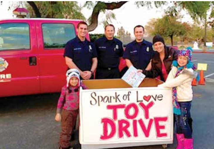
Rose Drive's Spark of Love Toy Drive.

Finally, our Snow Night not only offered an evening of magic but also provided the perfect opportunity for our families to donate a new unwrapped toy for our Spark of Love toy drive. The generosity of our families was clear when we delivered a truck overflowing with toys to a major sports and entertainment venue in December.