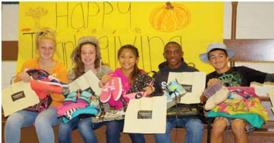
The spirit of service to others is valued at Tuffree as students set up a “mini-clothing store” for personal selections by community families.

The spirit of service is valued in our students’ willingness to find meaning in reaching out to others.