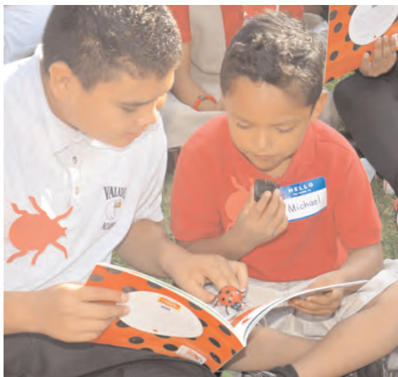
Bug trackers and treats make reading even more fun.