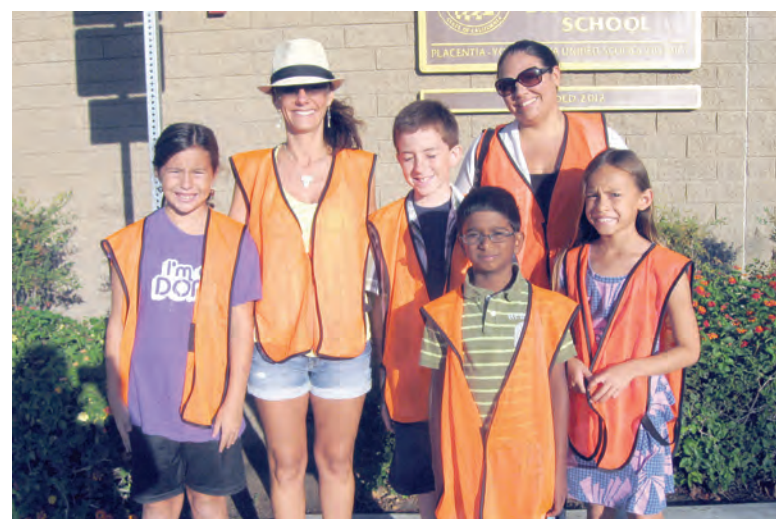
Parent and student volunteers make school safe.

We look forward to next year, when we kick-off the Woodsboro Way: "BEEing" Responsible, Respectful, and Ready!