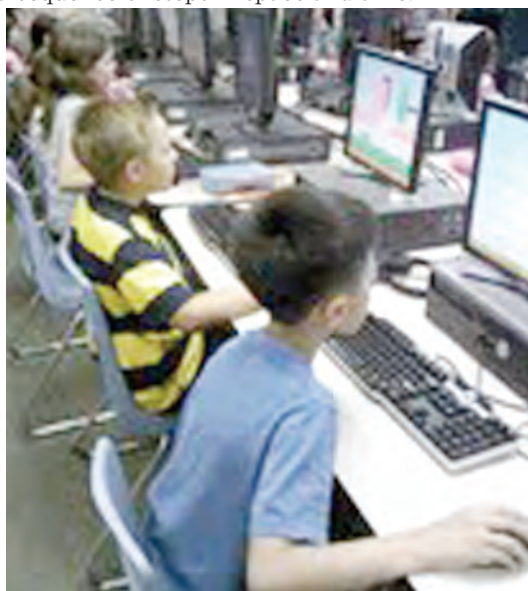
Students can't wait to get to the computer lab to work with JiJi.

This process is critical to solving problems in math, science and other curricular areas. All of our teachers were trained in September, and students were logged in on the first of October. Students and staff were so excited to get started, and they absolutely love JiJi the penguin. Everyone is engaged in solving math problems visually. ST Math promotes mastery-based learning in a unique way and increases mathematical understanding. We are looking forward to great success with JiJi!