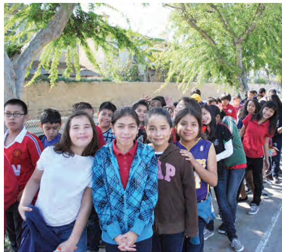
Rio Vista demonstrate positive behavior.

During the first week of school, each grade level held a Leopard Laws assembly, where students received a refresher on behavioral and academic expectations. This is Rio Vista's third year of Positive Behavior Intervention and Support (PBIS), a systems approach for establishing the social culture and individualized behavioral supports needed for schools to be effective learning environments for all students.