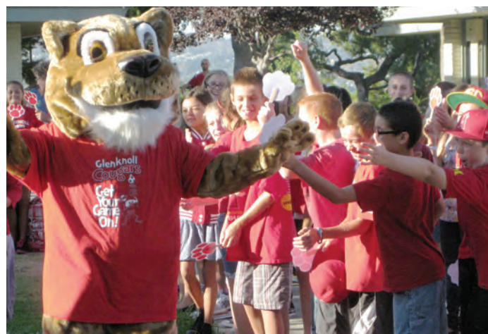
Glen, the Cougar, announces the school theme, "Get Your Game On!"

Our very active PTA is also planning many more sports-themed events during the year, including a "Battle of the Books," a Jog-a-thon, a book fair, and family nights. Our second-annual Fall Festival was also held on October 25.