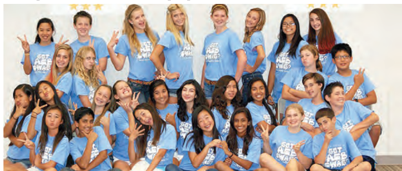
Champions push themselves to achieve MORE!

Champions strive to do their personal best. Champions accomplish their personal goals. Champions stand as role models for others. Champions try until they succeed and never give up. Champions have a winning attitude. Champions take risks...stepping outside their comfort zones. Champions want to meet new people.