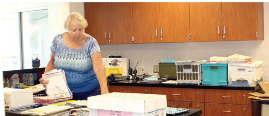
The school office area is more spacious and welcoming for visitors

Modernization is more than carpet replacement and paint. School interiors undergo complete demolition down to the frames and are re-built with new electrical, fire alarms, heating and air conditioning, plumbing, technology infrastructure, drywall and energy-efficient lighting.