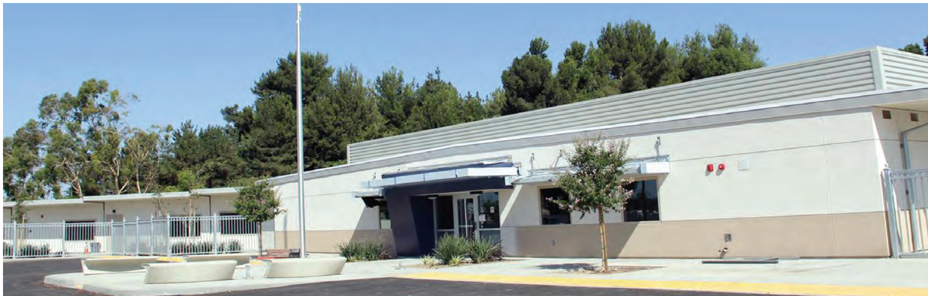
New front entrance to El Camino Real High School.