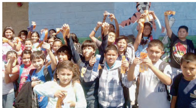
Students earn gold and blue ribbons in recognition of test results.

Now in new classrooms with new teachers, the goal is the same—continue the tradition of excellence!