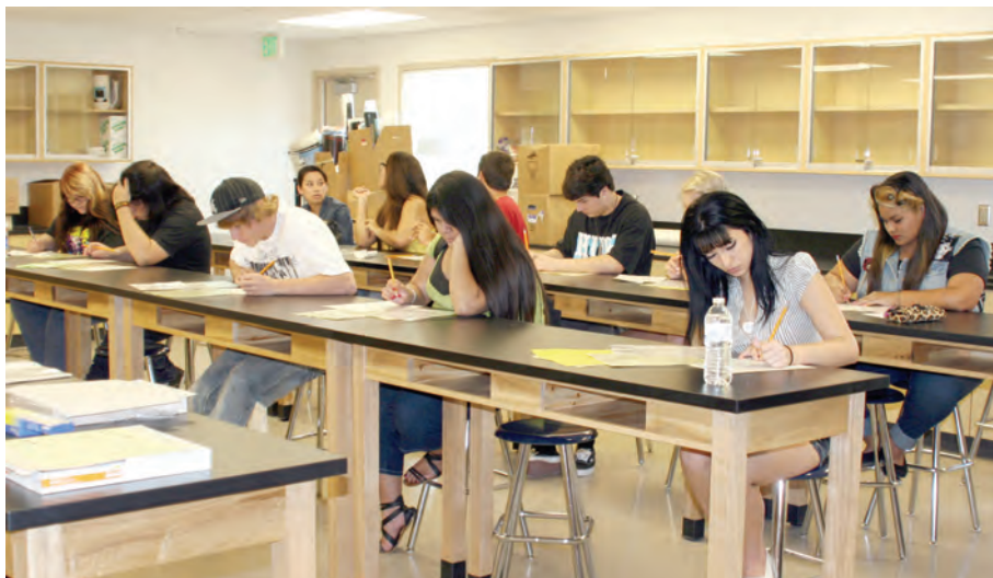
Students enjoy their new science classrooms.