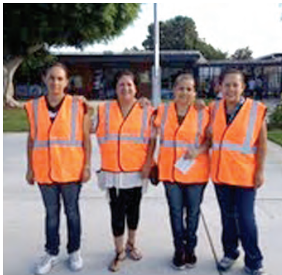
Ruby Parent Greeters

Our first month of school went smoothly. This year, we are incorporating a school-wide behavior support system called Positive Behavioral Interventions and Supports (PBIS), which will supplement our current school procedures. This framework will allow us to enhance our learning environment, make higher academic achievements, continue a positive school culture, and