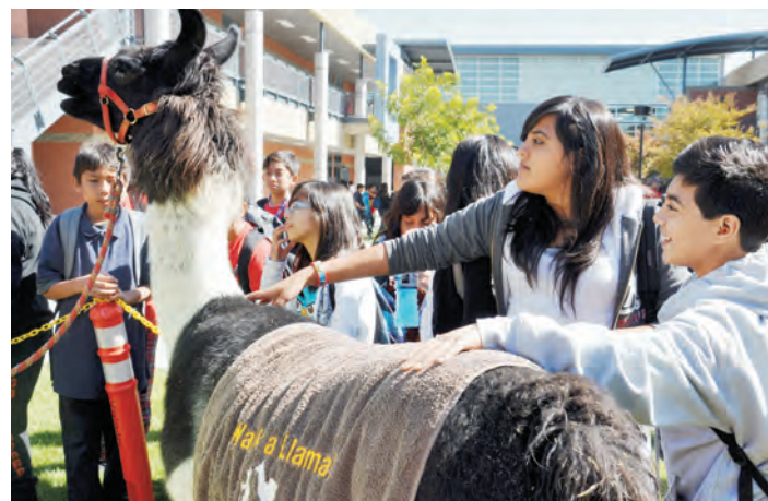
Up close with a new friend

All Valadez students demonstrated their love of llamas, and their commitment to help others, by raising funds to purchase real llamas for donation to families in