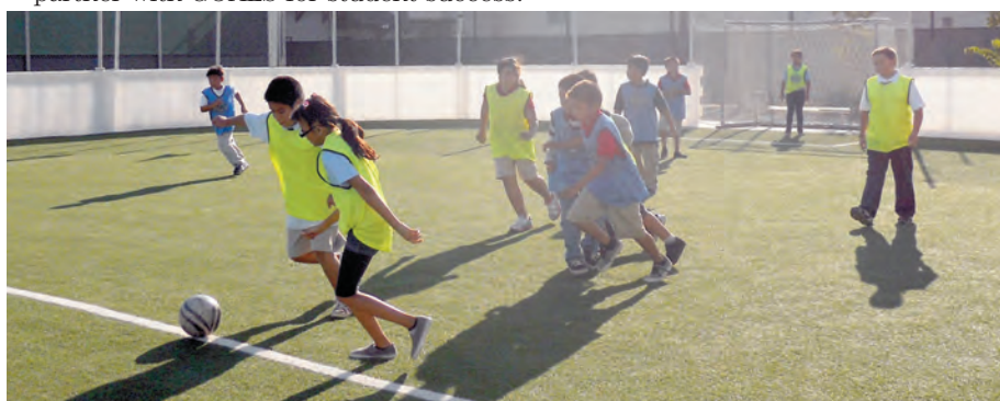
Rio Vista students learn soccer fundamentals.

Students also learn the value of community service by participating in community clean ups, anti-graffiti programs and leadership training. Rio Vista is proud to partner with GOALS for student success.