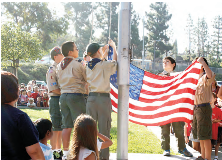
Fairmont, staff, students and parents remember our heroes of 9-11.

We are looking forward to another successful year at Fairmont as we celebrate our 40th birthday. Go Falcons!