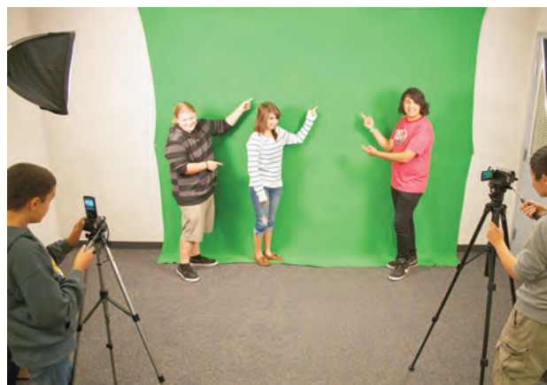
Broadcast Journalism Tuffree students practice principles of storytelling, technology application and media technique

solving in real-world situations such as why the ocean doesn't freeze or how airplanes fly. Students feel as if they were in an episode of Discovery Channel's MythBusters as they test applications of energy, laws of motion and states of matter. Active engagement leads to fun and strengthened skills for science STAR testing in eighth grade.