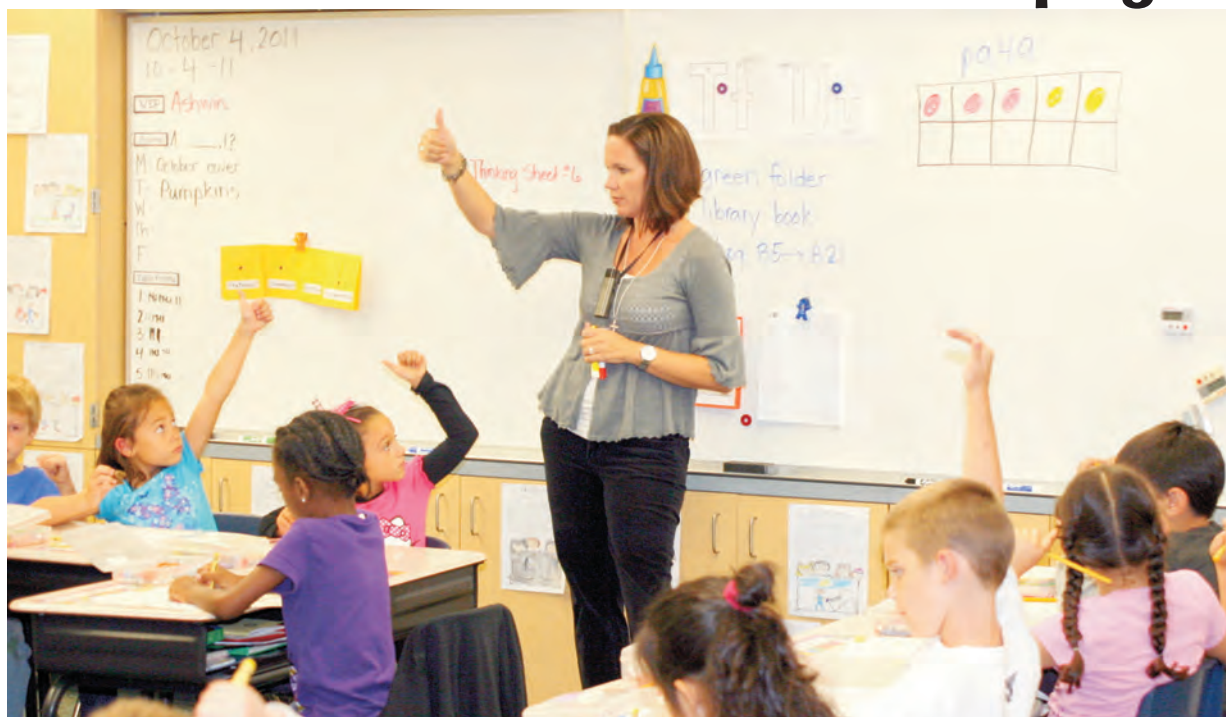
Students miss on important instruction when they are absent from school.