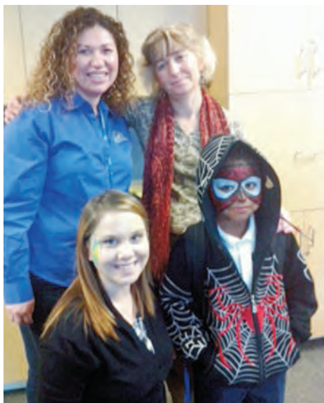
Face Painters with Spiderman

Students attended these special Saturday sessions from 8:30 a.m. to noon. Those who were chosen to participate had received a special invitation earlier. Many students wanted to be a part of this experience, and so we had a waiting list. The invited students also received special incentives such as restaurant certificates, no-homework passes and even face painting!