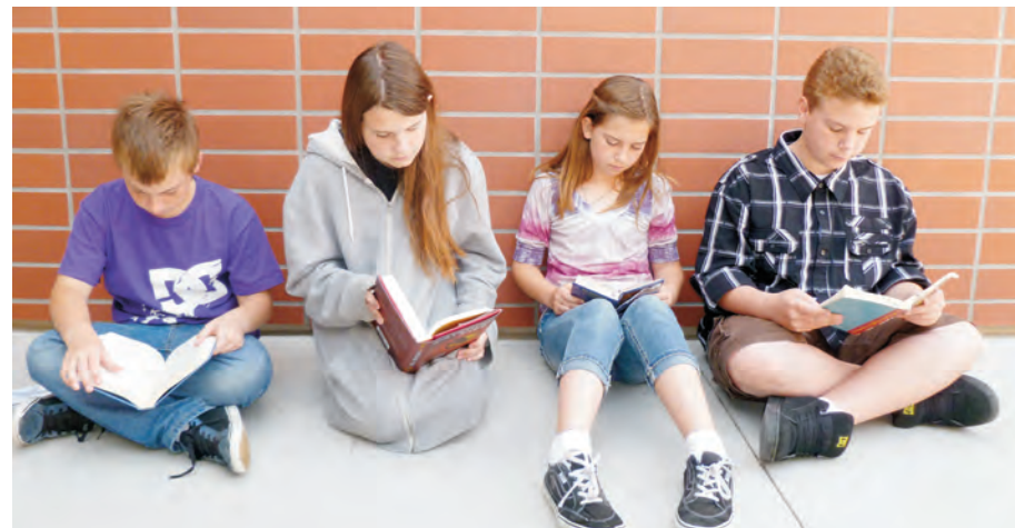
Van Buren students Rocket Into Reading!

Each grade level that reaches its goal will participate in a culminating event on May 25. So far, the fifth-grade class is leading the way, but sixth grade is starting to close the gap! Rocket into Reading, Roadrunners!