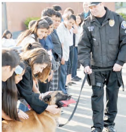
Work can be fun!