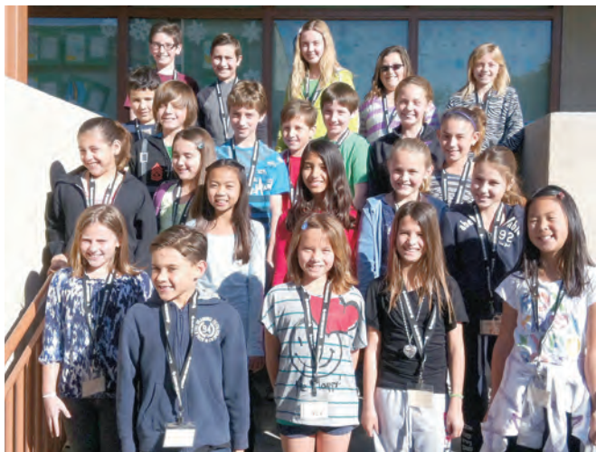
Our Peer Mentors give us Lion Pride!

For the mentors, this opportunity will enhance their skills as leaders and build their confidence and self esteem. Our mentors completed applications, went through an interview process, and demonstrated their caring attitudes and ability to follow through with their commitments responsibly. Teachers and the principal supervise and support the mentors.