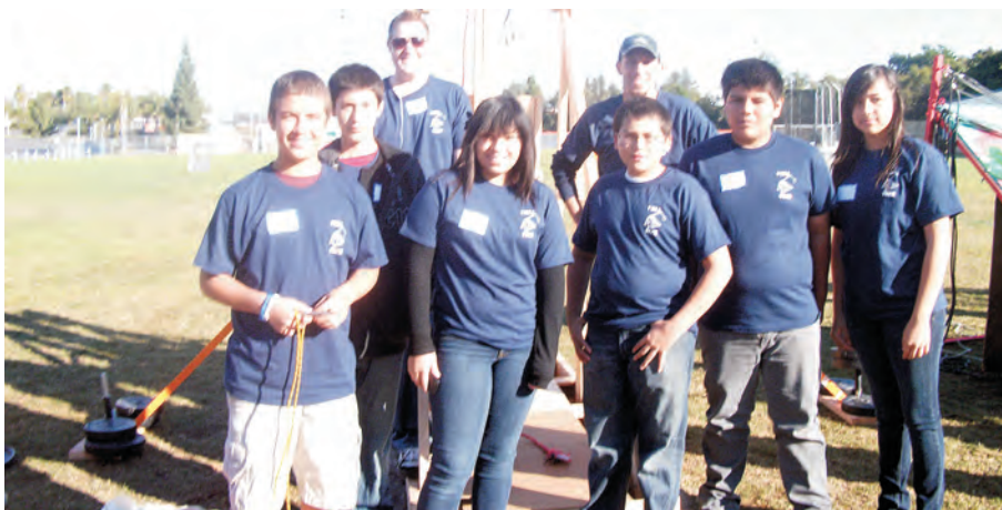
Valadez “Angry Eagles” Pumpkin Launching Team.

We are very proud of our Valadez Eagles “Soaring to Success”! Valadez students are looking forward to the District Vocal Festival March 6 and our annual Career Day March 14.