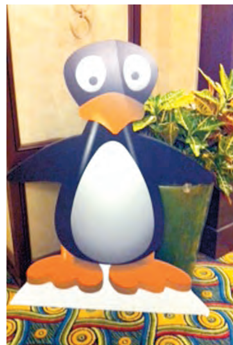
Jiji, the Penguin

Since much of the software uses a visual approach to teach math concepts, the language barrier to learning math is reduced. Our goal last year was to complete 80 percent of the program before starting our state testing, since the coursework aligns to our state standards. We met and exceeded our goal! As a result of this effort, we also met and exceeded the state's math goal. Students can proudly tell you how much of the program they have completed to date, and we hope to meet and exceed the goal again this year!