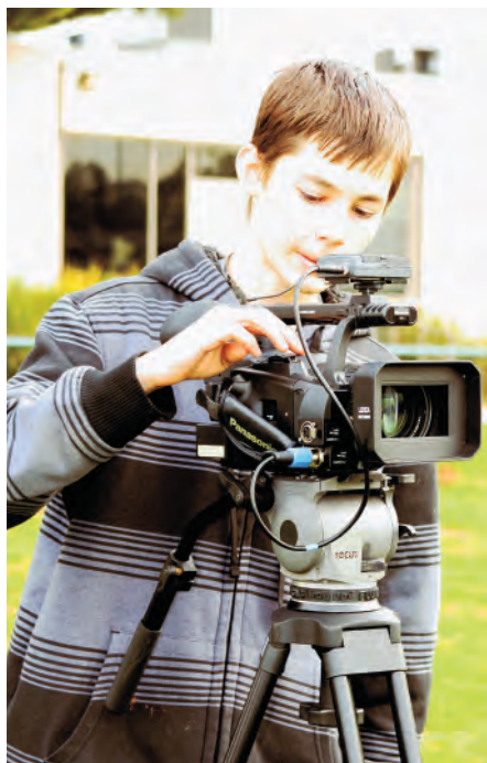
El Dorado High School's Digital Media Arts Academy students learn to use the same equipment used by the television industry.