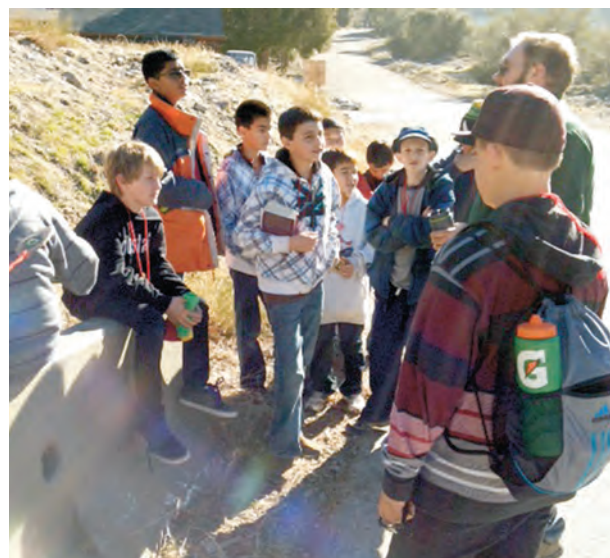
Students on an Outdoor Science School Hike

Spring activities at Glenknoll will include grade-level field trips like the First Flight Program with the Anaheim Ducks.