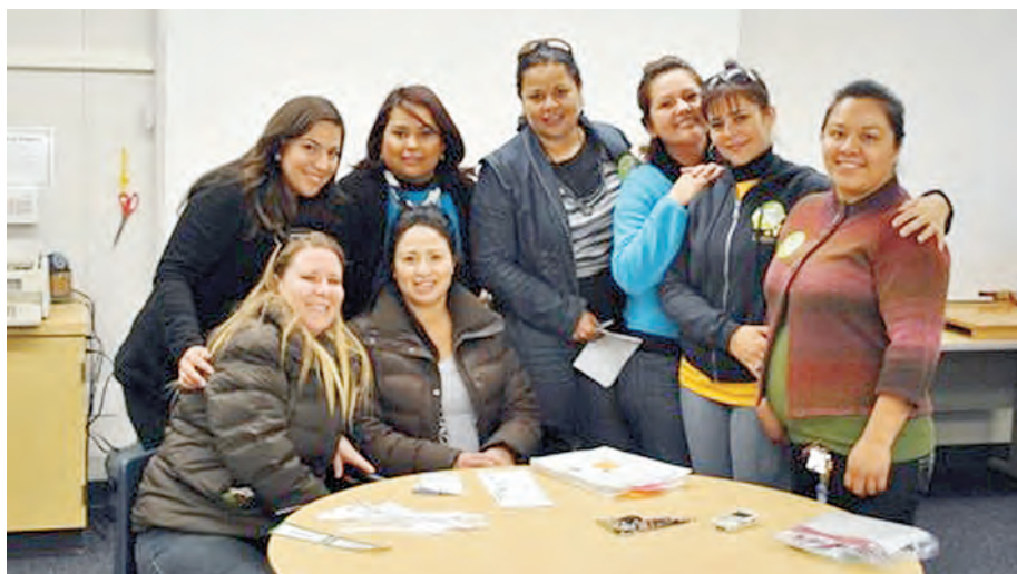
Rio Vista Volunteers Enjoy Their Work!

If you are interested in volunteering at Rio Vista, please contact Principal Howland.