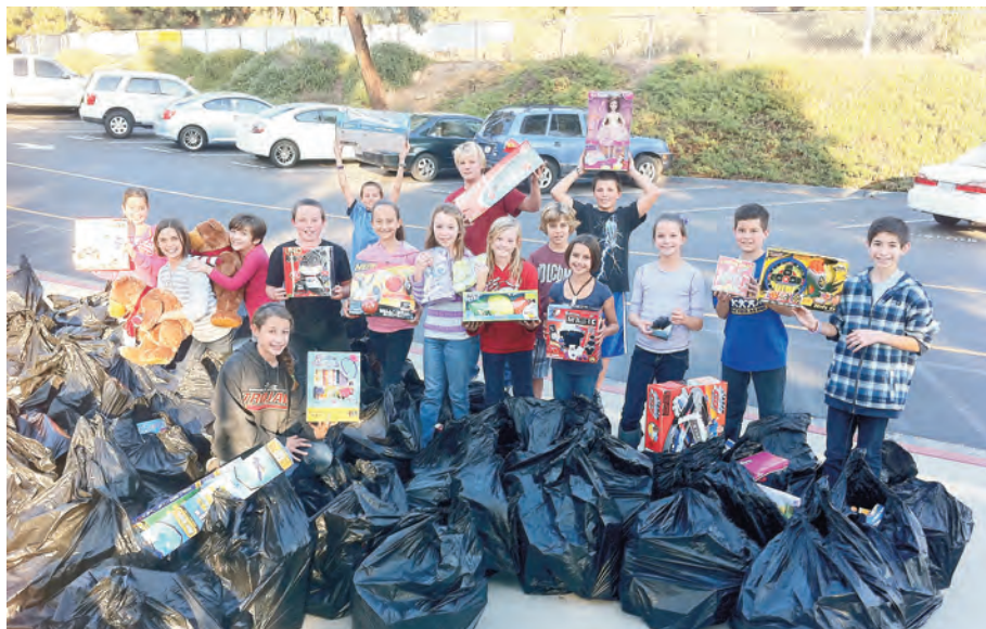
Way to go student council, staff, students and community on another successful Toy Drive!

We are so proud of the Fairmont staff and students. Congratulations! And keep up the great work.