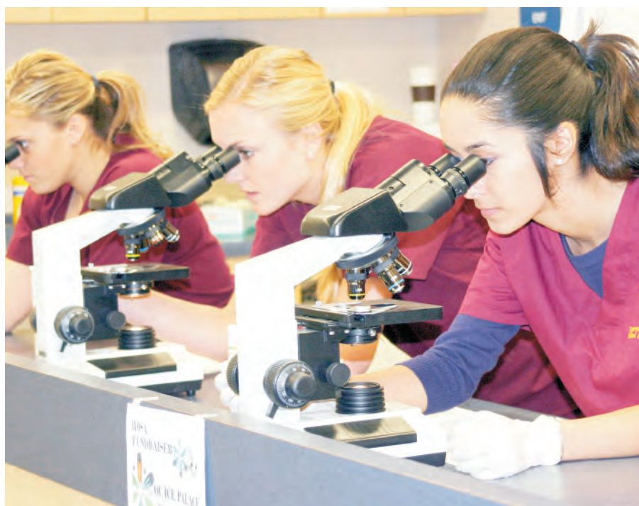
Medical Sciences is one of the many academies offered through the Placentia-Yorba Linda Unified School District.