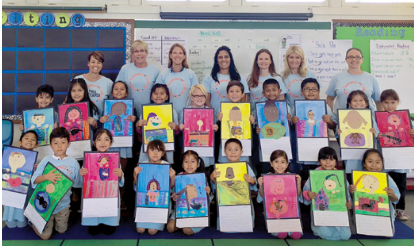
Palmyra Elementary – Summer College For Kids Program

Measure S calls for taxpayer protections and assurances that the funds raised would go directly toward modernizing the campuses as the voters intend. In order to accomplish this, the Board placed clear language in the resolution requiring that 25% of the funds received be spent at each of the four