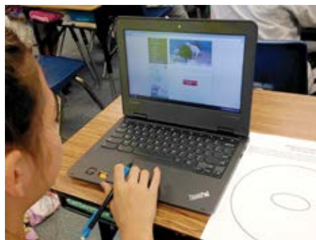
5th grade student Grace working with a Chromebook.

Students are accessing an infinite number of online texts and interactive tools, as well as dynamic Web-based applications, such as Google Docs and Google Earth. Recently our fifth-graders read a story about guide dogs and then accessed Web-based resources, including the textbook Web site, to research and prepare their assignment.