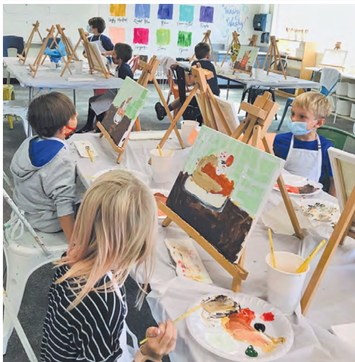
Marlins at work creating a masterpiece.

This month we painted a delicious pumpkin pie, which will be a conversation piece at any Thanksgiving Dinner table. We are beyond grateful for our students to have this unique experience and nurture their artistic capabilities with every stroke.