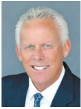
Brad Avery Mayor