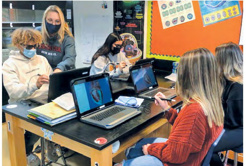
Anatomy & Physiology students using Zspace to learn about the structures of the heart.

Estancia's anatomy and physiology teacher completed 15 hours of training over the summer to be able to offer her students this learning experience. Instructors will also integrate zSpace into student learning in Estancia Medical Academy courses.