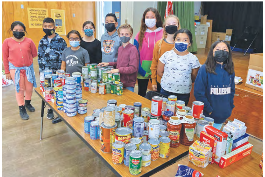
Student Council pauses to pose as they organize food for local families.

a food drive to benefit local families. They collected, organized, and boxed all donated goods which amounted to over 300 items collected. The impact was spread over ten local families. Keep up the amazing work!