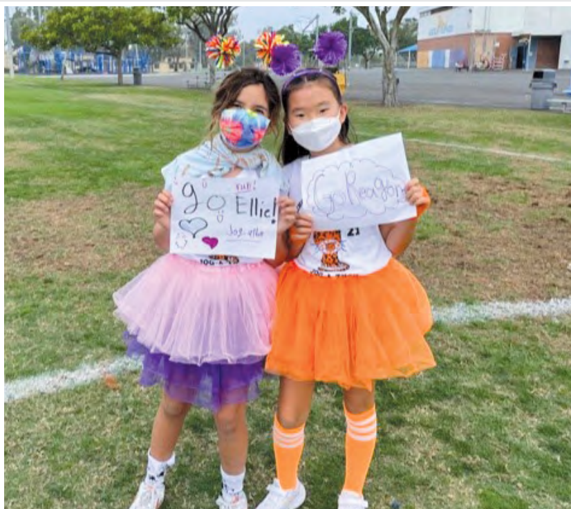
4th grade students showing their school spirit and cheering on their 1st grade buddies.

were able to create a viewing area off campus so our families could participate from a distance. Parents and families brought signs, pompoms, and a whole lot of enthusiasm to cheer for and encourage their students. To increase the joy along the Jog-a-Thon tracks, our grade level study buddies came out to cheer on their buddies with signs and words of encouragement. Some of our 6th graders even started running with their kindergarten buddies to help them stay motivated during the event. We are so grateful for opportunities to bring traditions like this back to Lincoln.