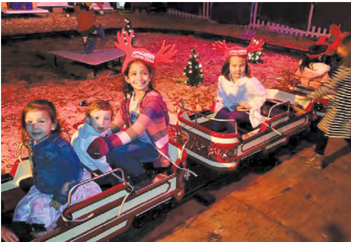
Having fun on the Snoopy House train.

So first the first time in two years, Snoopy House is back and better than ever. We will have train rides, letters to and photos with Santa, an apple cider and hot chocolate booth, snow for sledding, carols and stage performers.