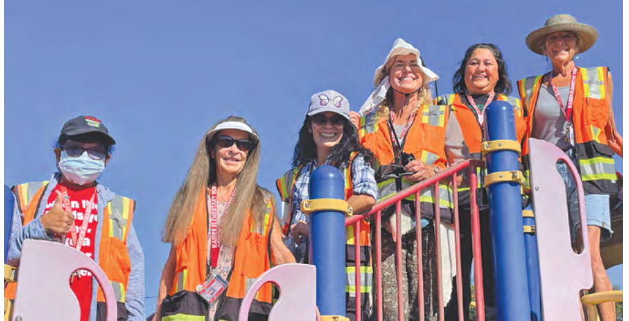
Kaiser's Student Supervision Assistants are ready for action!

Kaiser's Student Supervision Assistants are so deserving of accolades. They remind us all of the importance of what goes on behind the scenes to maintain a school that feels good for its students. Thank you, SSAs. You are true heroes!