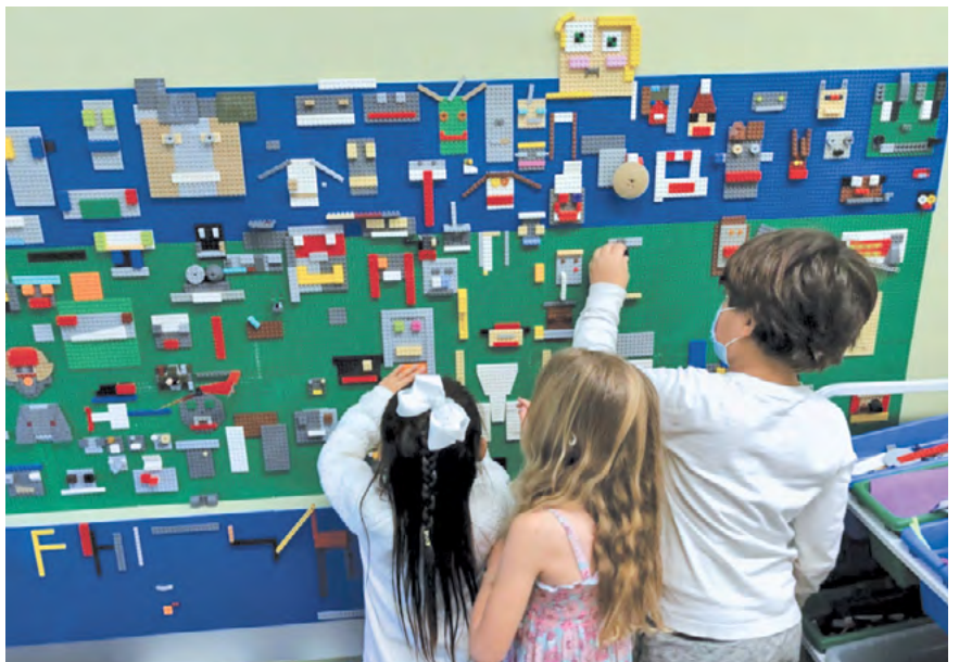
Kindergarten innovators at Harbor View.

record and edit videos using a green screen and create strings of code to program movements in robots. Through a cooperative space, students develop their own ingenuity and their ability to collaborate with peers.