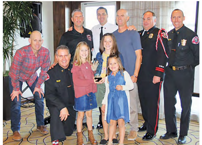
Happy Holidays and the brightest year ahead!

P.O. Box 1200, Costa Mesa, CA 92628 • 714/754-5106