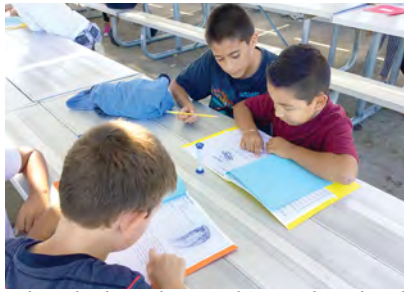
5th and 6th graders working with 2nd and 3rd graders during Cross-Age Tutoring.

Exciting things are happening at Adams Elementary School. Fifth and sixth graders, trained as “Reading Specialists”, have been paired up with second and third graders for weekly reading fluency practice. Students read from a range of passages based on their individual needs and are timed by their upper-grade peers using hourglass sand timers. The fluency scores are recorded and graphed to monitor progress. Finally,