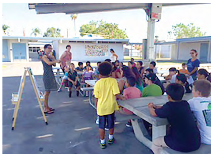
Students rotate through stations to learn specific behavioral expectations for each area of the school.

The purpose statement developed by the Killybrooke team is: Killybrooke Colts are caring and responsible leaders that think creatively in a safe and orderly environment. We are a community that demonstrates respect, responsibility, and kindness—Every person, Every place, Every day! We use the acronym "COLTS" to teach our students that Killybrooke COLTS are: Caring, Organized, Leaders, Thinking Creatively, and Safe.