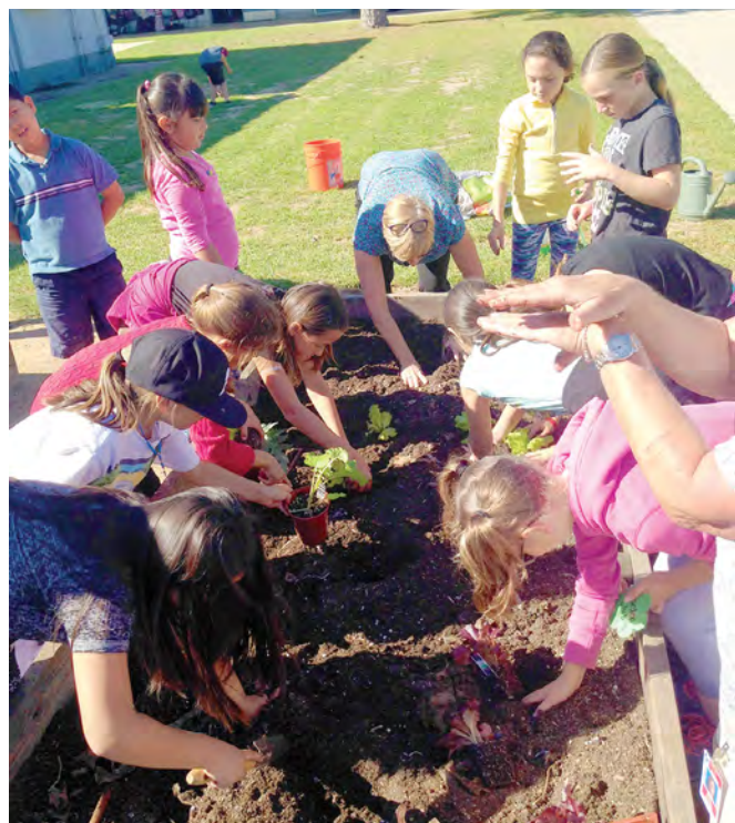
Kaiser's Garden Club adds worms to the soil before planting winter vegetables.

Our Kaiser Knights continue to lead the way towards delicious and caring choices!