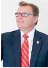
Stephen Mensinger Mayor